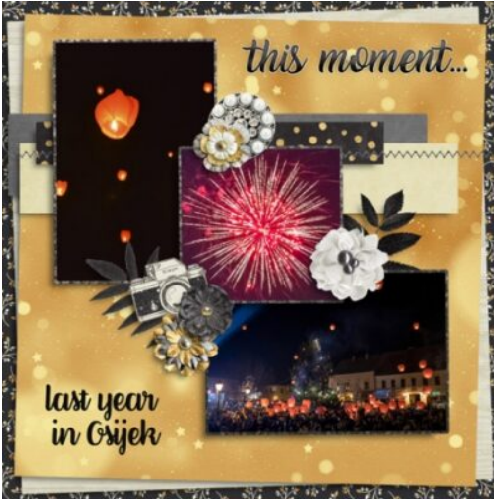
Layout by Andrea