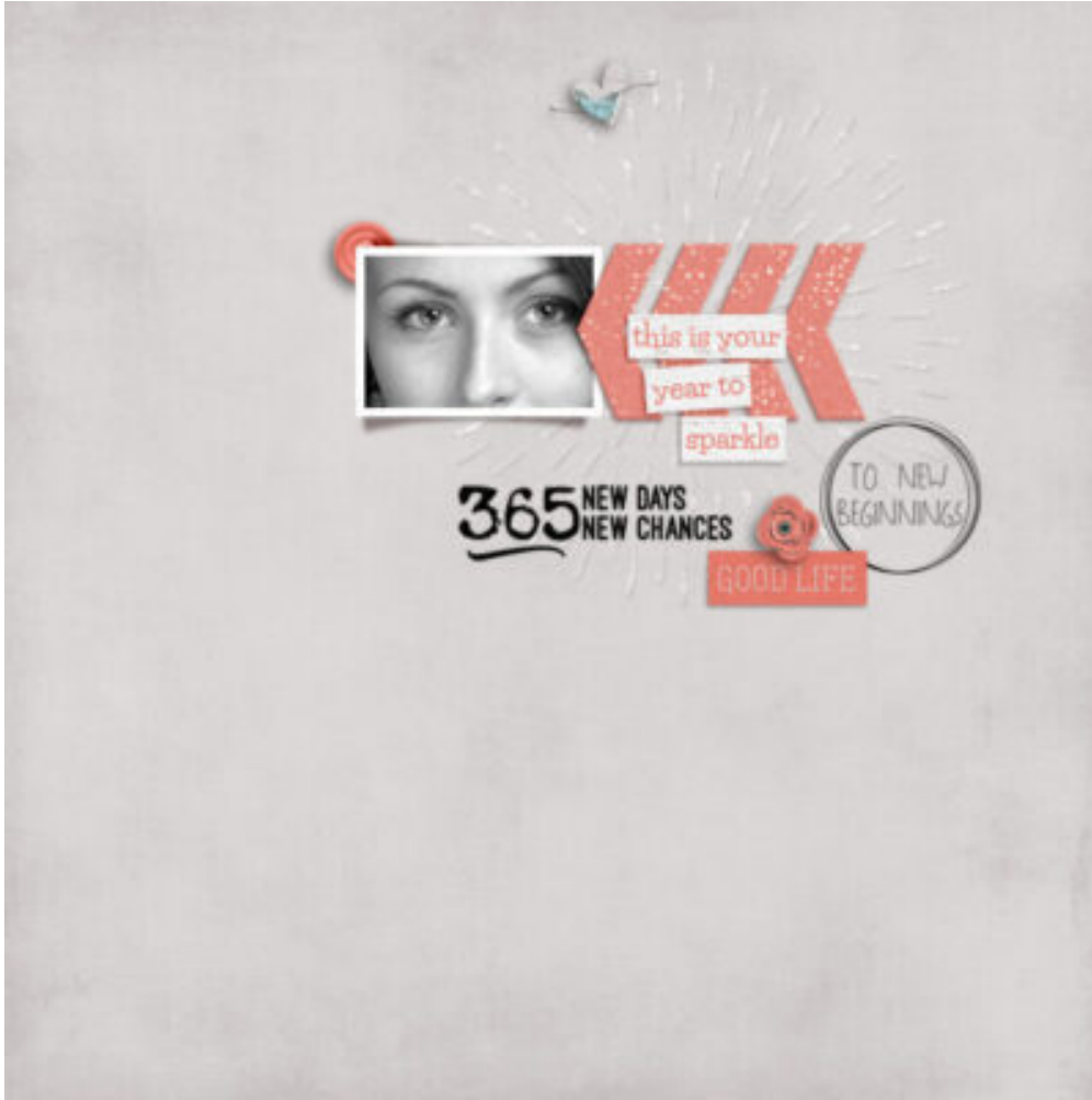
Layout by Sylvia