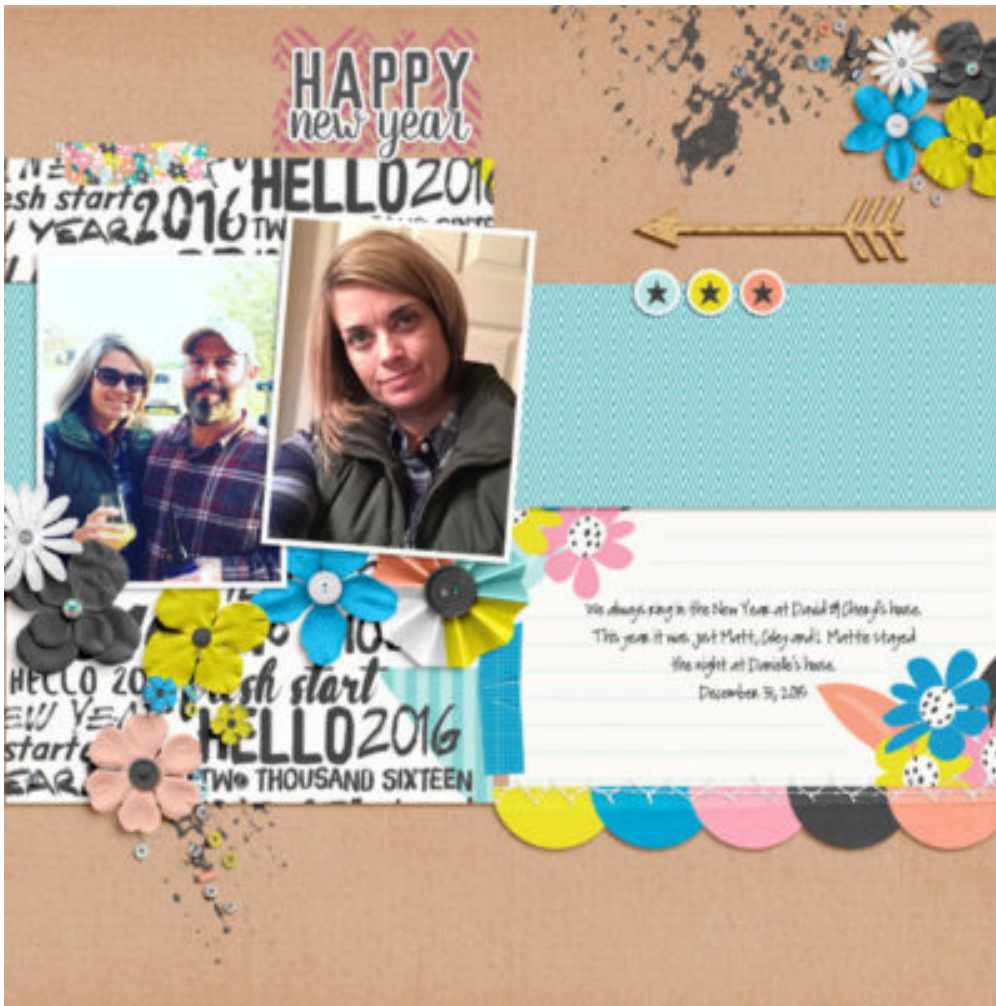
Page by Carrie1977