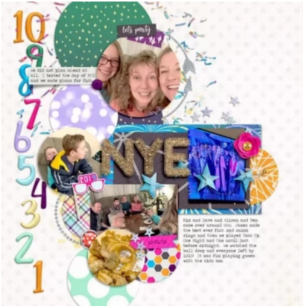
Layout by Karen