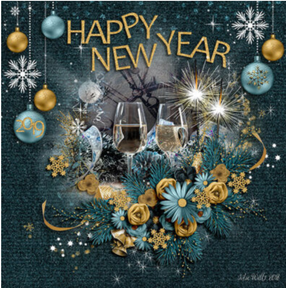
Layout by Julie