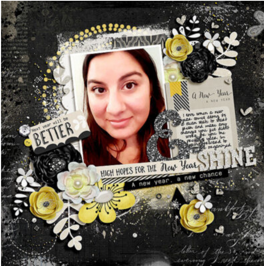
Layout by Mary