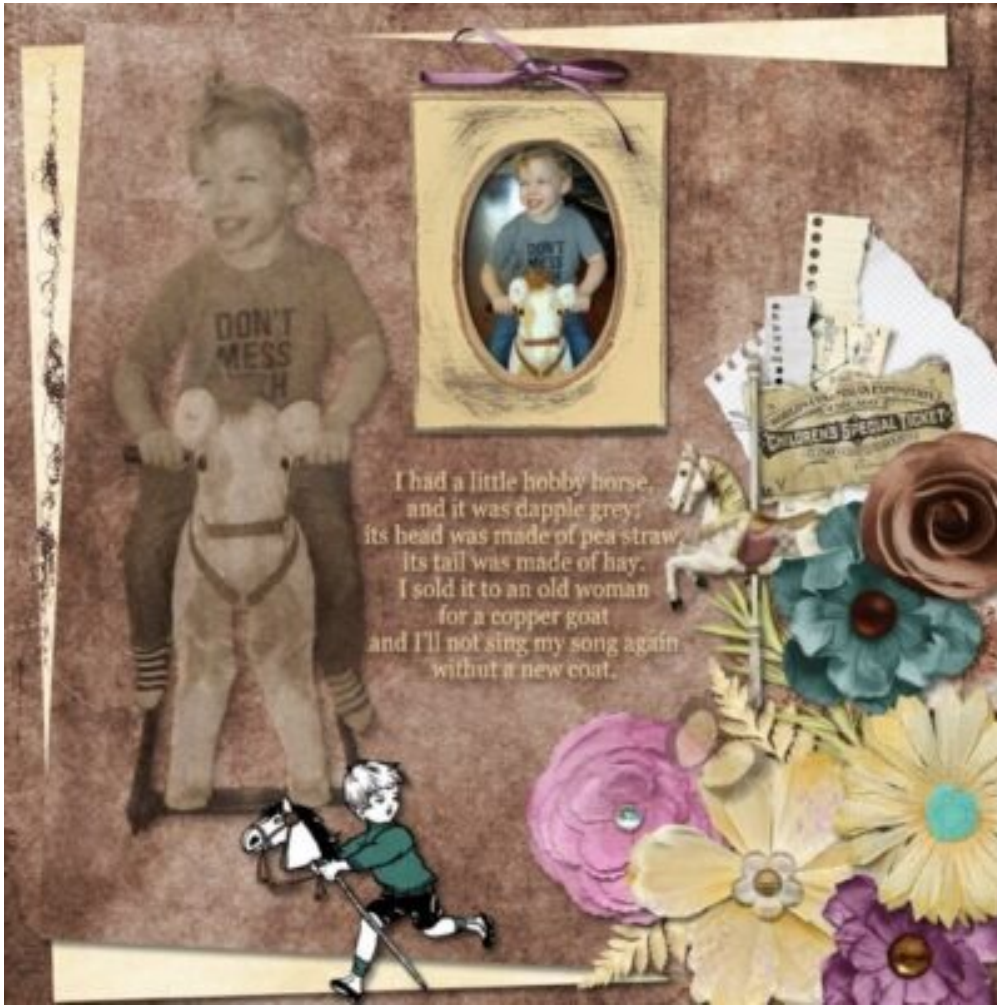
Layout by Maureen