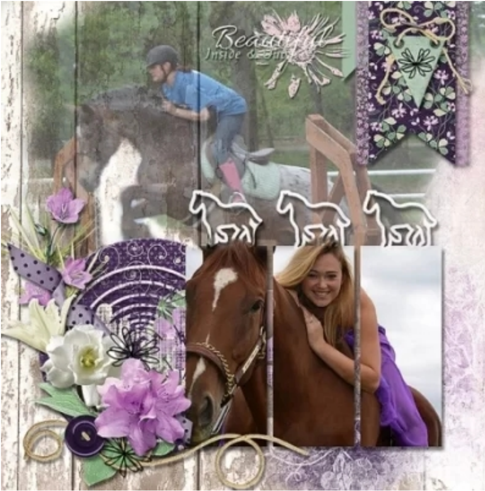
Layout by Cynthia