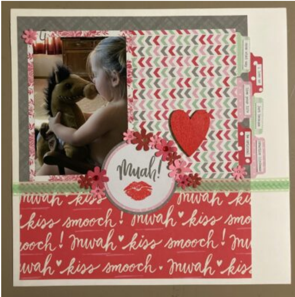
Page by ArtsyLC