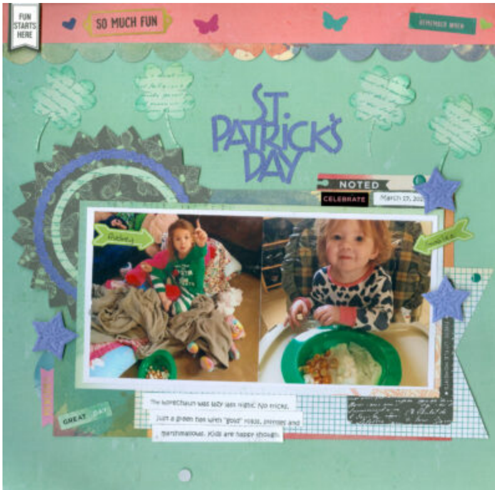
Page by Pam