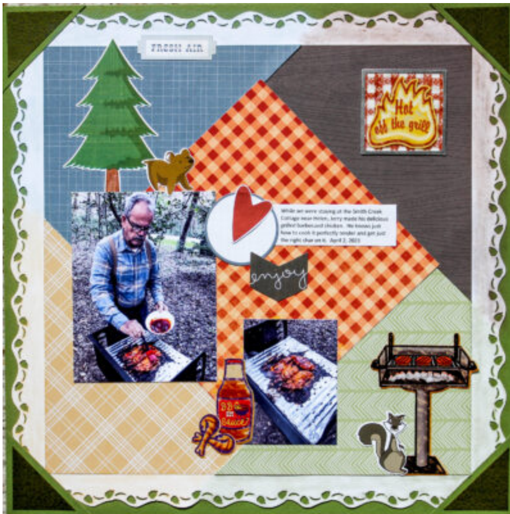
Layout by Betty