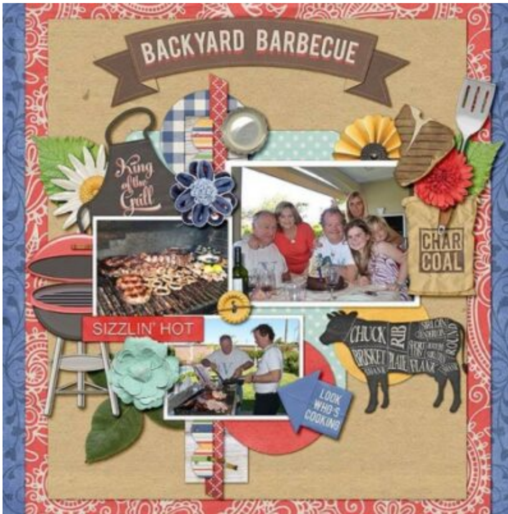
Layout by Marina