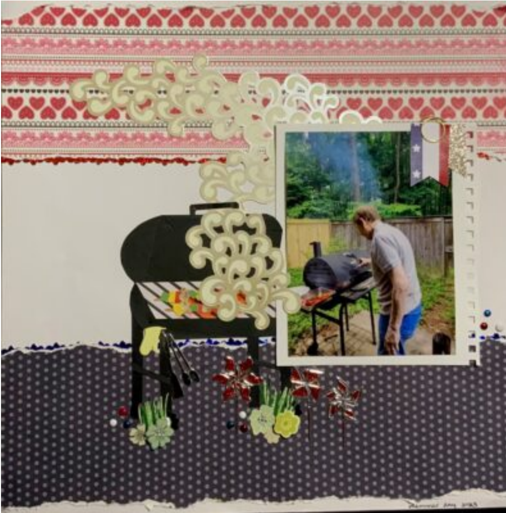
Layout by Lis