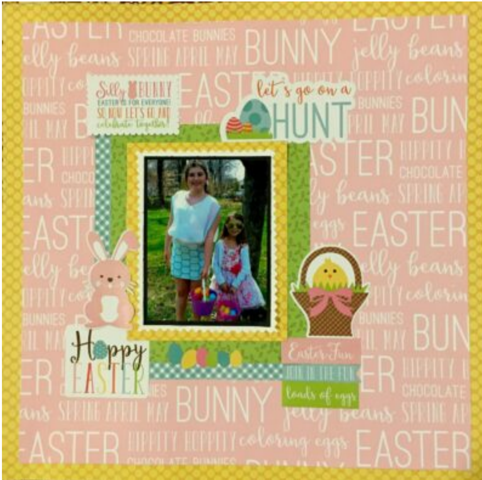
Layout by GrammyScrapper