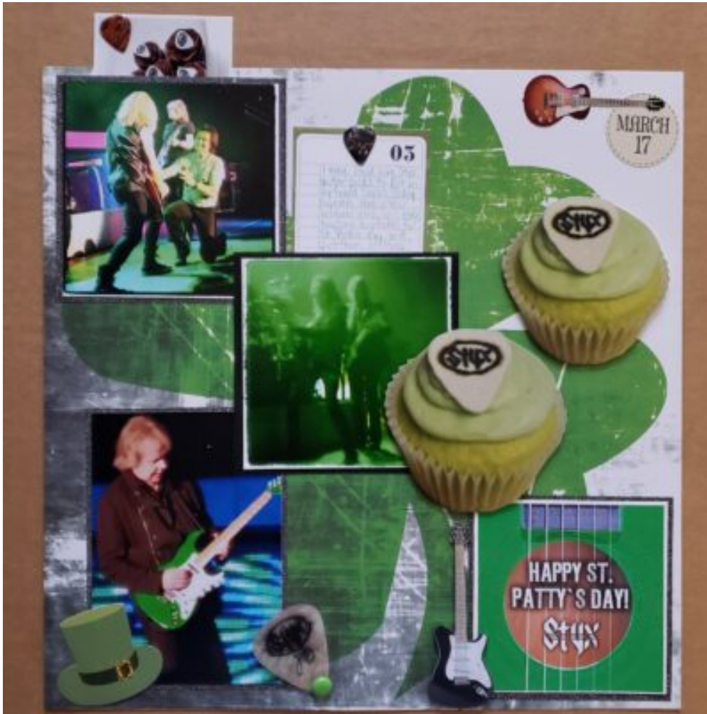
Layout by Patti