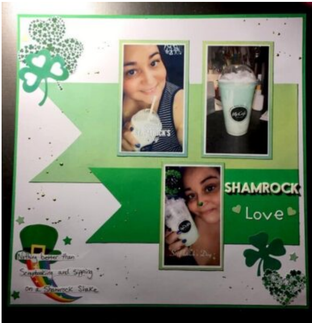
Layout by Ozelle