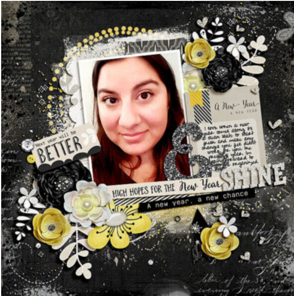
Layout by Mary