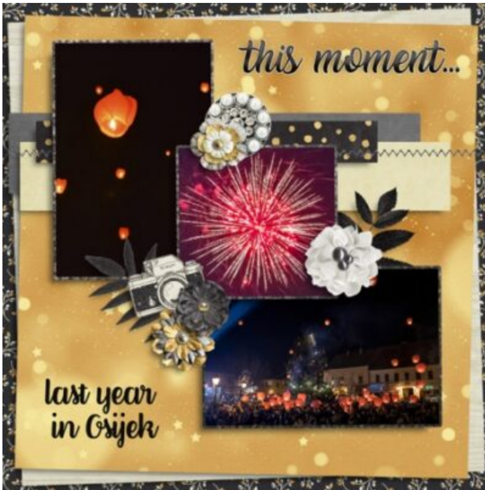
Layout by Andrea