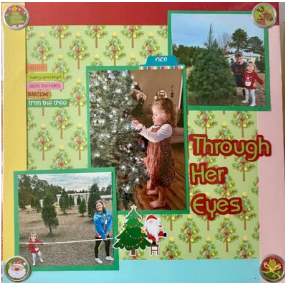
Layout by Debbie