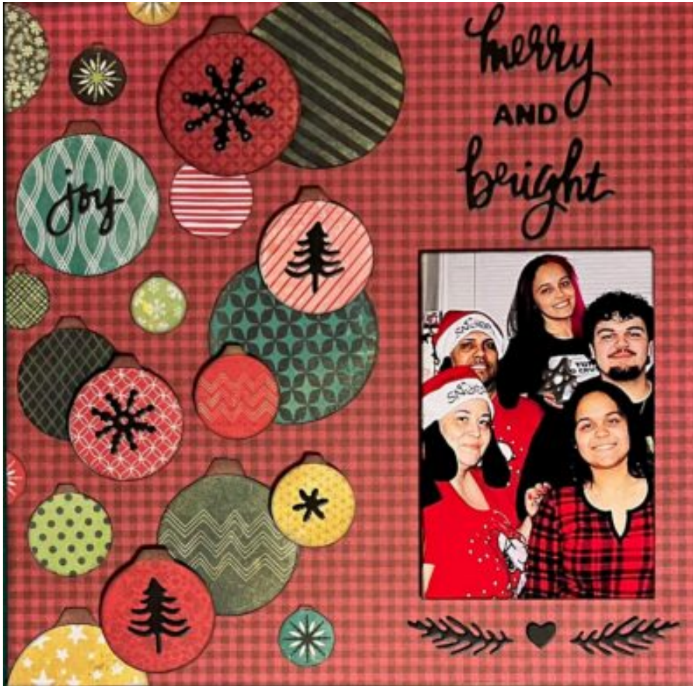
Layout by Ozelle