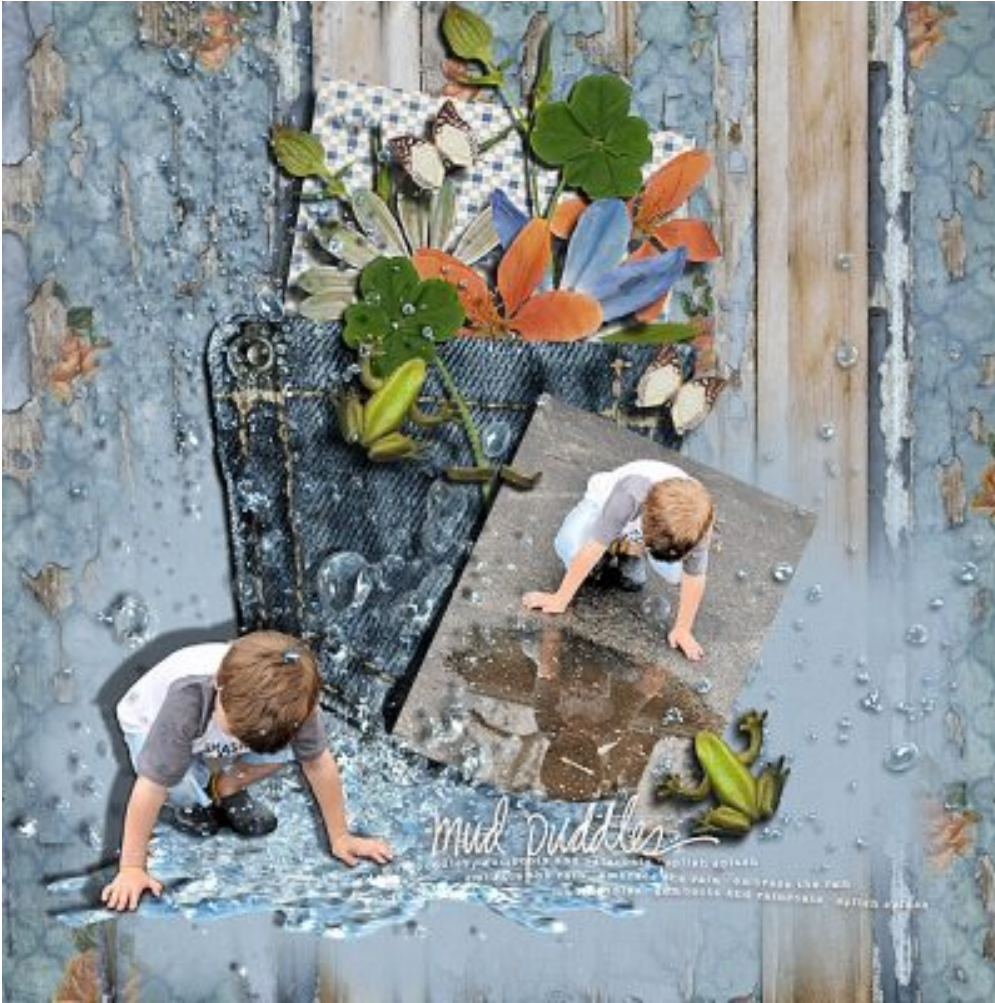
Layout by Ellaspaces