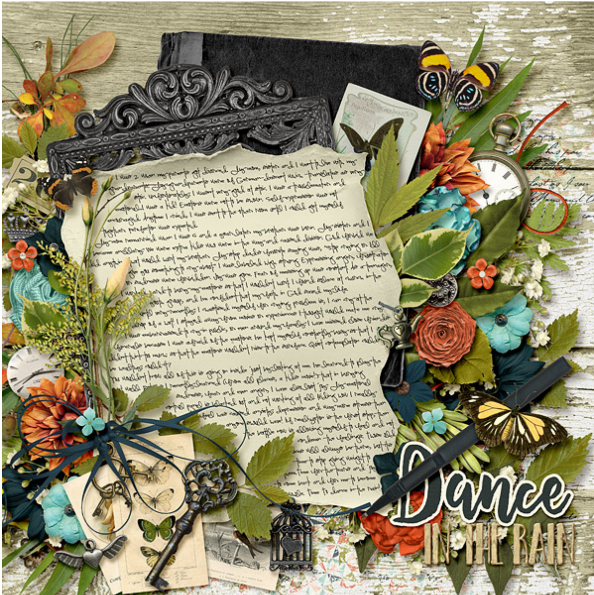
Layout by Tammy