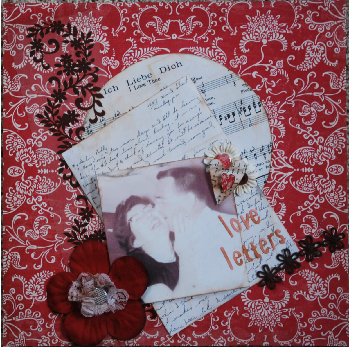
Layout by Jean