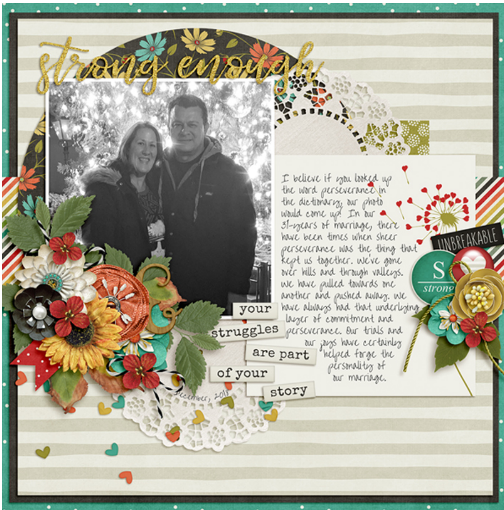
Layout by Tammy