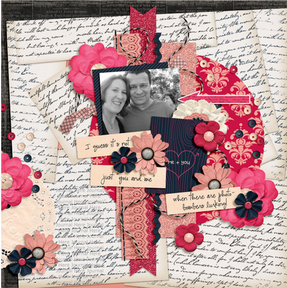
Page by Tammy