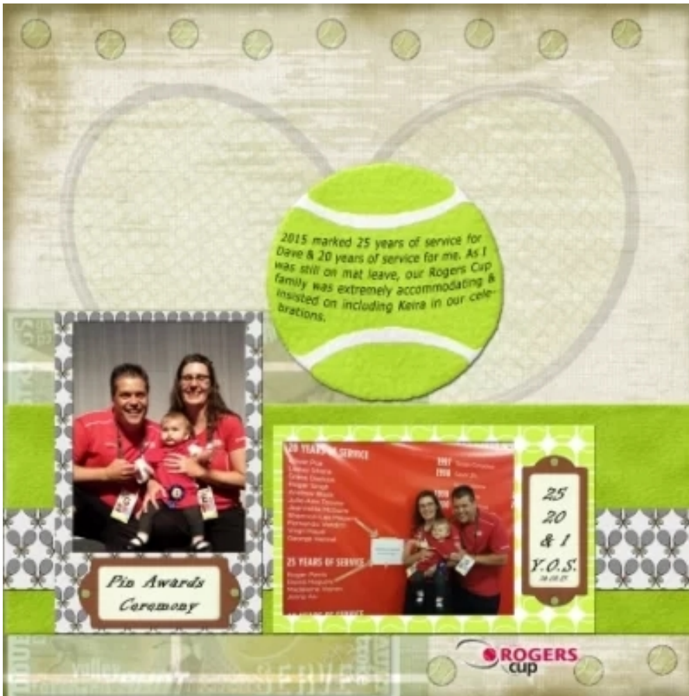
Layout by Shannon