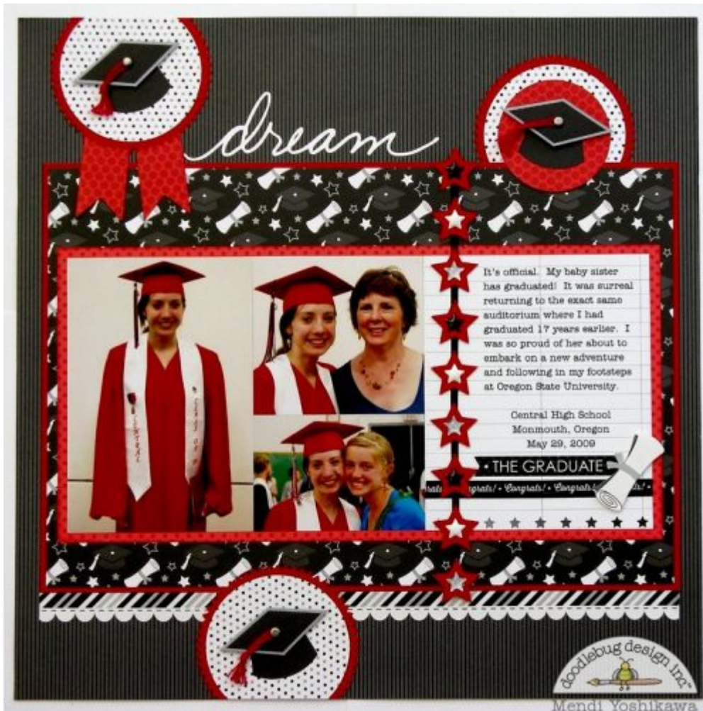
Layout by Mendi