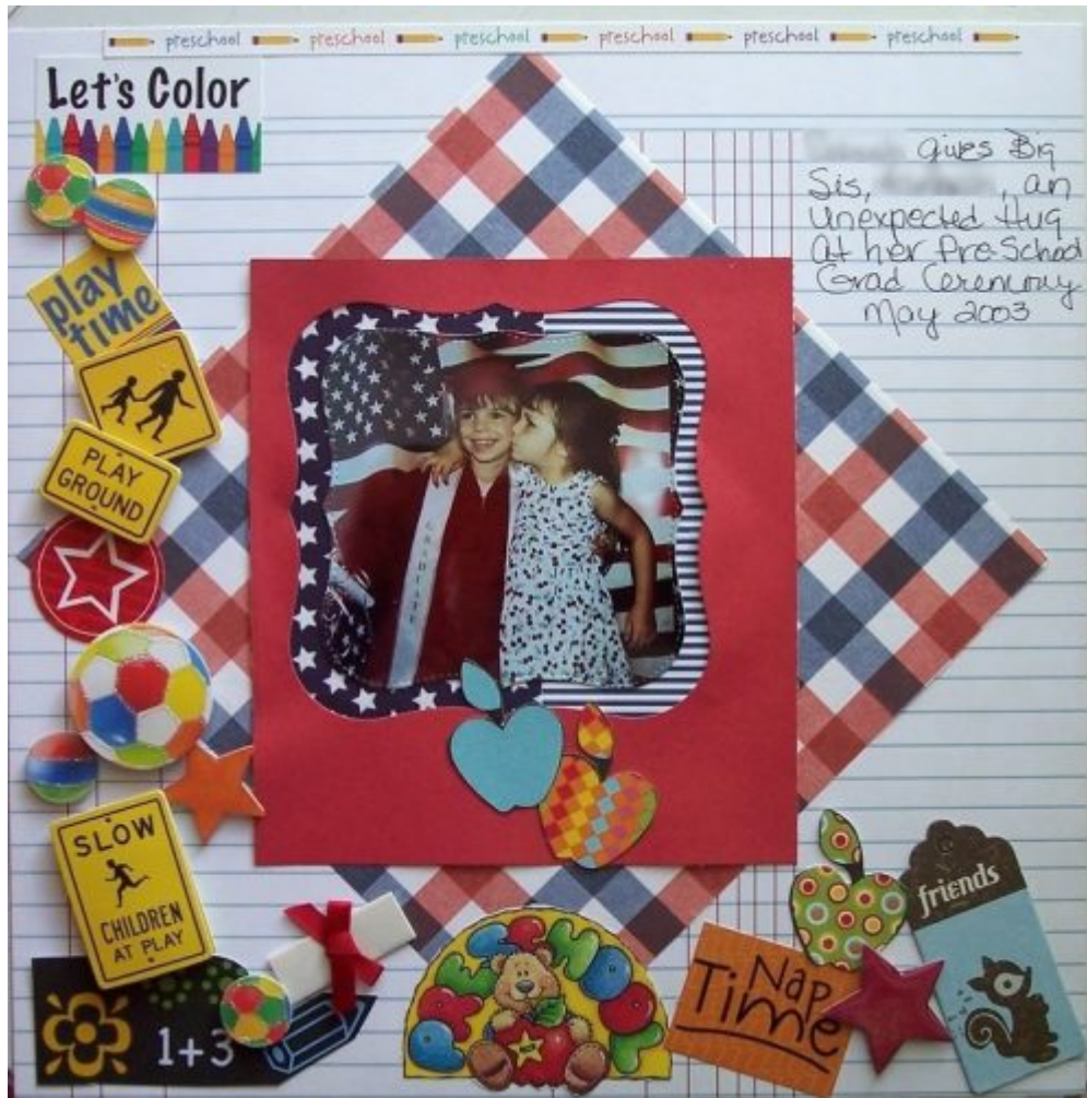
Layout by Betsey