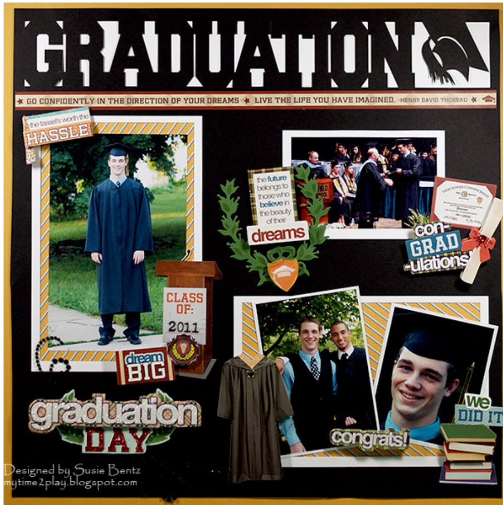
Layout by Susie