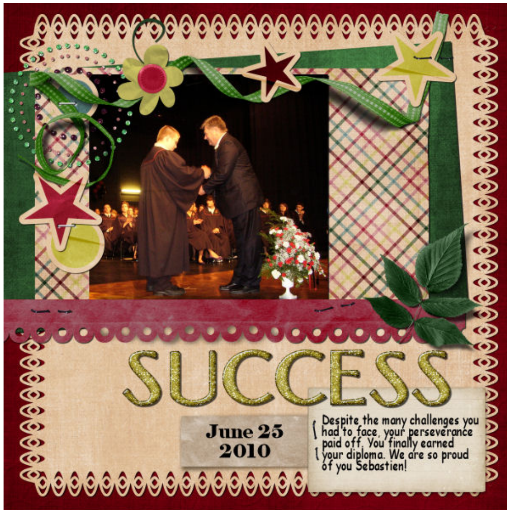
Layout by Cassel