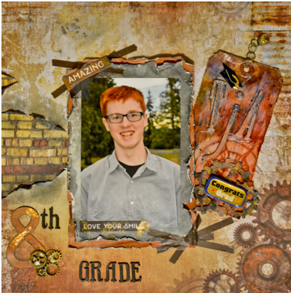
Layout by Dianne