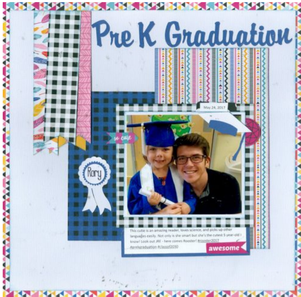
Layout by Pam