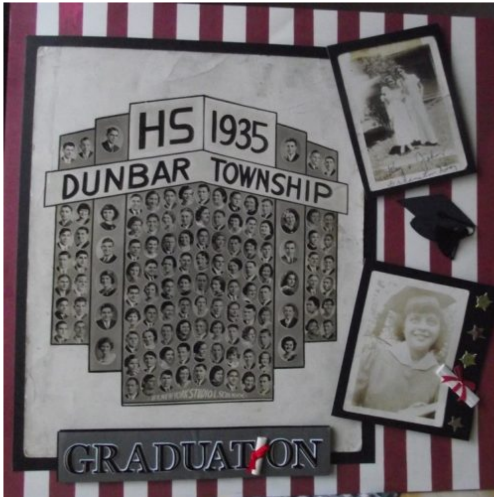
Layout by PAMemoryKeeper