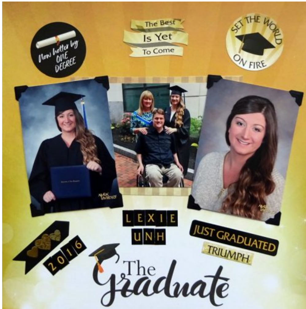
Layout by Tisha