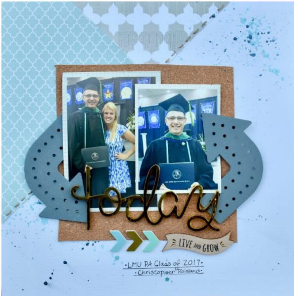
Layout by Bethany