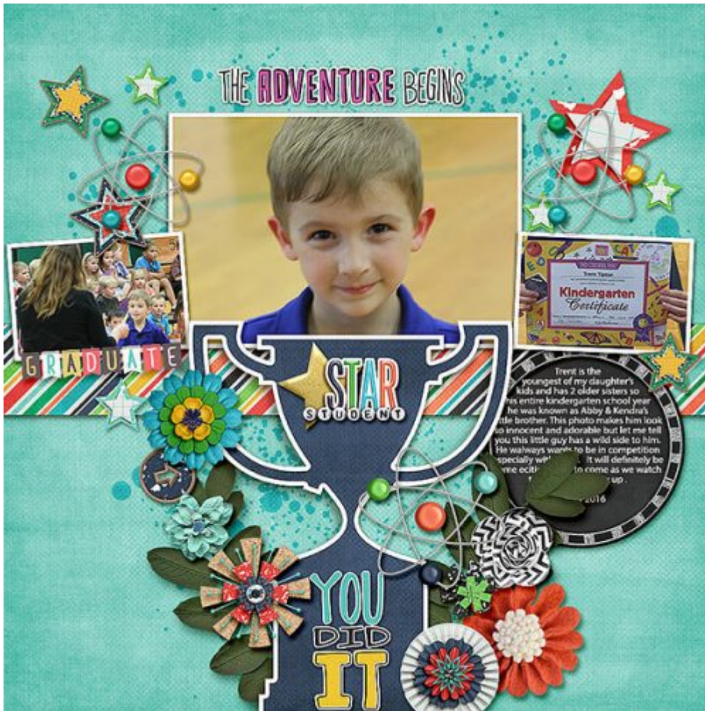
Page by Debbie