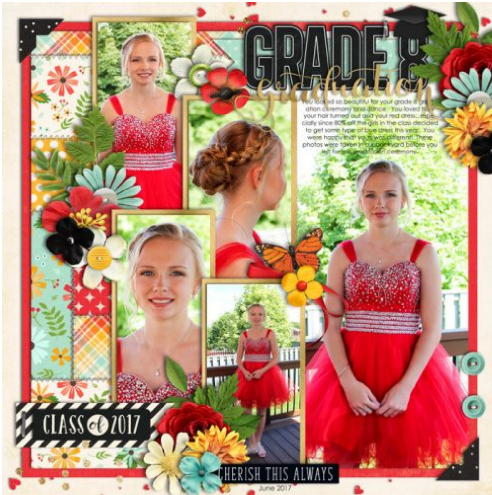
Layout by Cindy