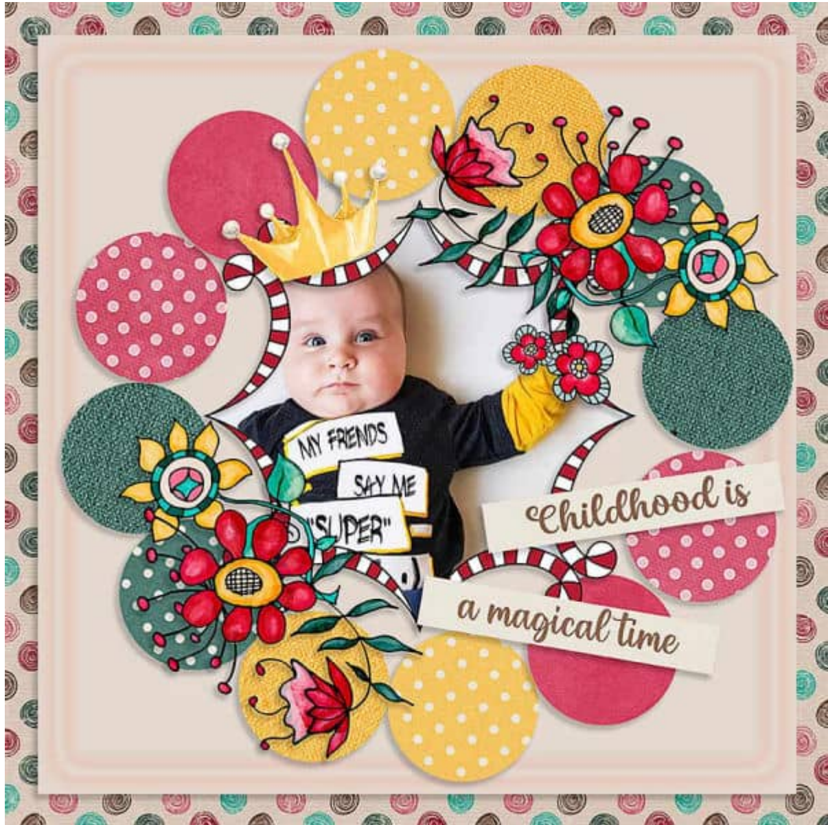
Layout by Valentina Zotova