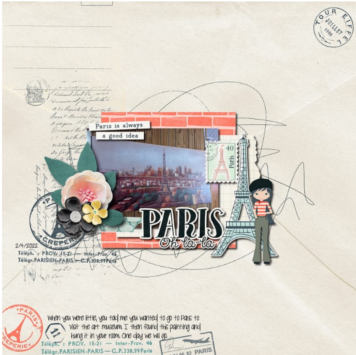
Layout from Ophie James