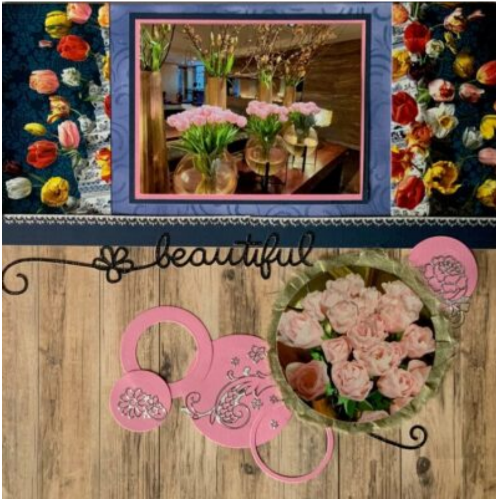
Layout by Lis