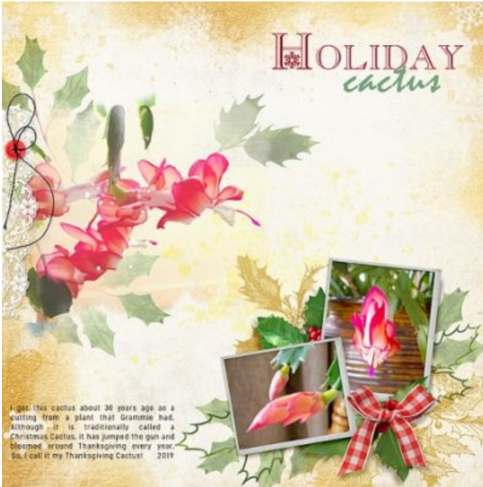
Layout by Angie