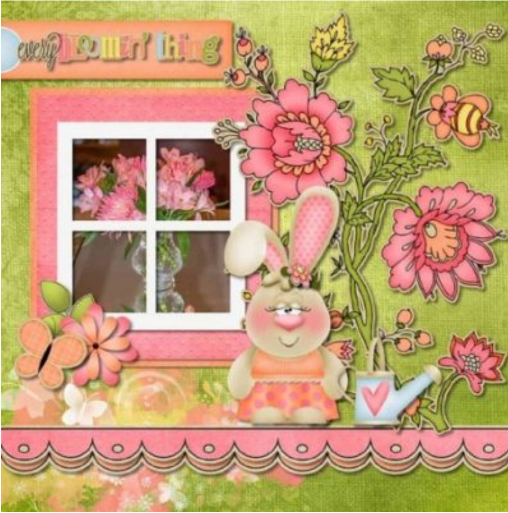
Page by Janice