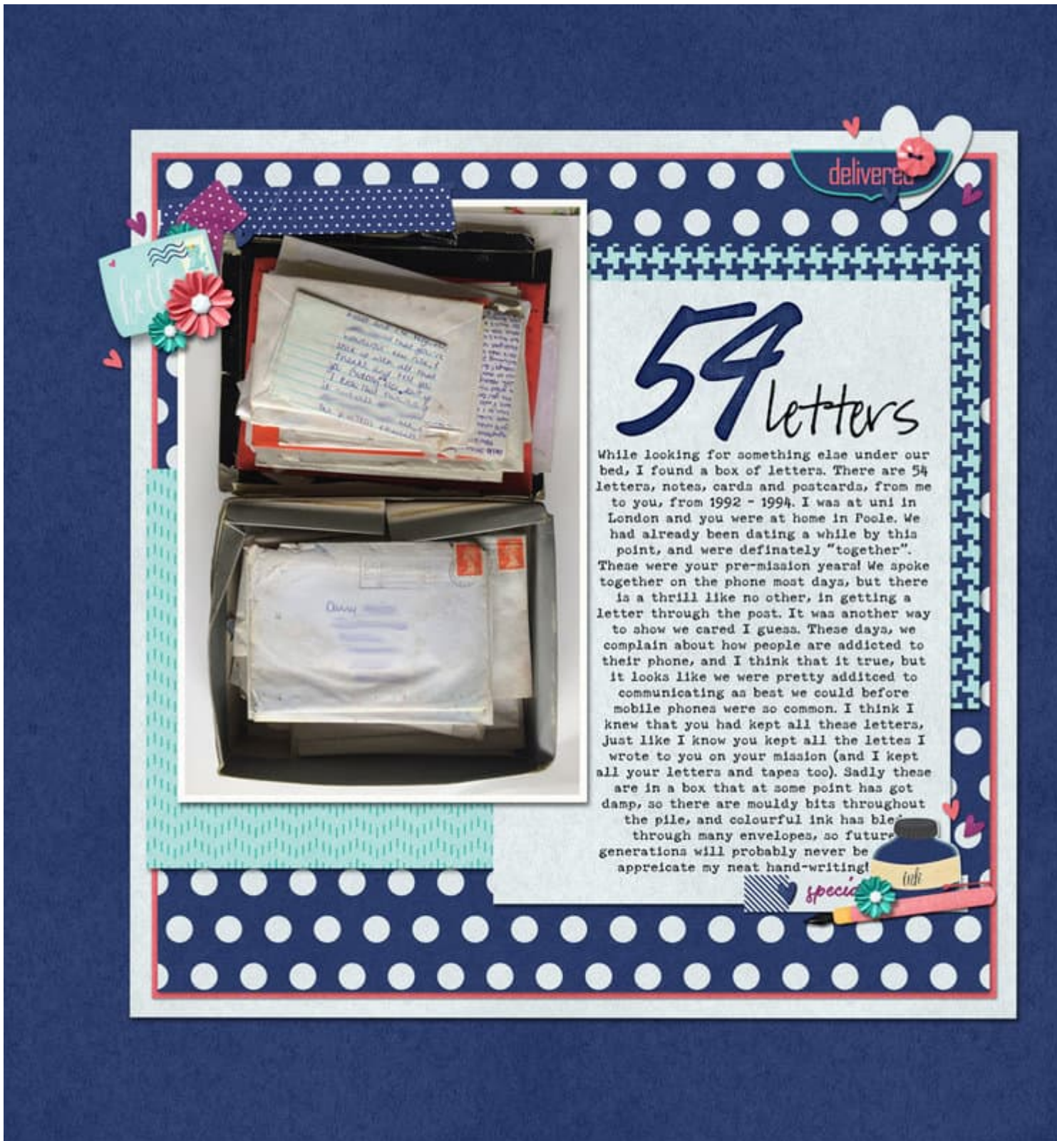
Layout by Corrin