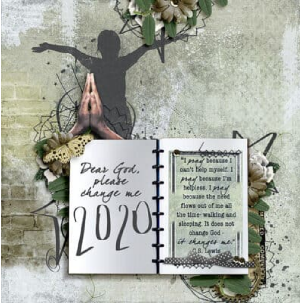
Page by cutiejo1