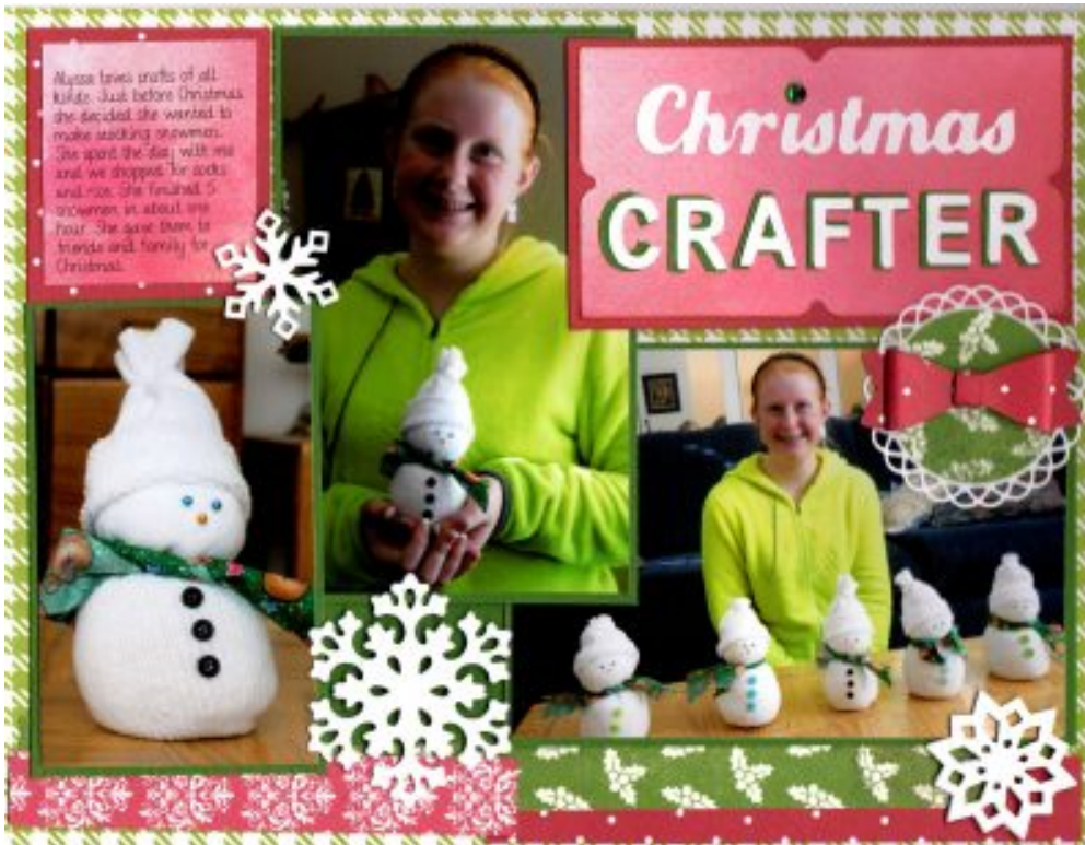
Layout by Nylene Motherbambi