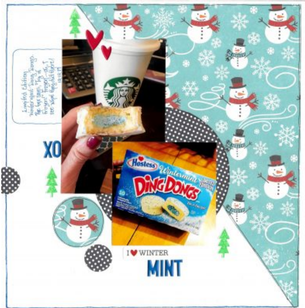
Layout by Doreena