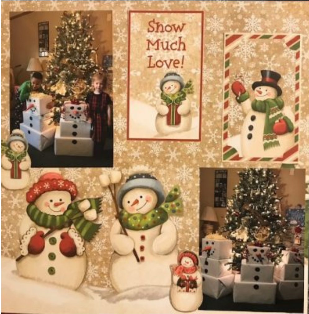
Layout by Janet