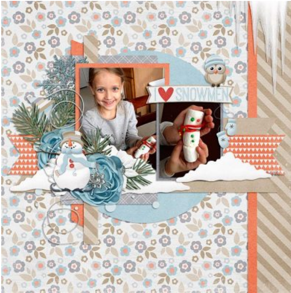
Page by Cassie