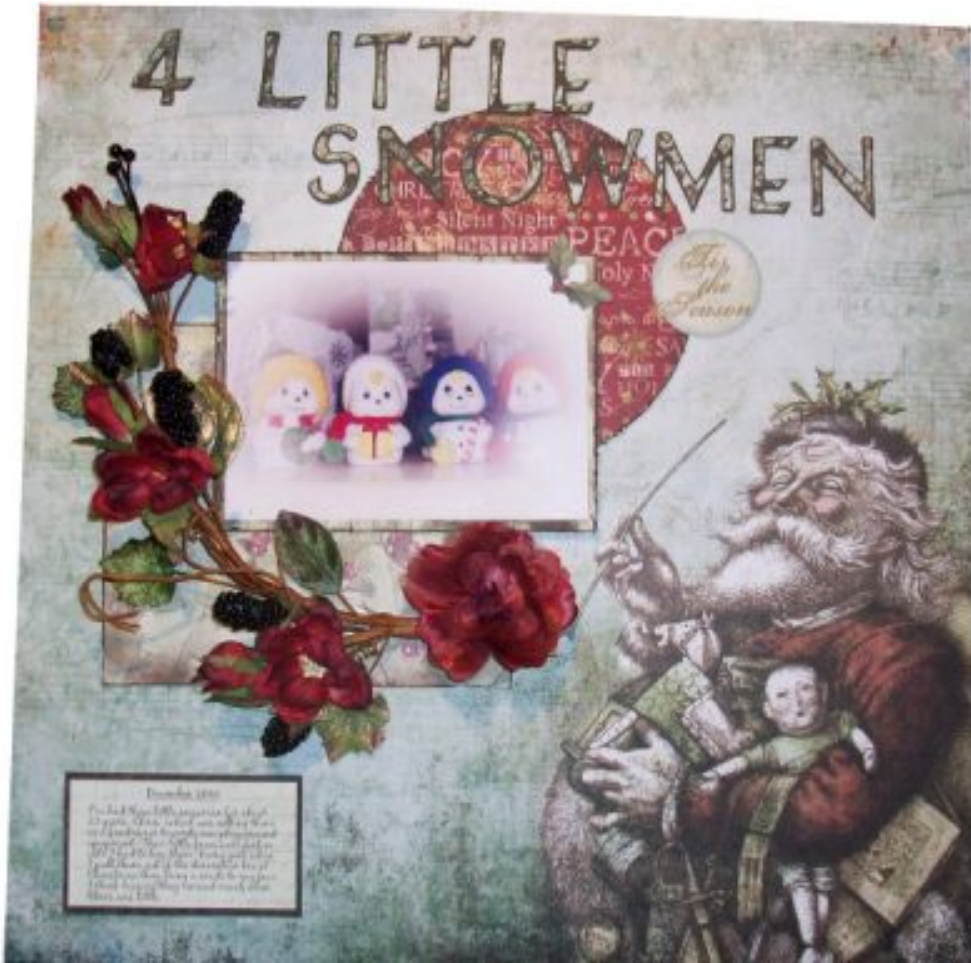
Page by StephD