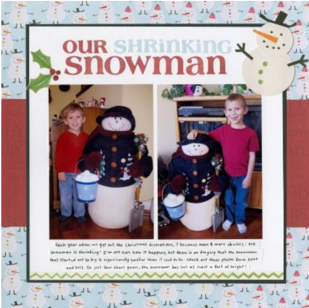
Layout by Cindy312