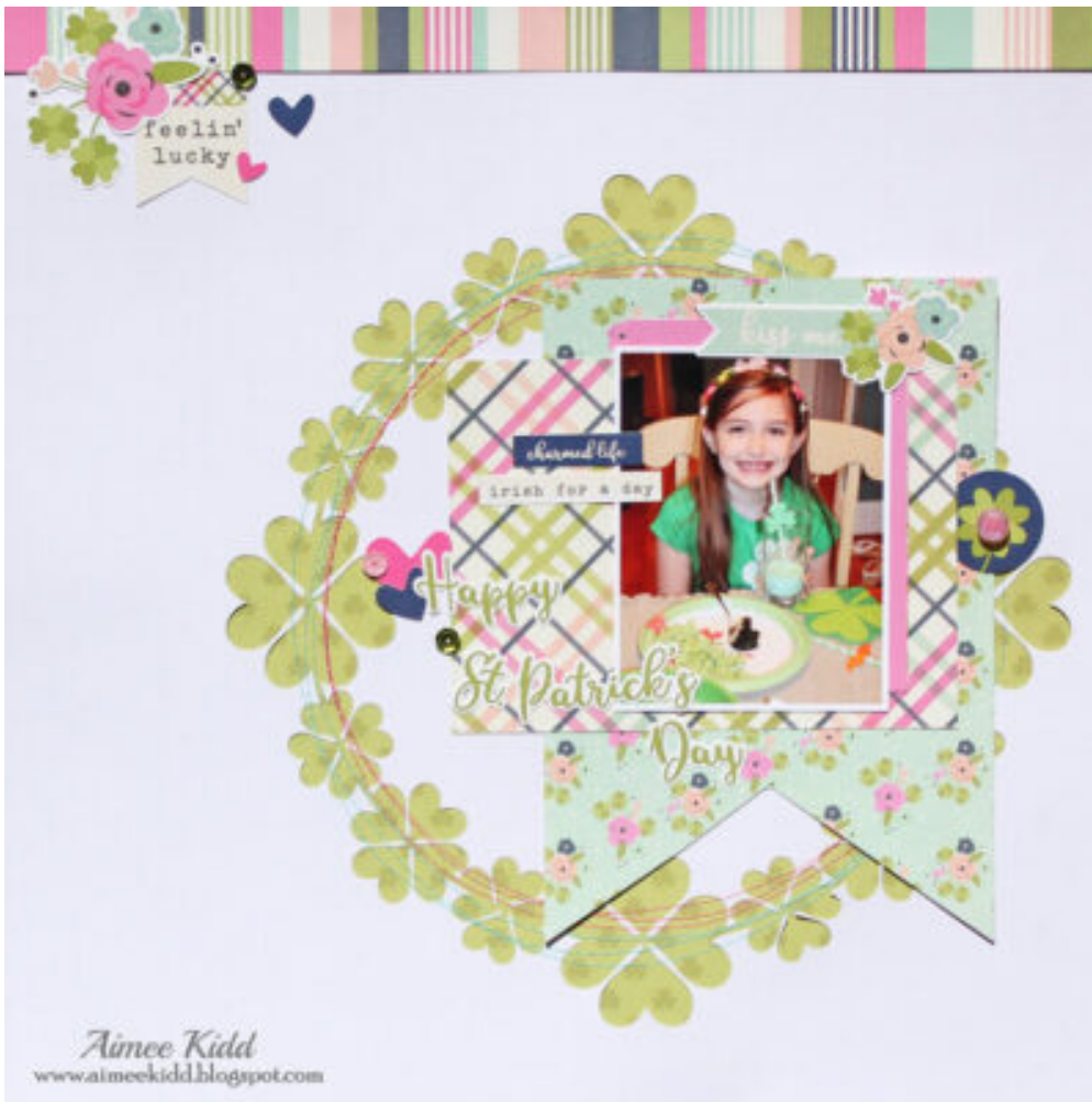
Layout by Aimee