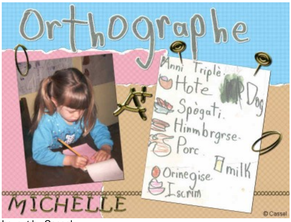
Layout by Cassel

In this layout, I used the actual writing from my daughter and created an alpha. Did you ever do that? Keep an eye for another blog post with a tutorial on how to do that.