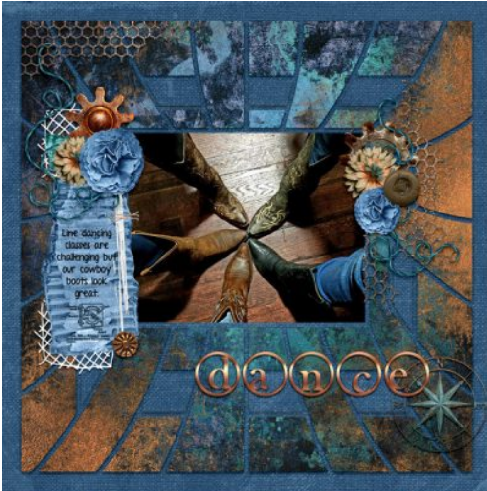
Layout by Hawkgirl