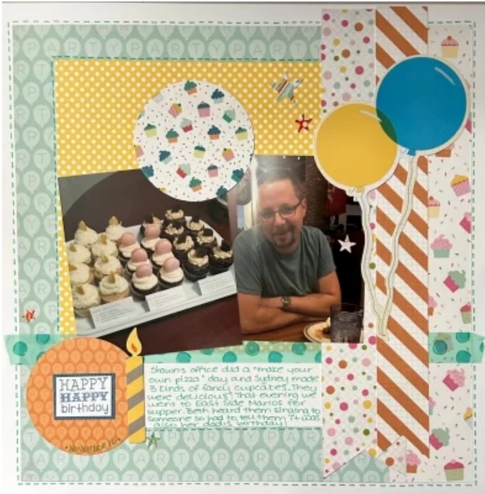
Project by Scrapanda