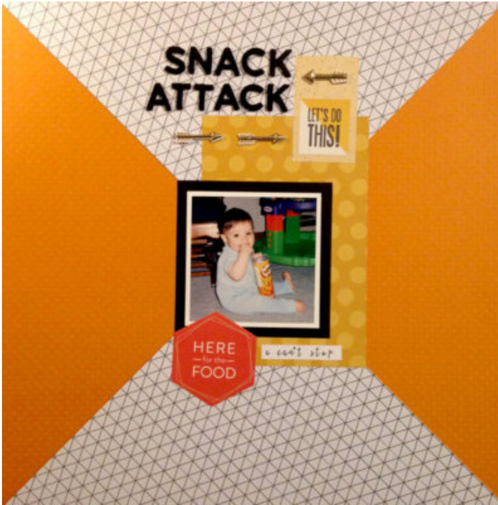
Layout by ArtsyLC