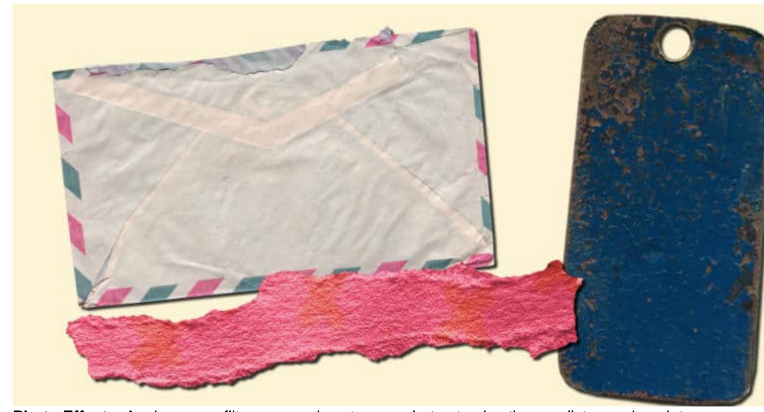
Photo Effects: Apply grungy filters or overlays to your photos to give them a distressed or vintage