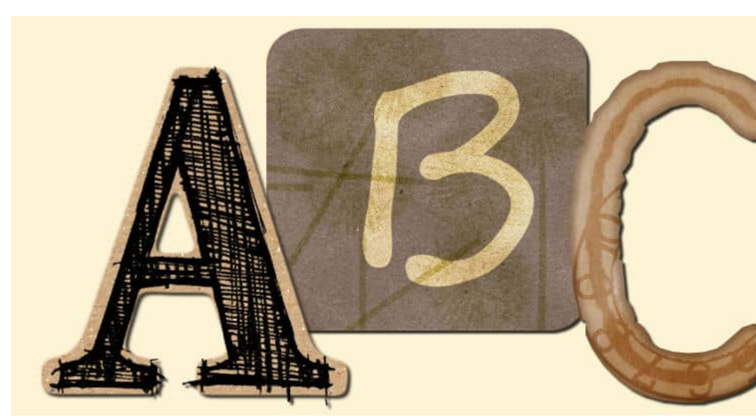
Embellishments : Grungy embellishments can include elements like distressed postage stamps, torn pieces of paper, ripped fabric, rusty gears, splatters, stains, or ink blots. These elements can add a sense of texture and dimension to your scrapbook pages.