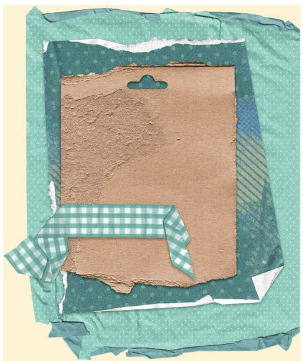
Text Elements : Use grungy fonts or apply grungy effects to your text, such as adding rough textures, scratches, or smudges. This can help the text blend well with the overall grunge theme.