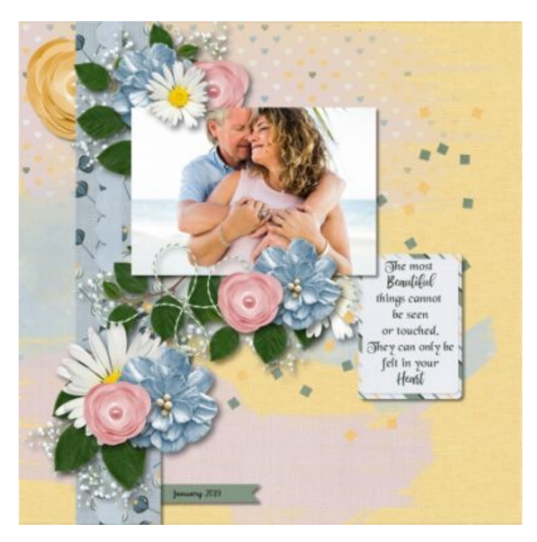
Layout by Ruth