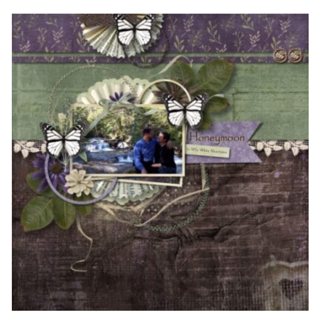
Layout by Rebecca