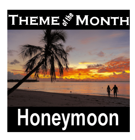
Theme – Honeymoon