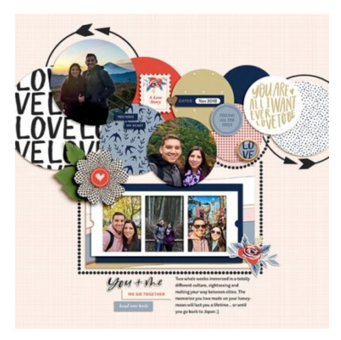
Layout by Stacia