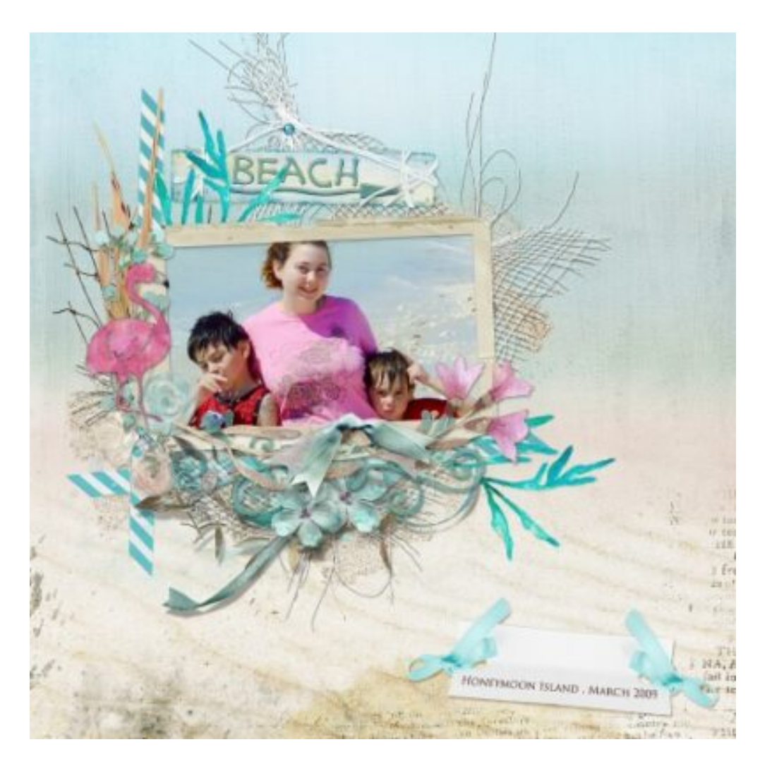
Layout by Jessica