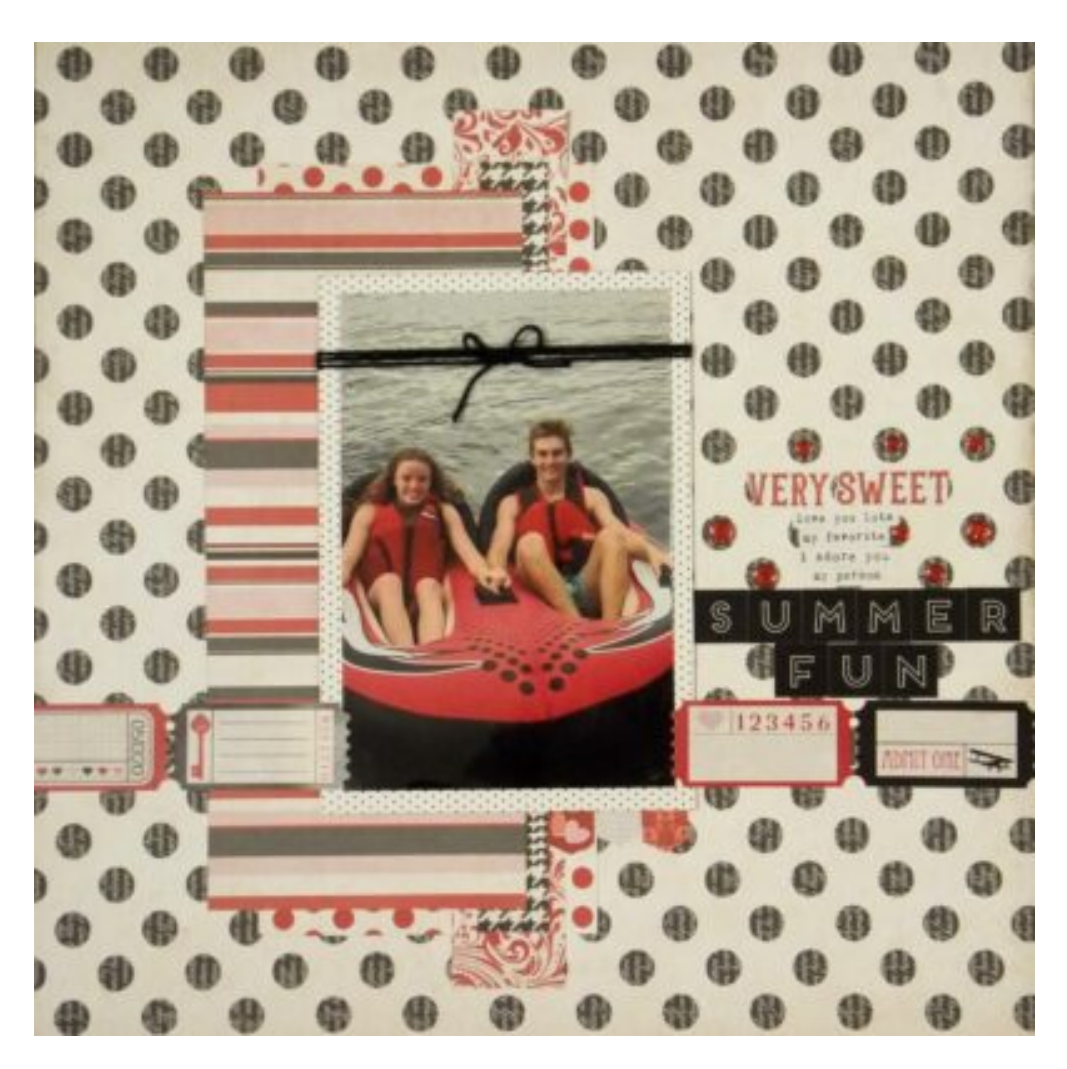
Page by Bev