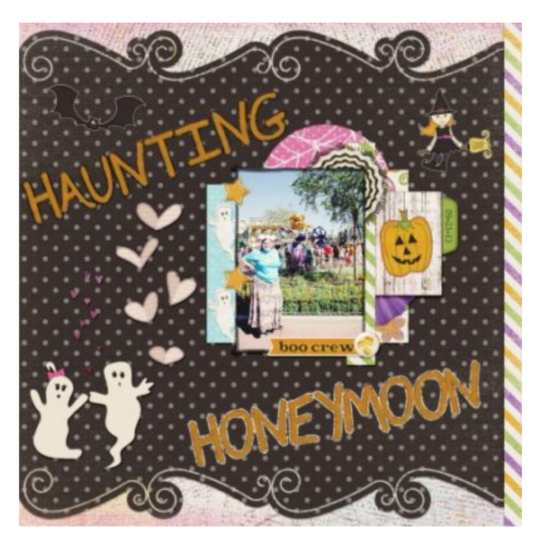
Layout by Brenda