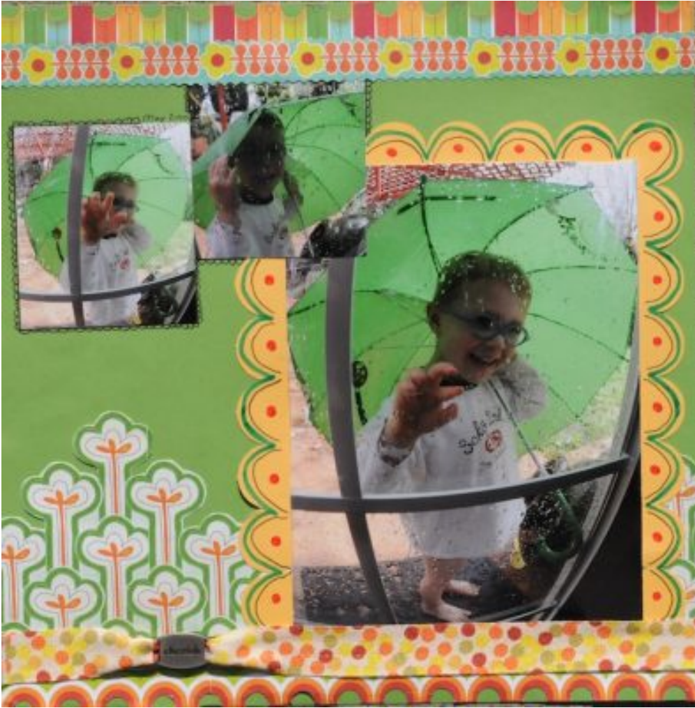
Layout by Amy