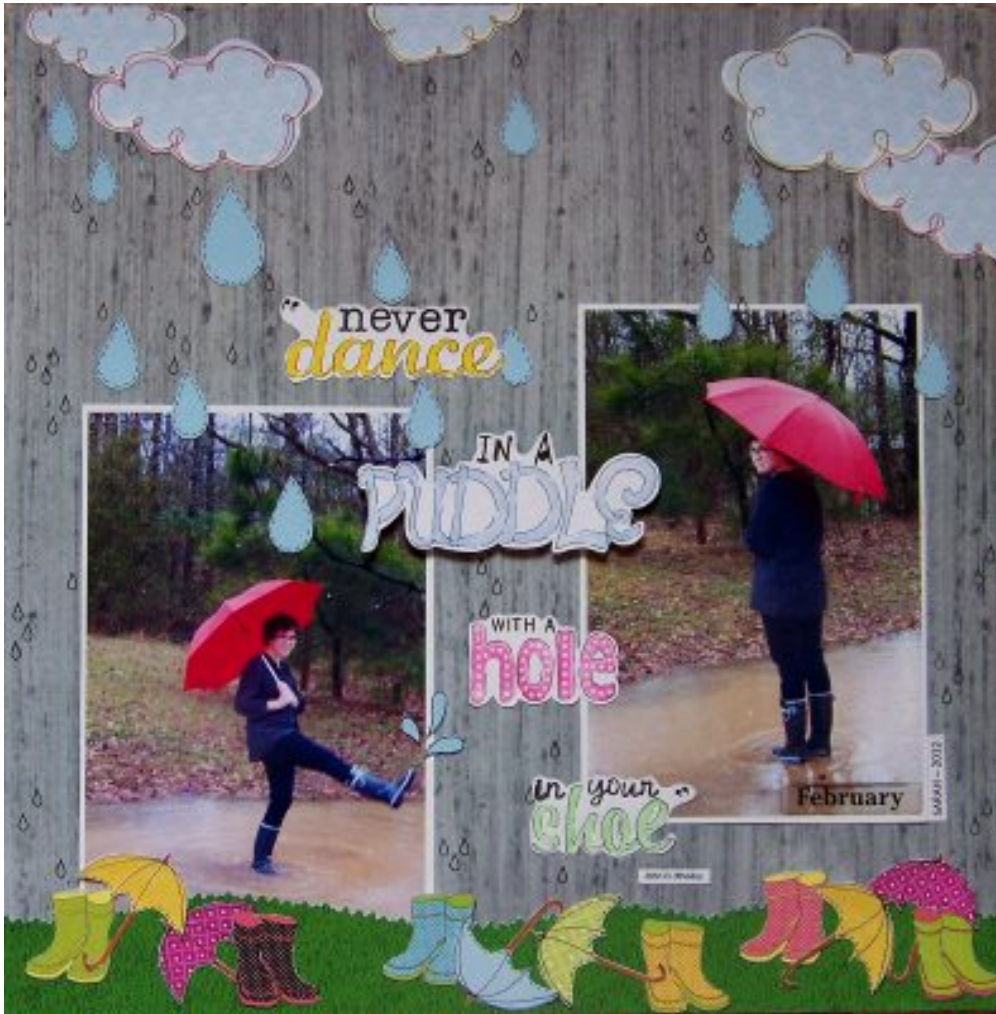
Layout by Betty