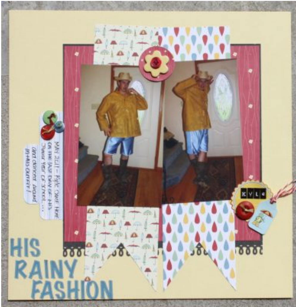
Layout by Joannie