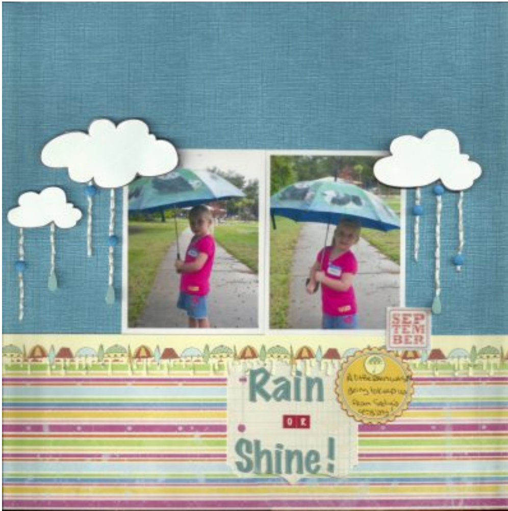
Layout by Anna