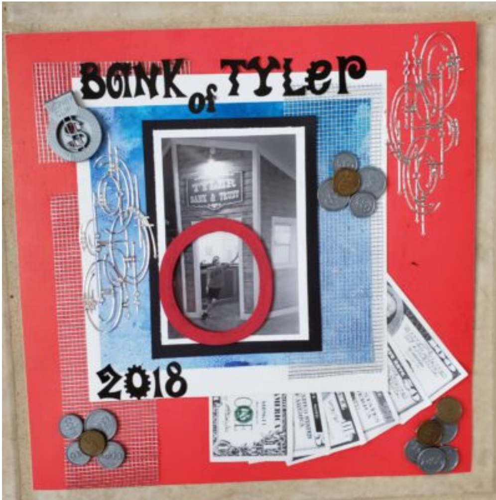
Layout by Lovette