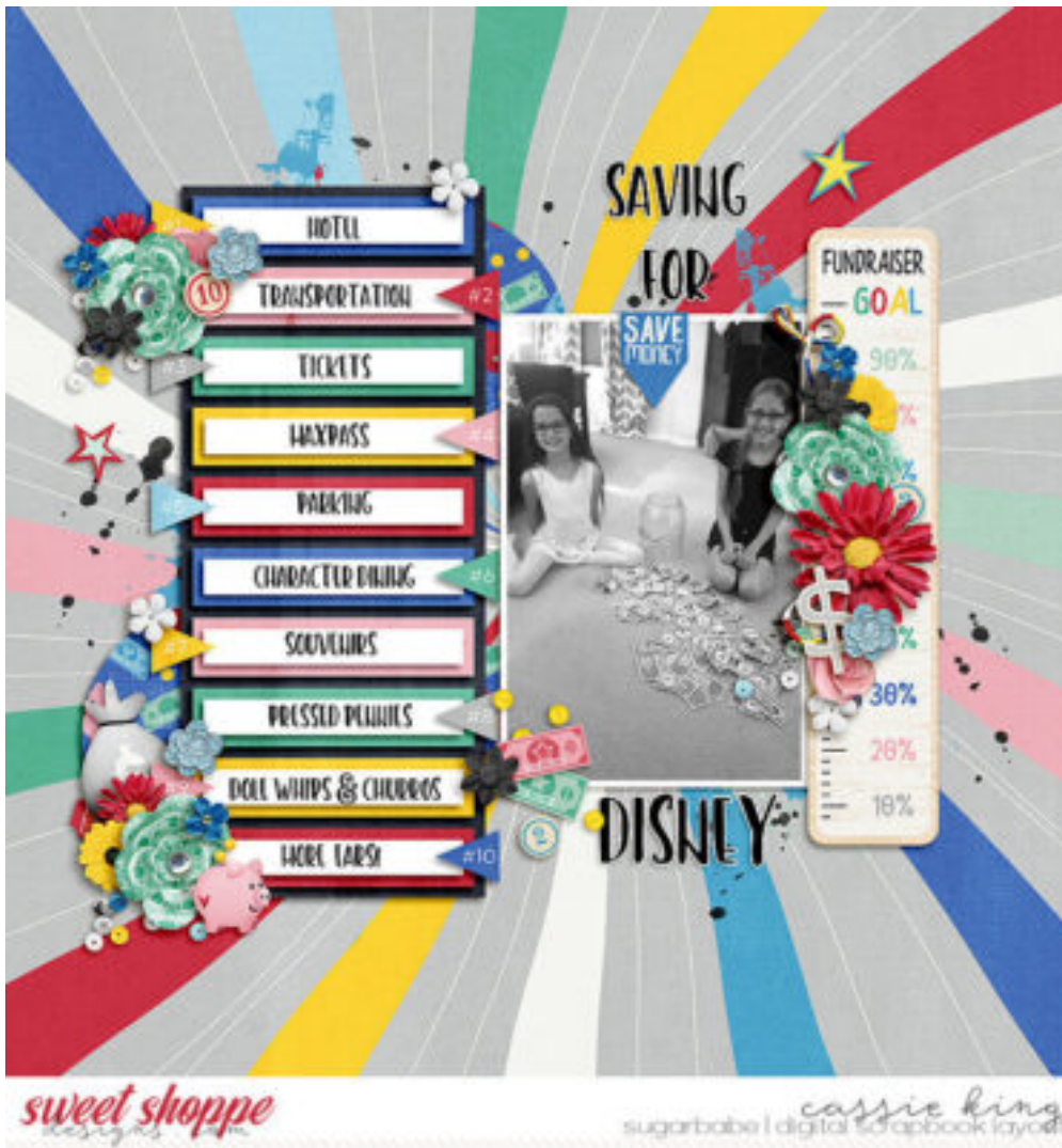
Layout by Cassie