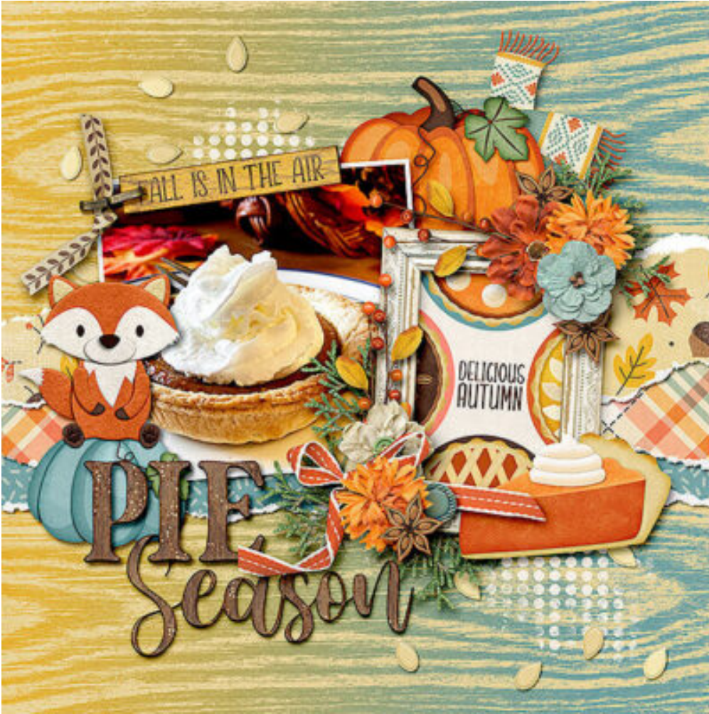
Layout by AmaneseFe