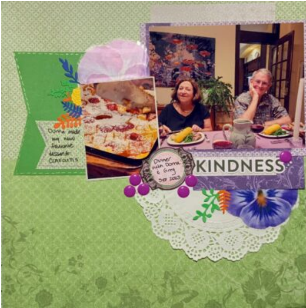
Layout by Lis