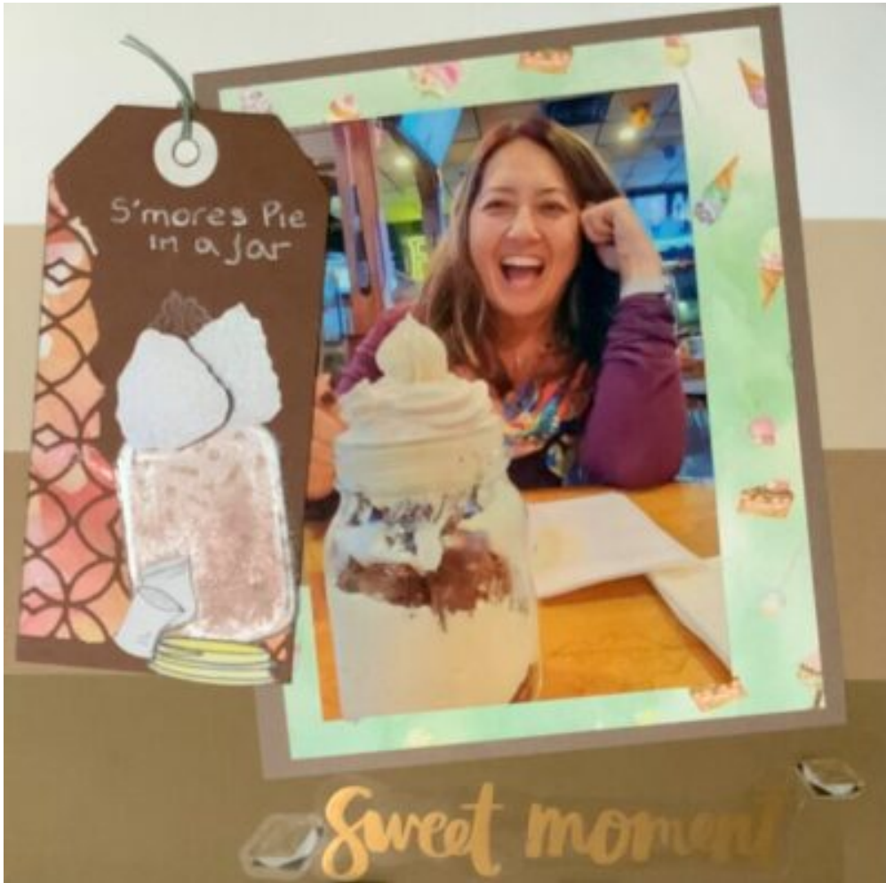
Layout by Lis