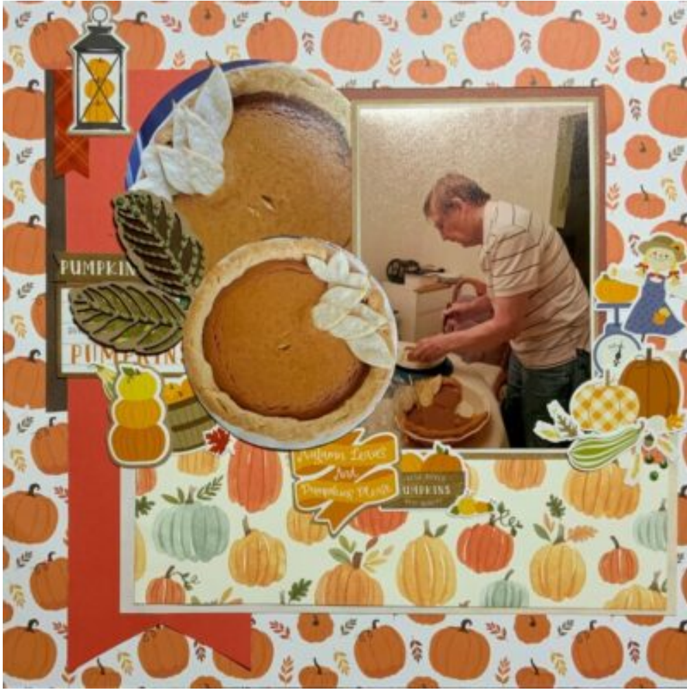
Layout by Lis