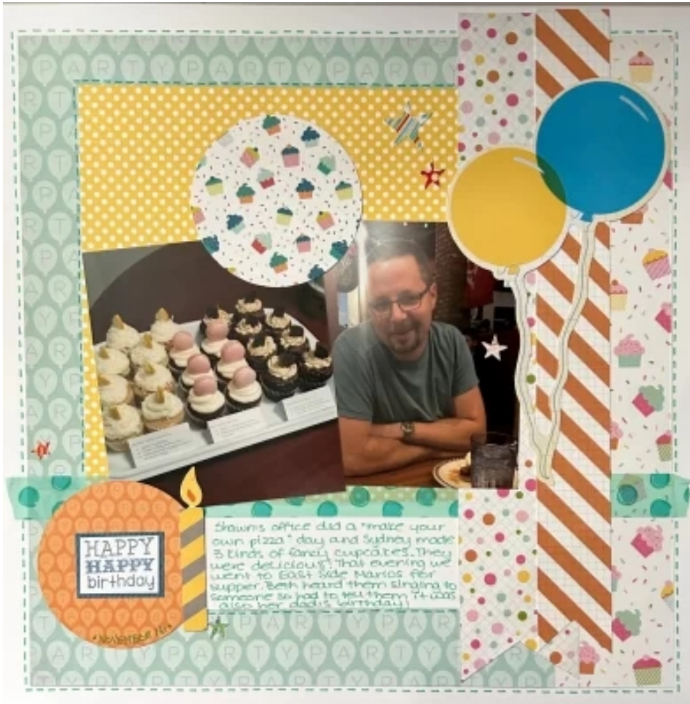
Project by Scrapanda