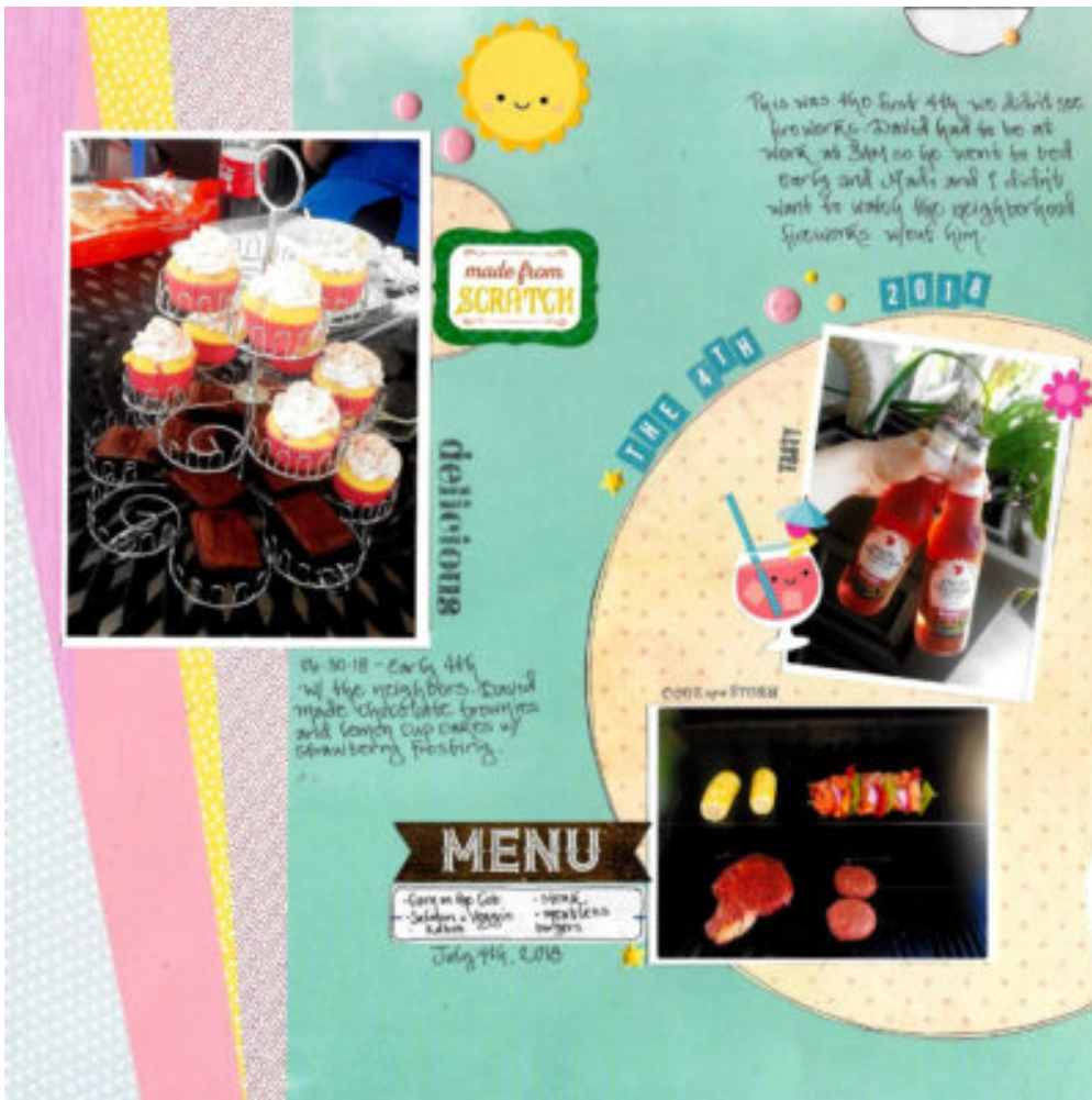
Layout by Doreena