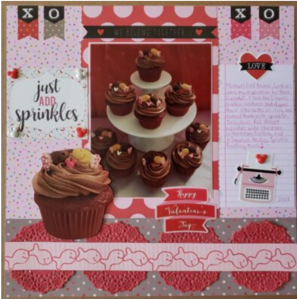
Layout by Patti