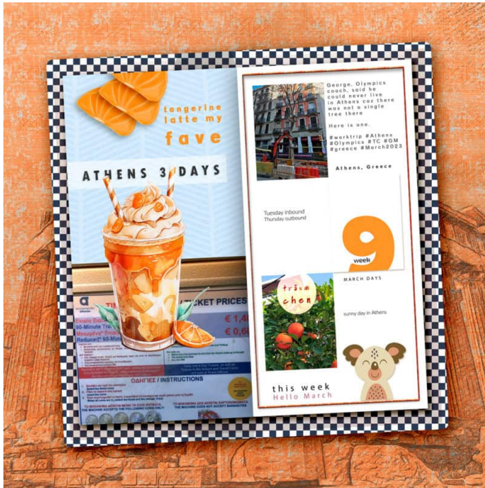
Layout from Bina Greene