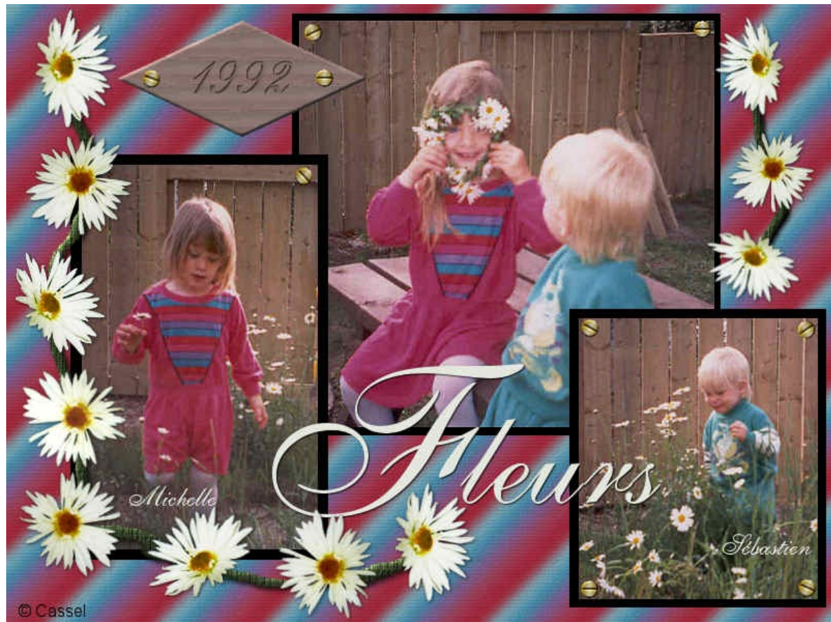
Layout by Carole