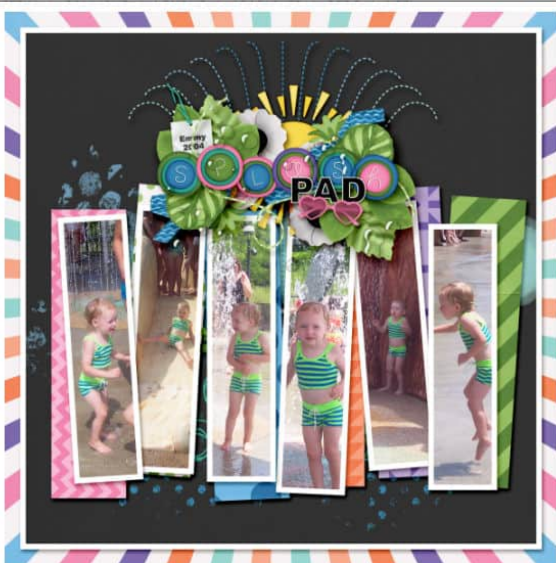
Layout by Yvonne Pucket, with a kit from Scraps'n Pieces

Since it is so easy to get a raffle of photos, you can also display several photos that are quite similar, without being totally identical.