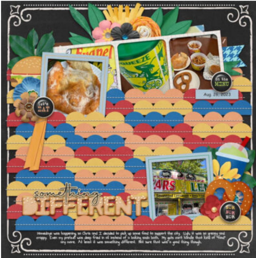
Layout by Lynn