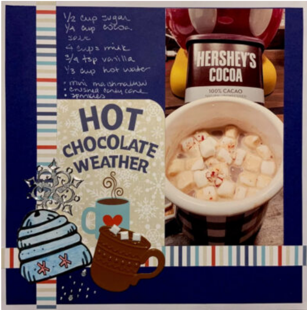
Layout by Lis