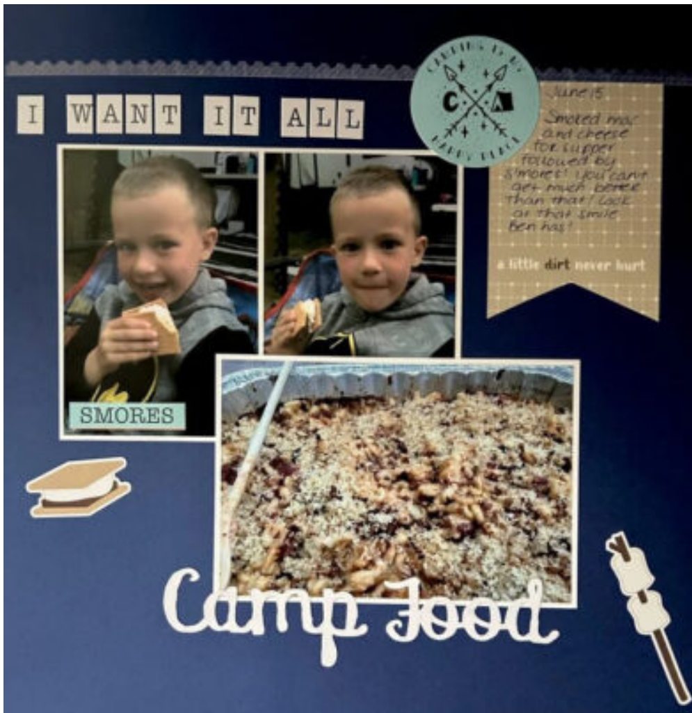
Layout by Amanda