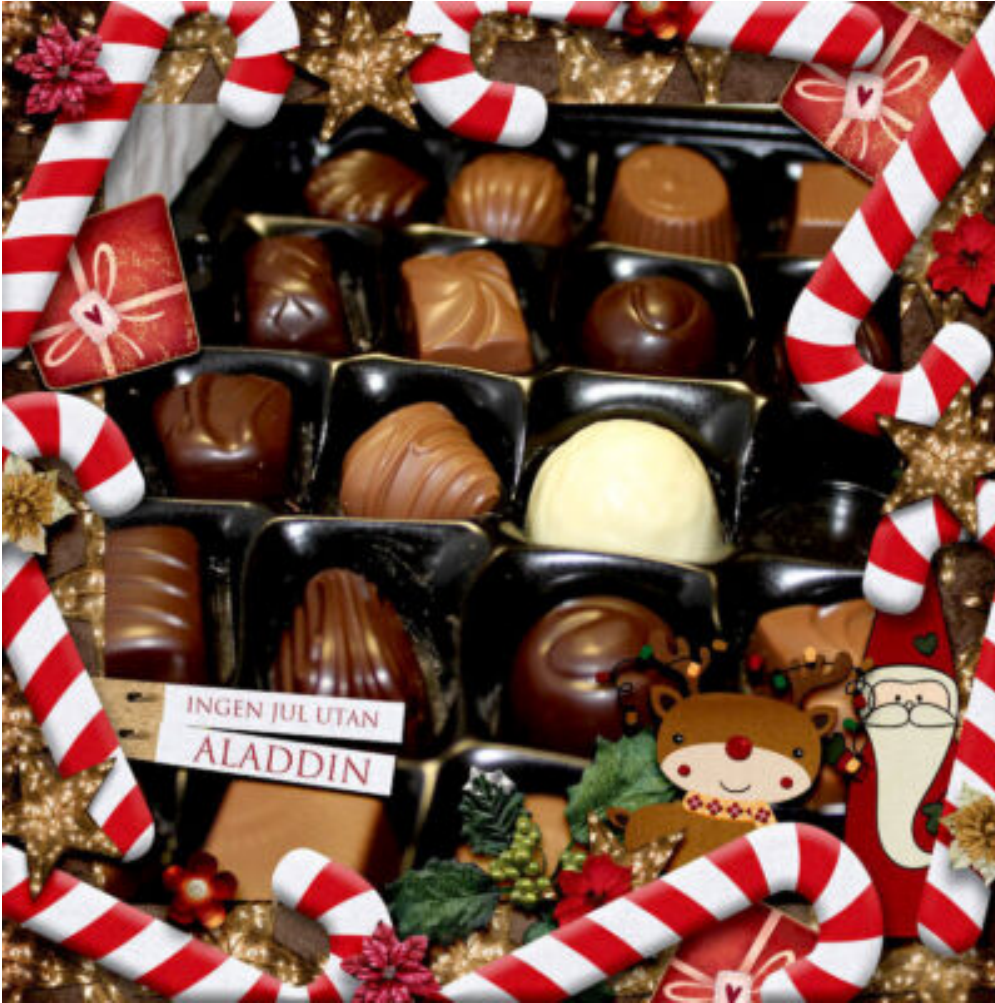
Layout by Eva