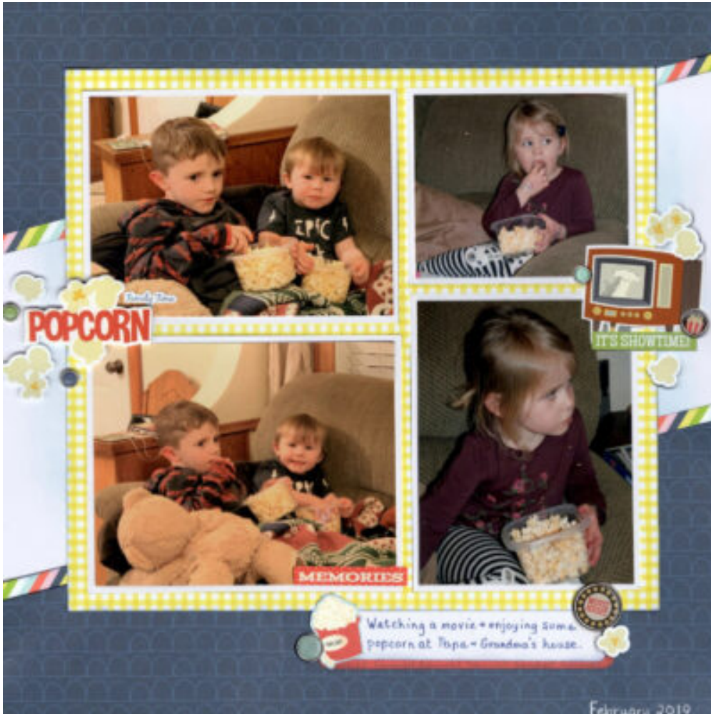
Layout by Judy