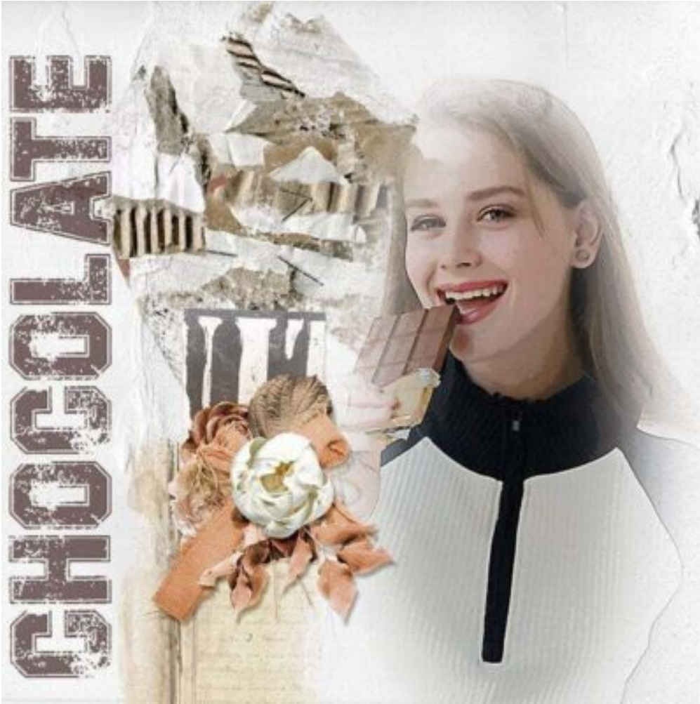
Layout by Gina