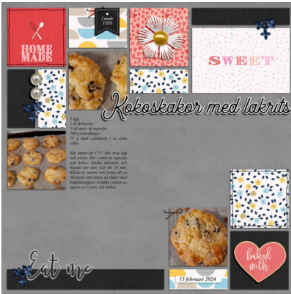
Layout by Eva