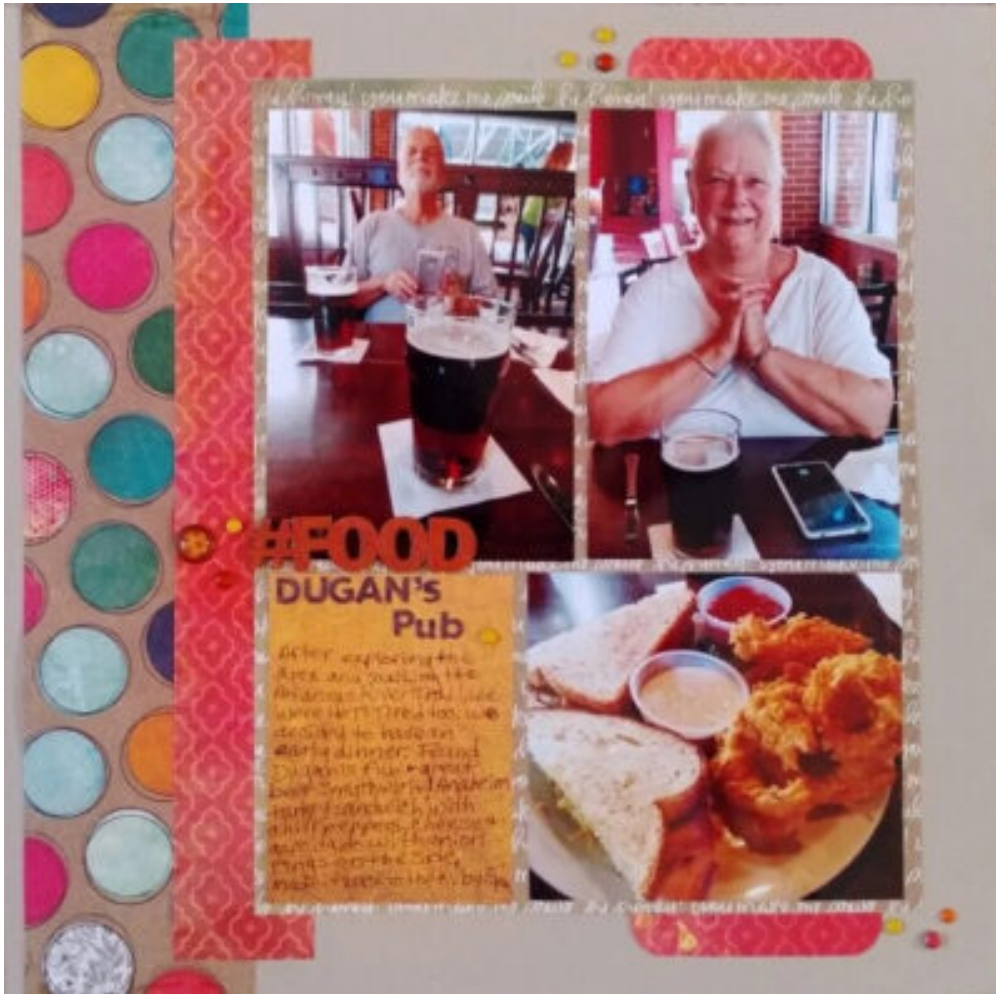
Layout by Susan