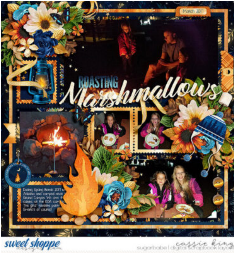
Layout by Cassie