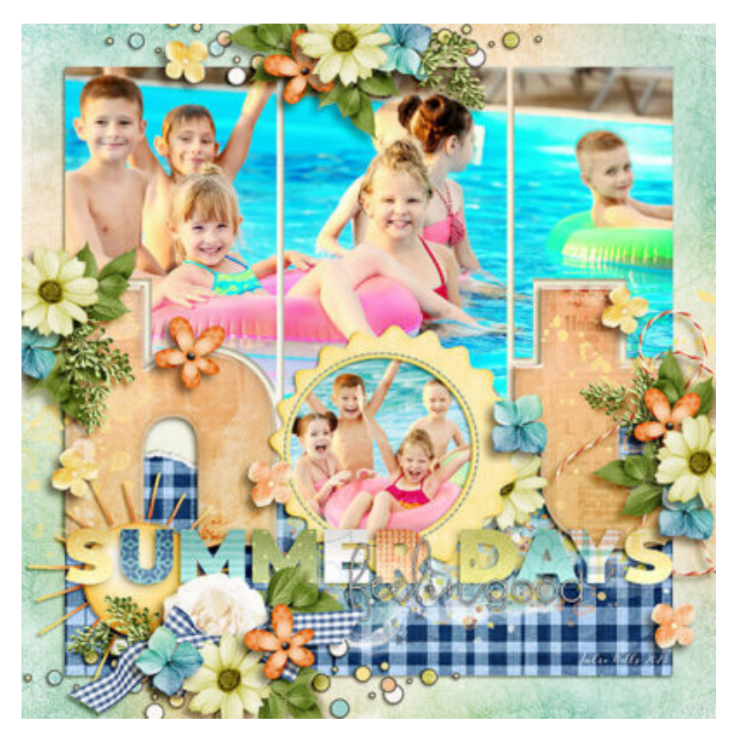
Layout by Julie