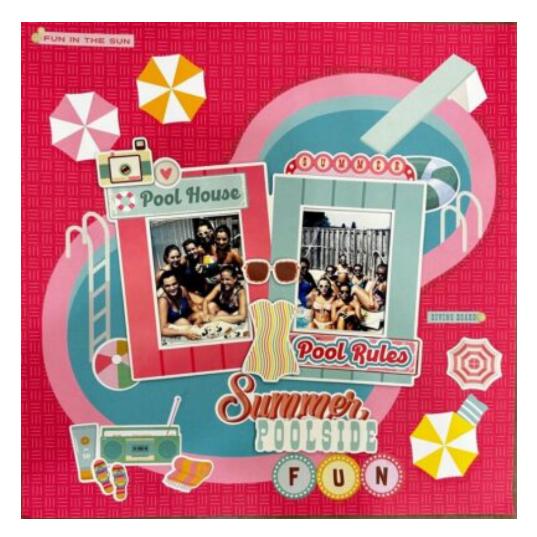
Layout by Ashley