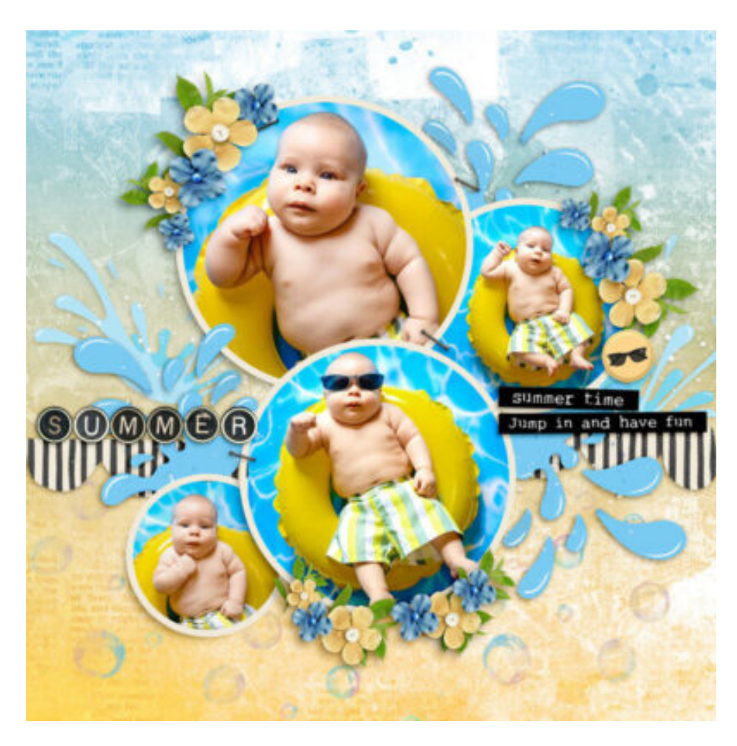
Layout by Glori2