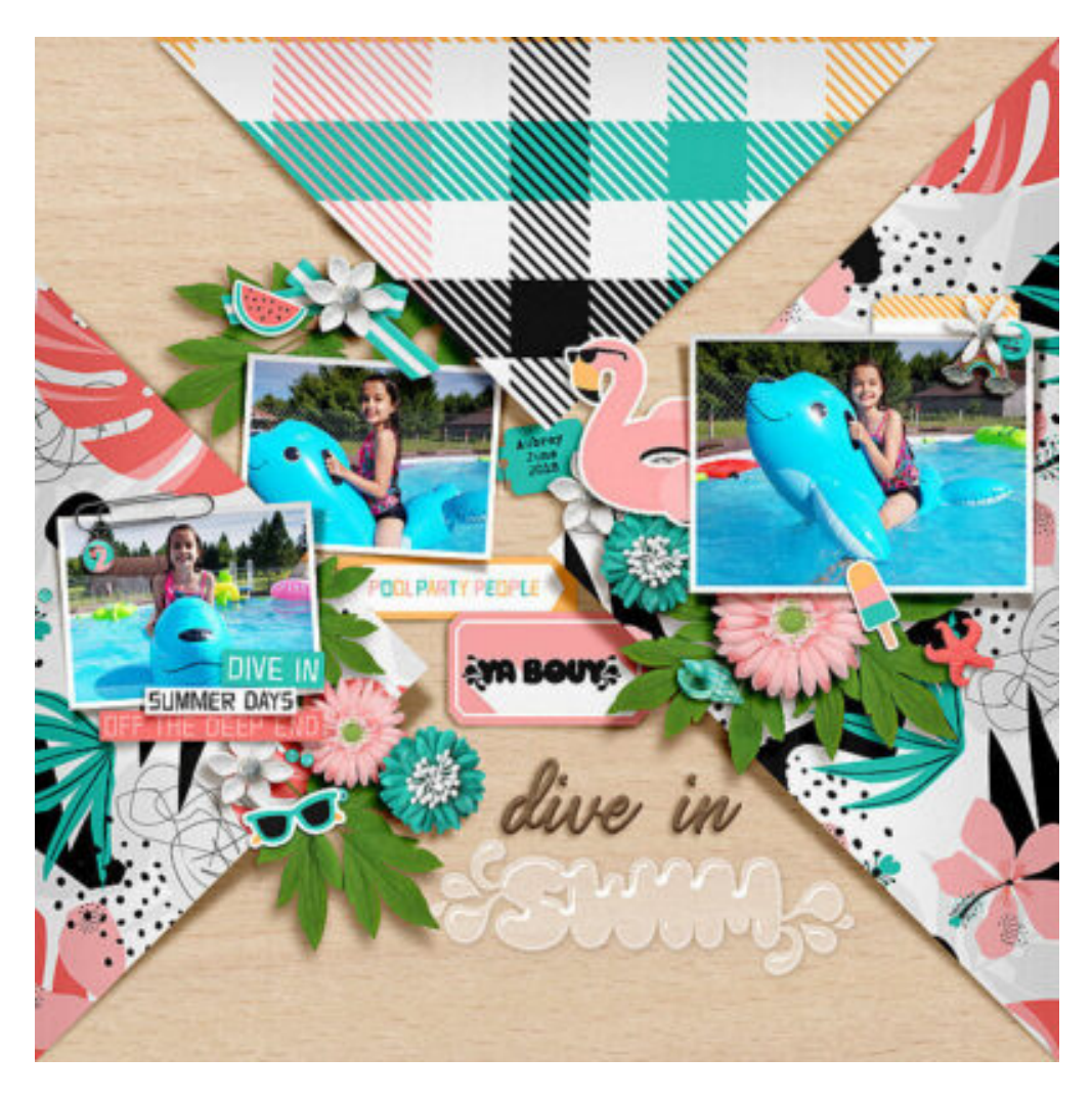
Layout by Cassie