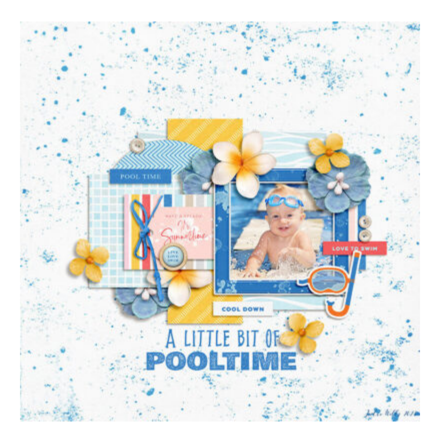
Layout by Julie