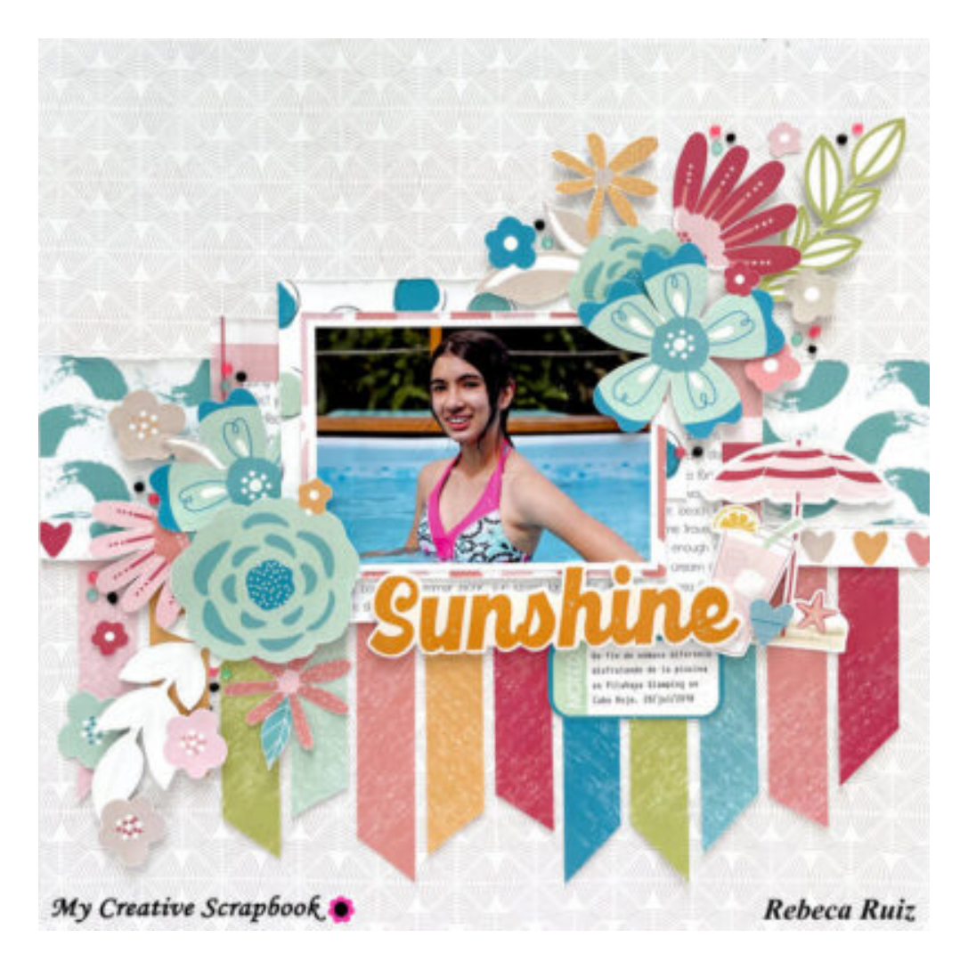
Layout by Rebecca