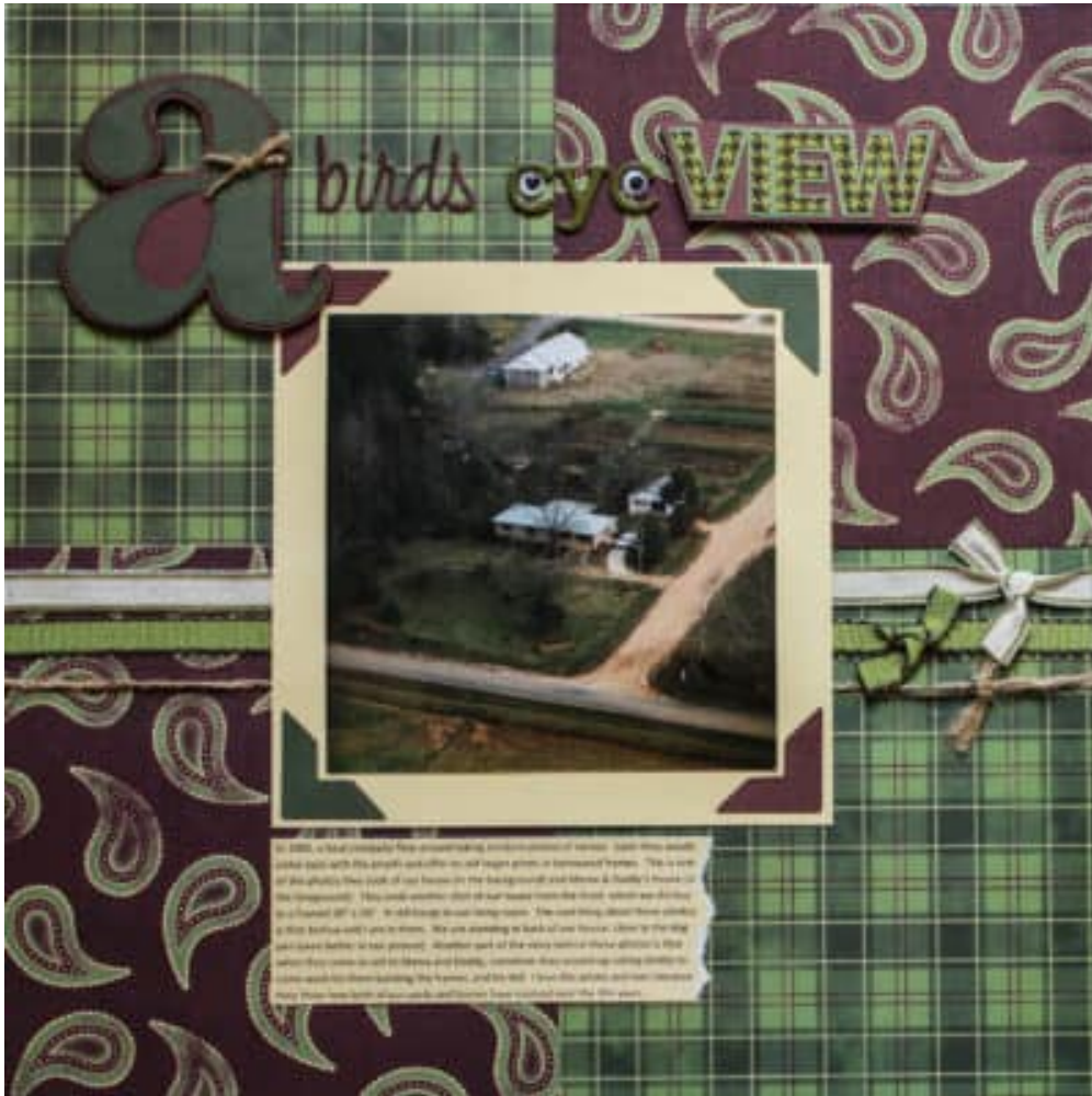
Page by Betty