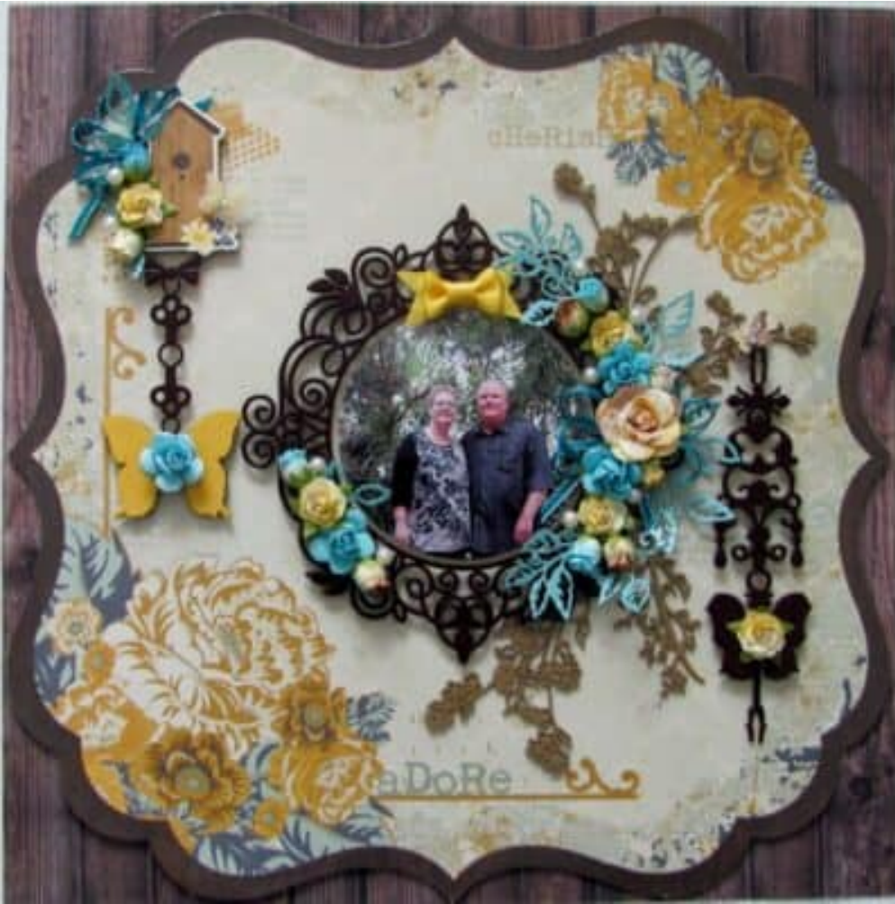
Page by Kelly