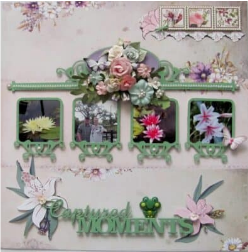
Layout by Kelly