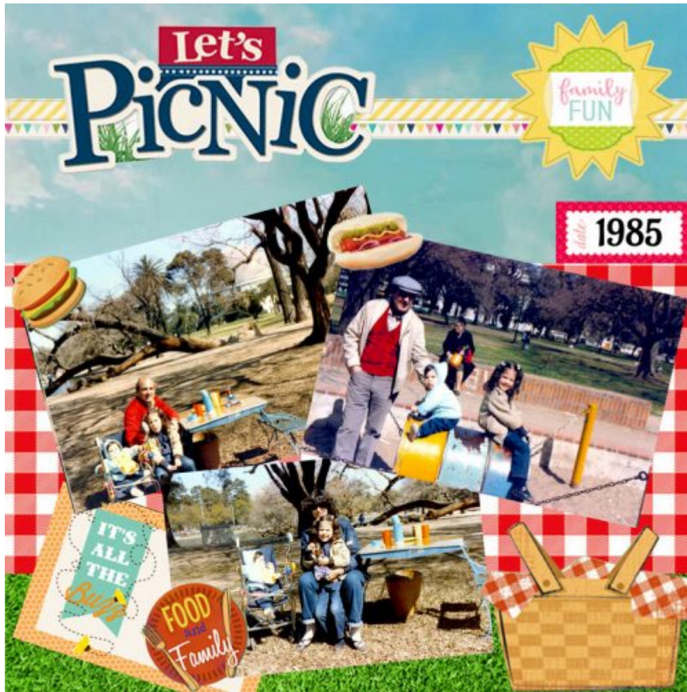
Layout by Anna