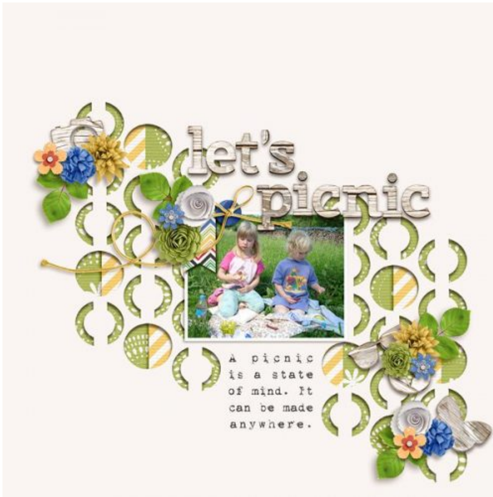
Layout by Ellen