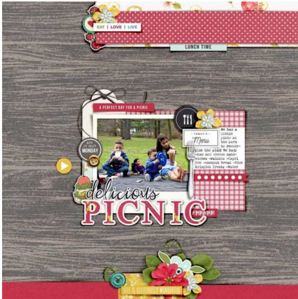
Layout by Maribel