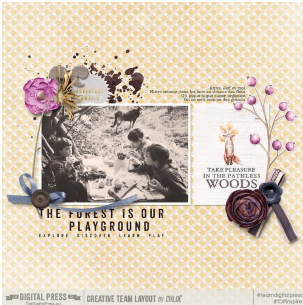
Layout by Chloé