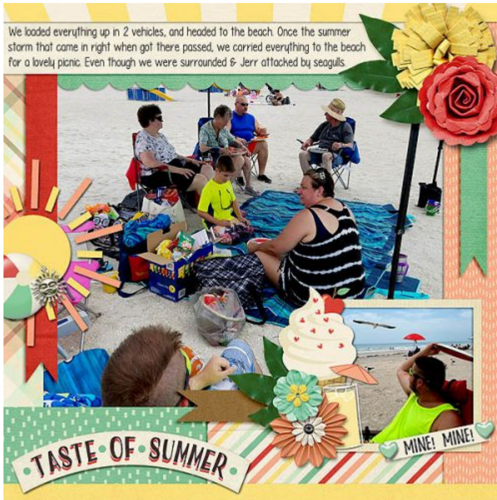
Layout by Shawnbear