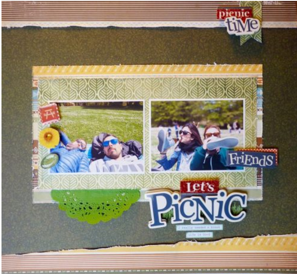
Layout by Giorgia