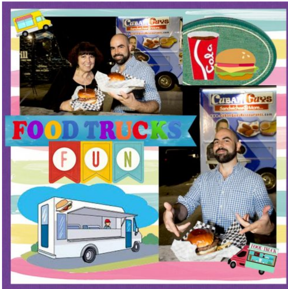
Layout by Ana