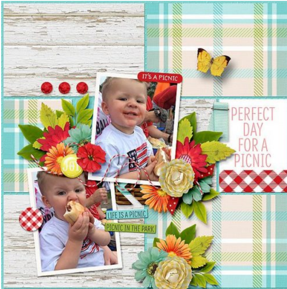
Layout by Rae