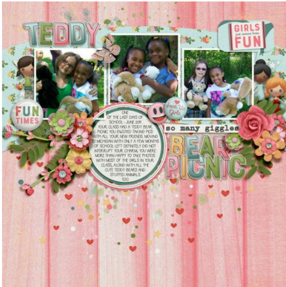
Layout by Kiana