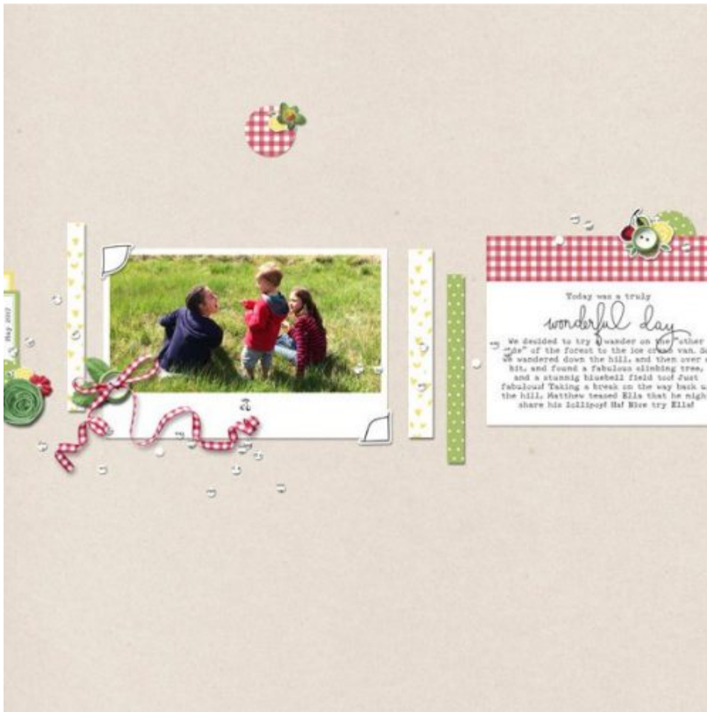
Layout by Corrin