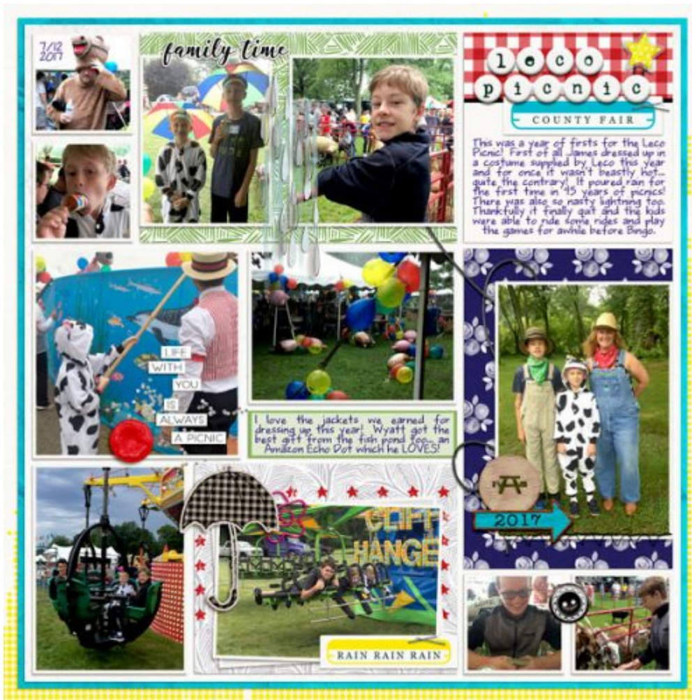
Layout by Karen