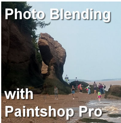
Photo Blending with PaintShop Pro