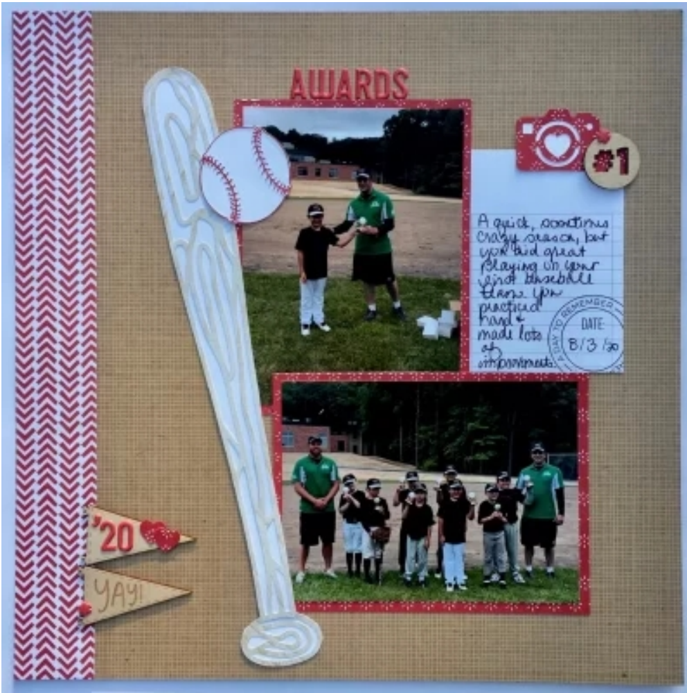
Layout by KeddyO