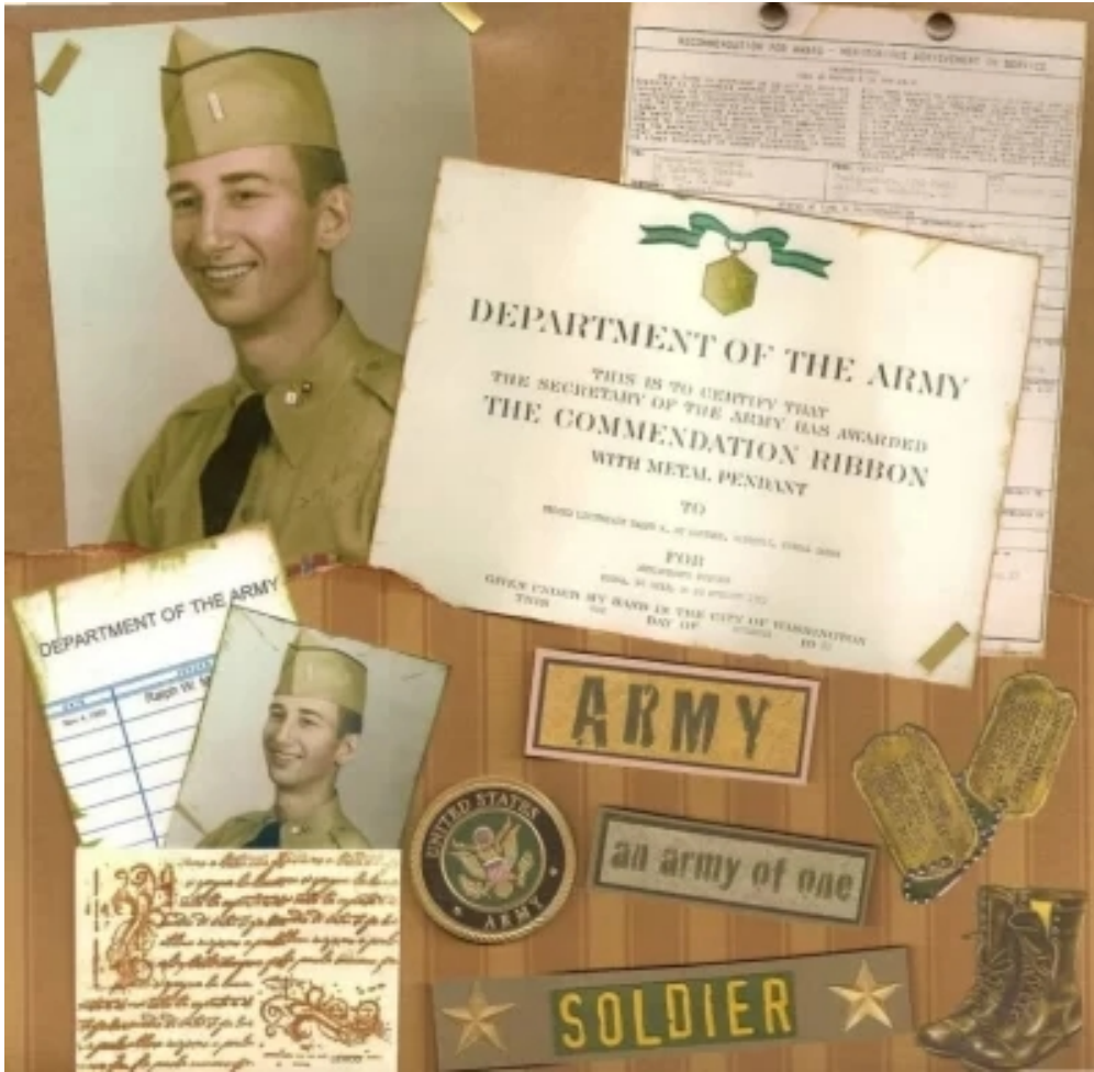
Layout by Mendy