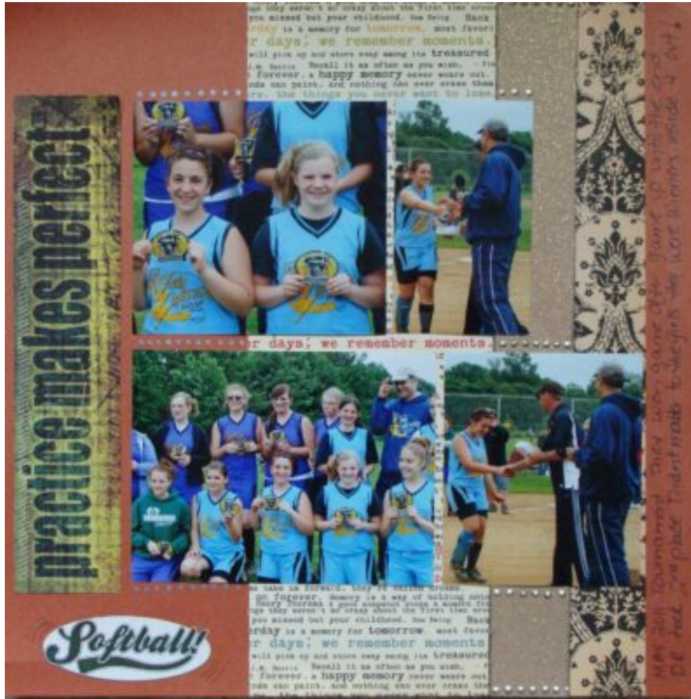
Layout by Coleen