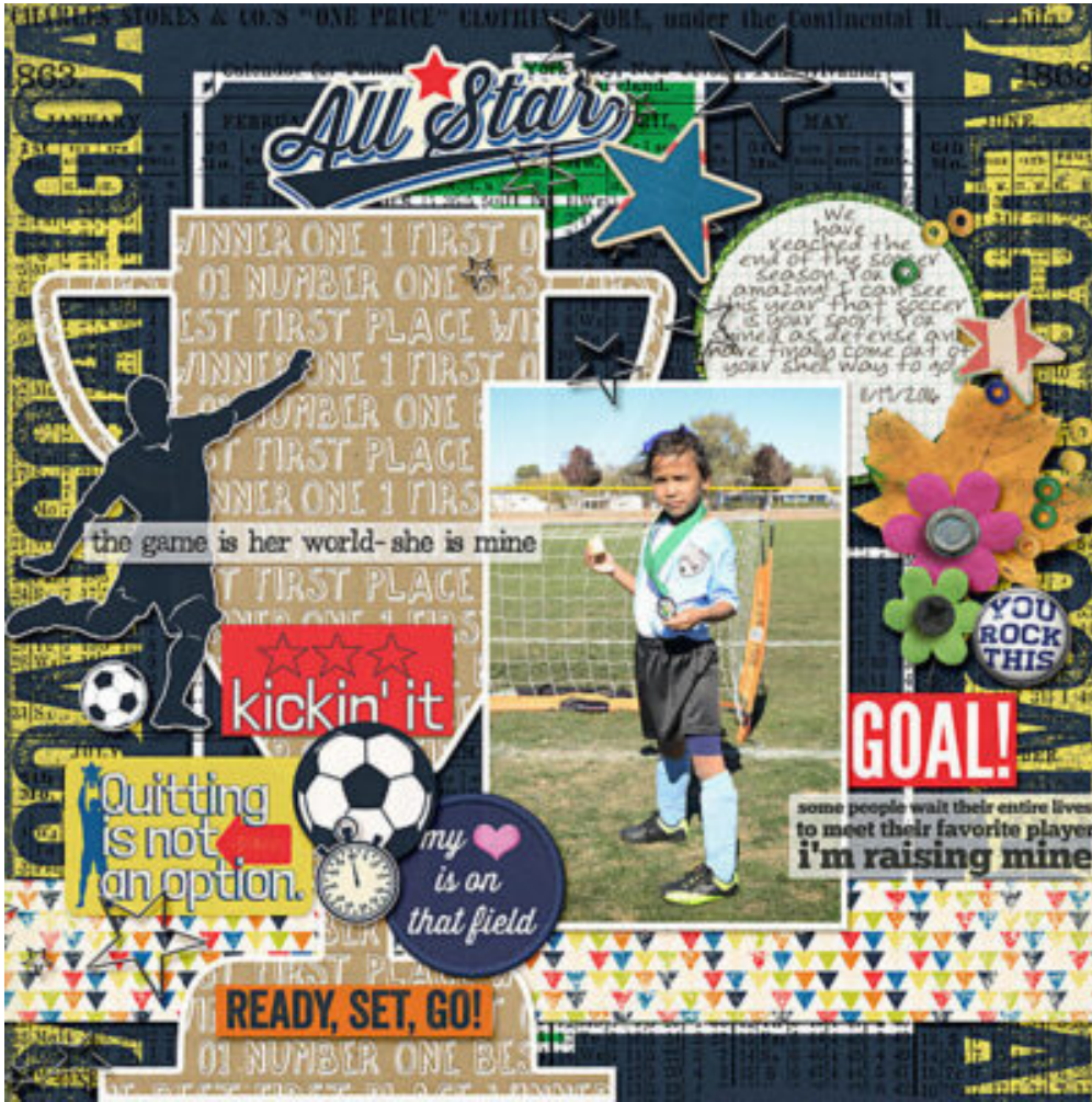
Layout by Ophelia