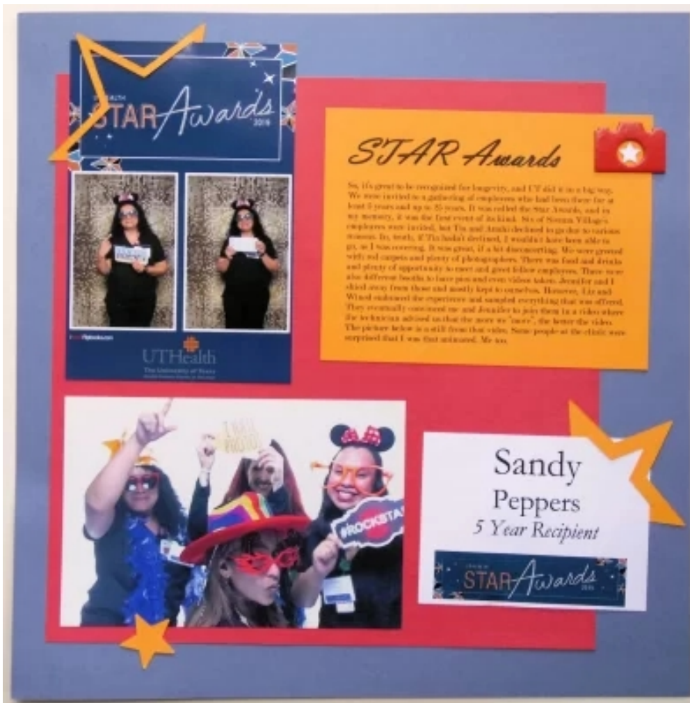
Layout by Speppers1