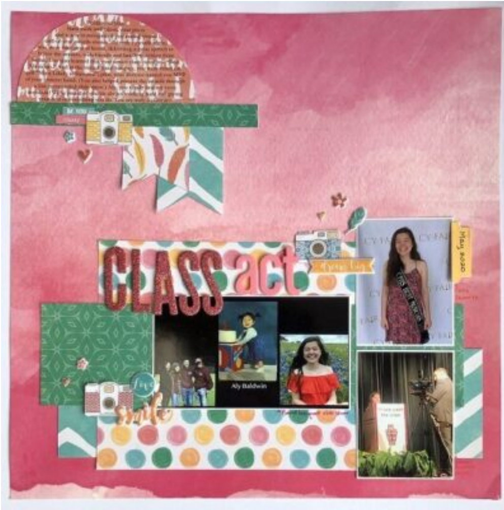
Page by Cynthia