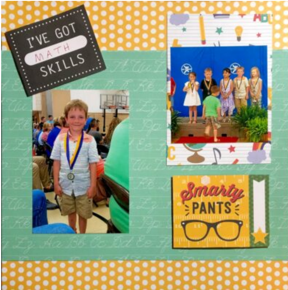
Layout by Cdjohnson