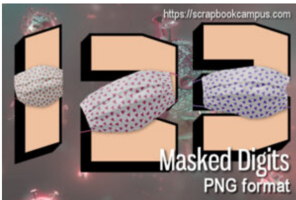
Layout by Linda

Since masks have become the new daily accessory, why