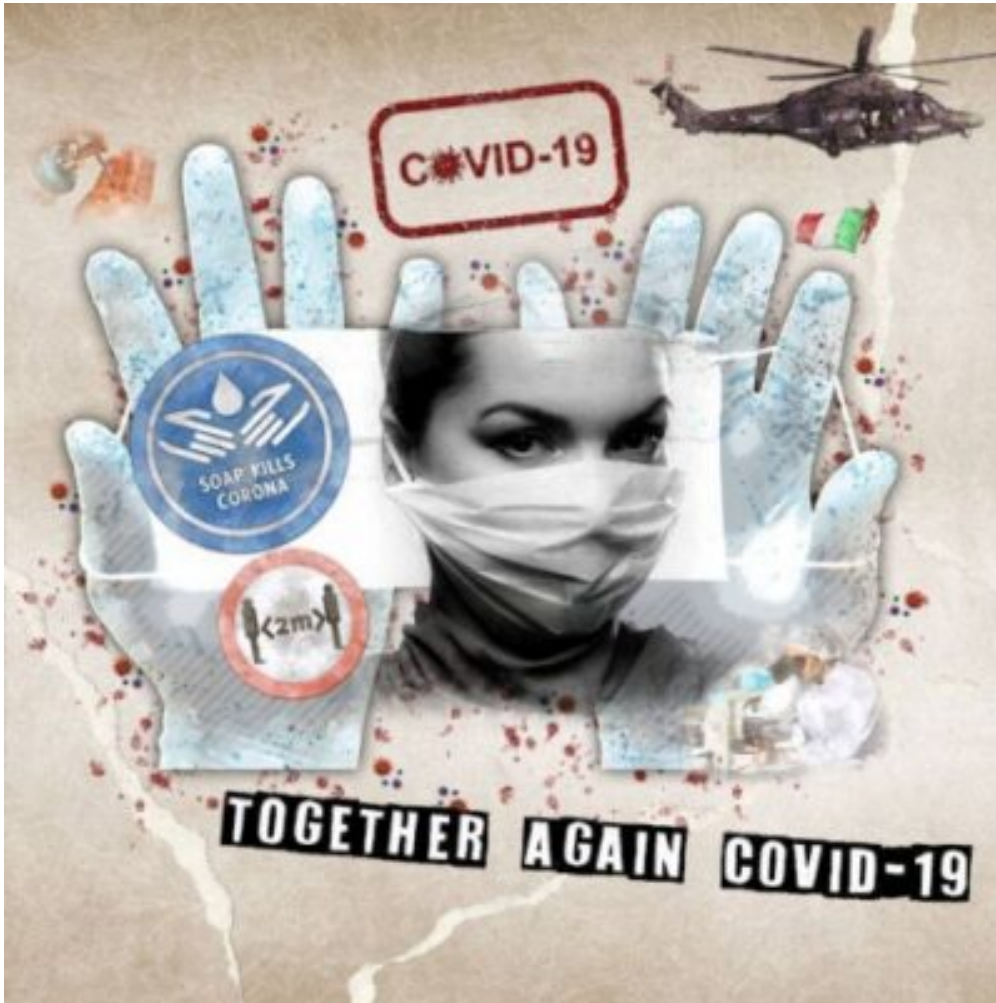
Page by Francine