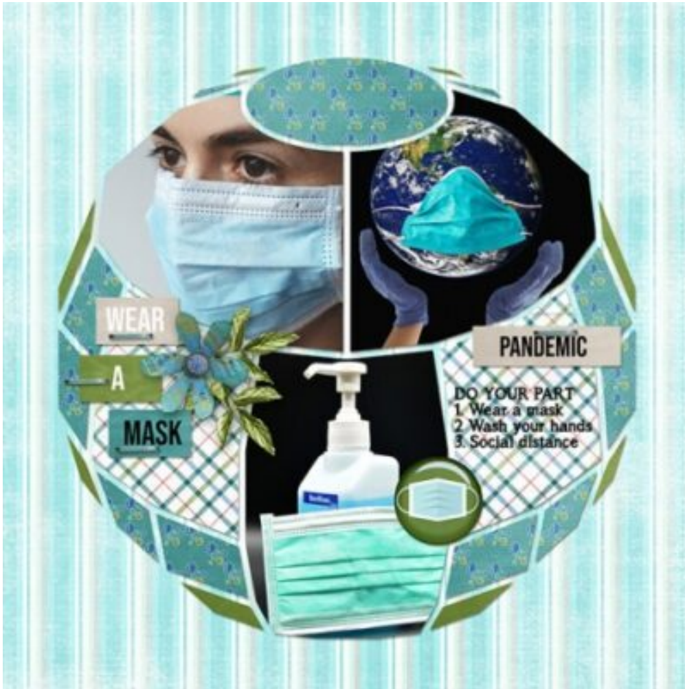
Layout by Joyce