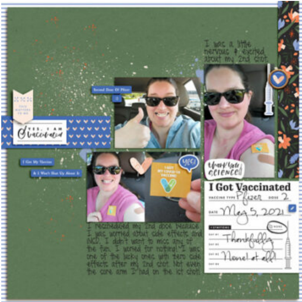
Layout by Courtney