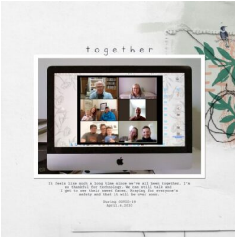
Layout by Karen