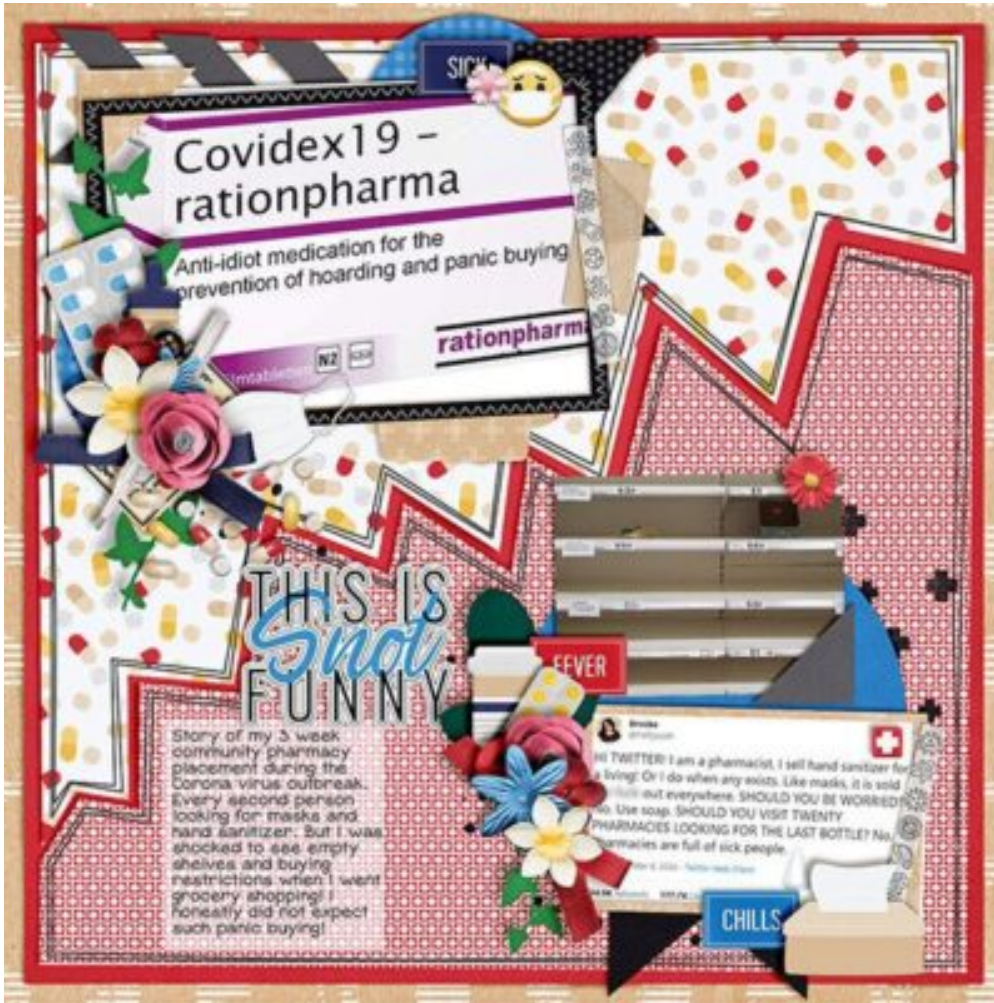
Page by Christelle