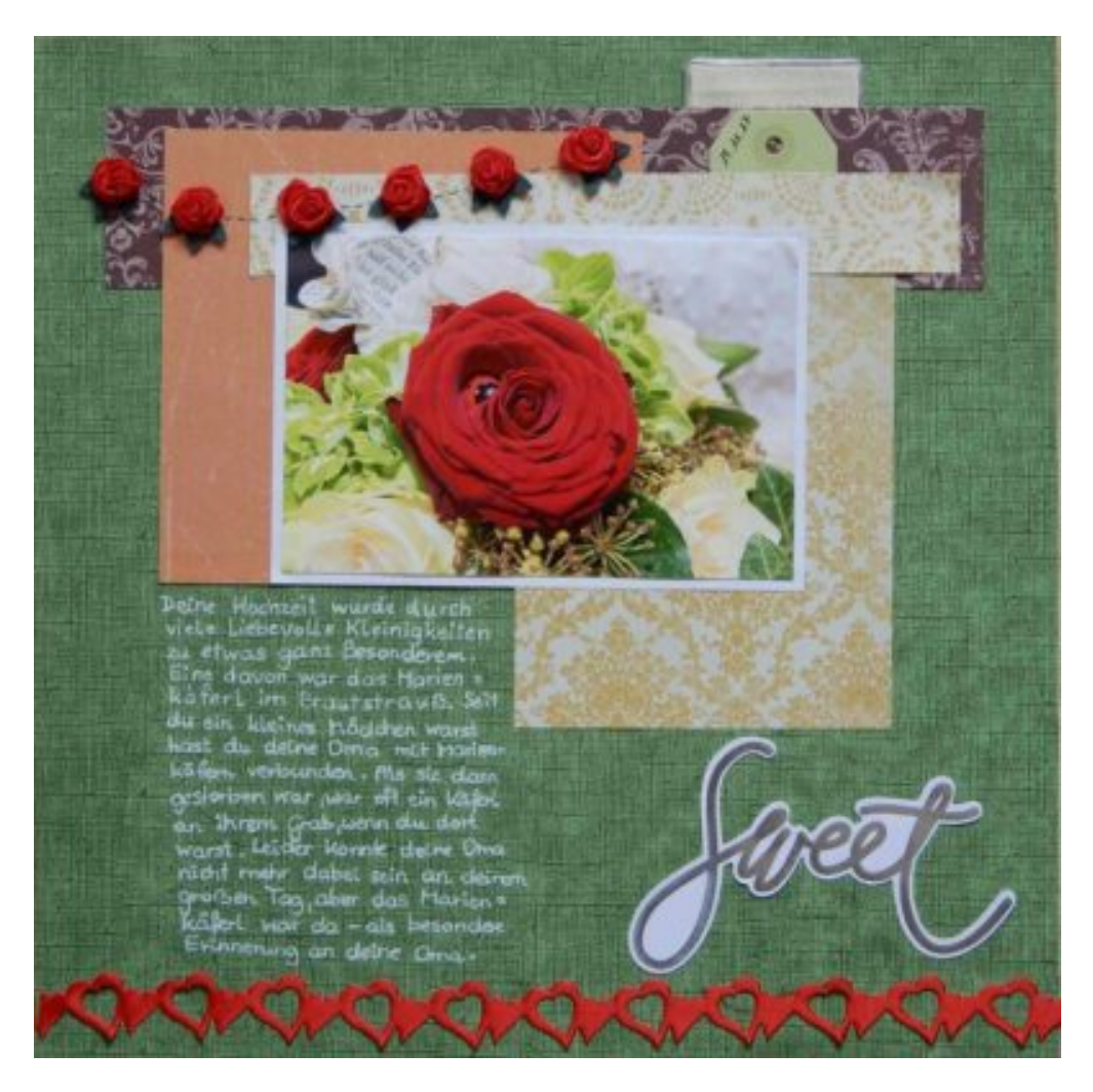
Page by <u>Susi</u>