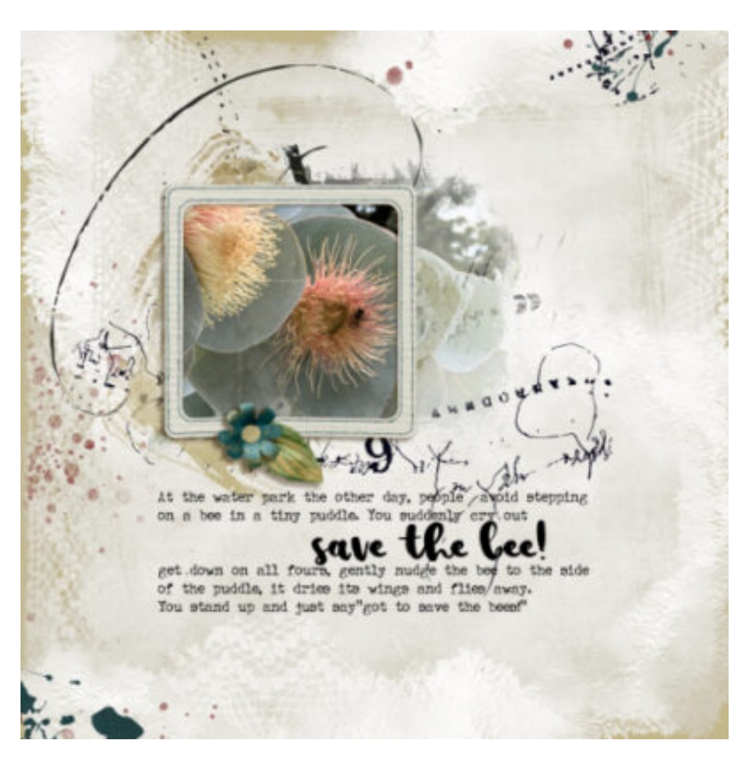
Layout by Lou