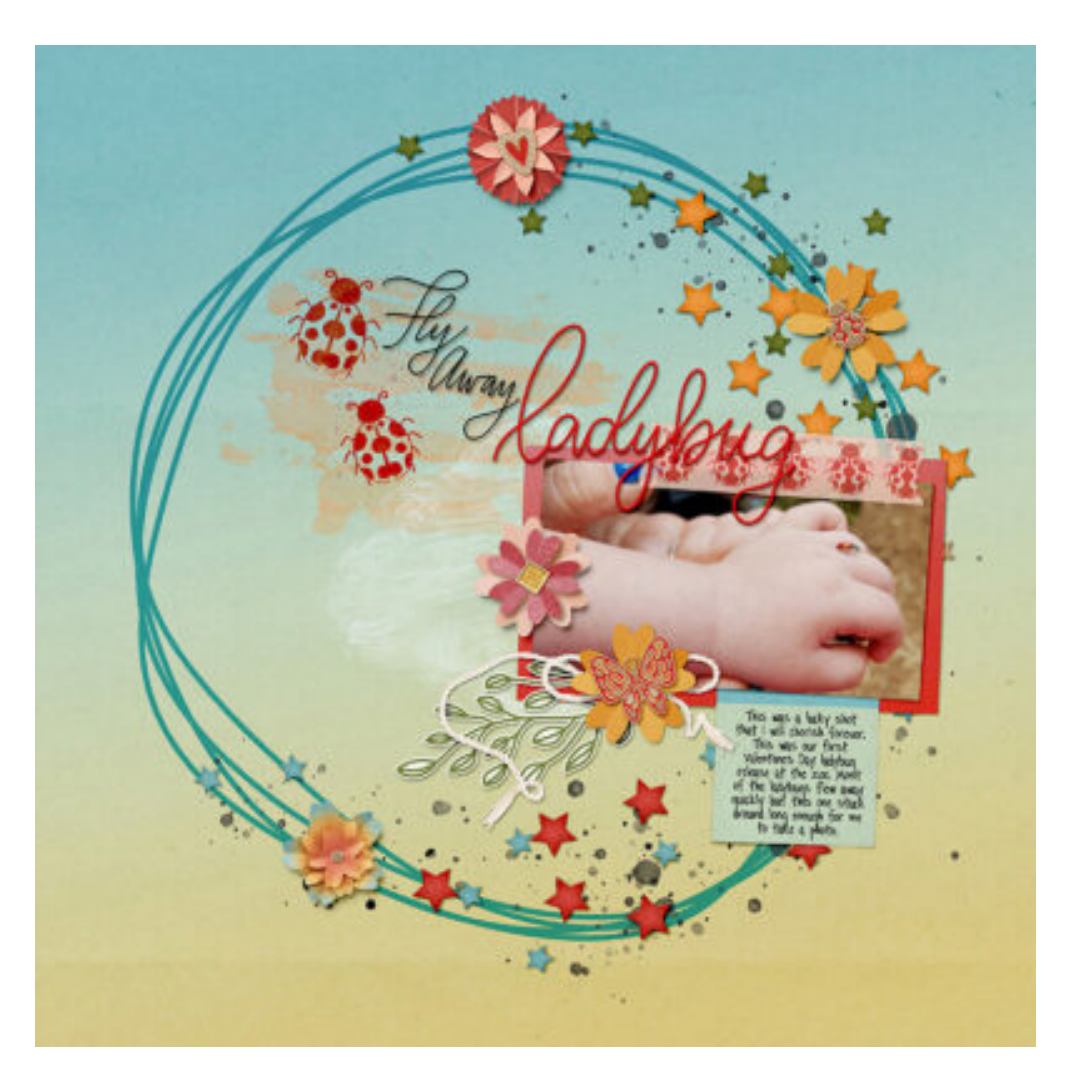
Layout by Brendazzle