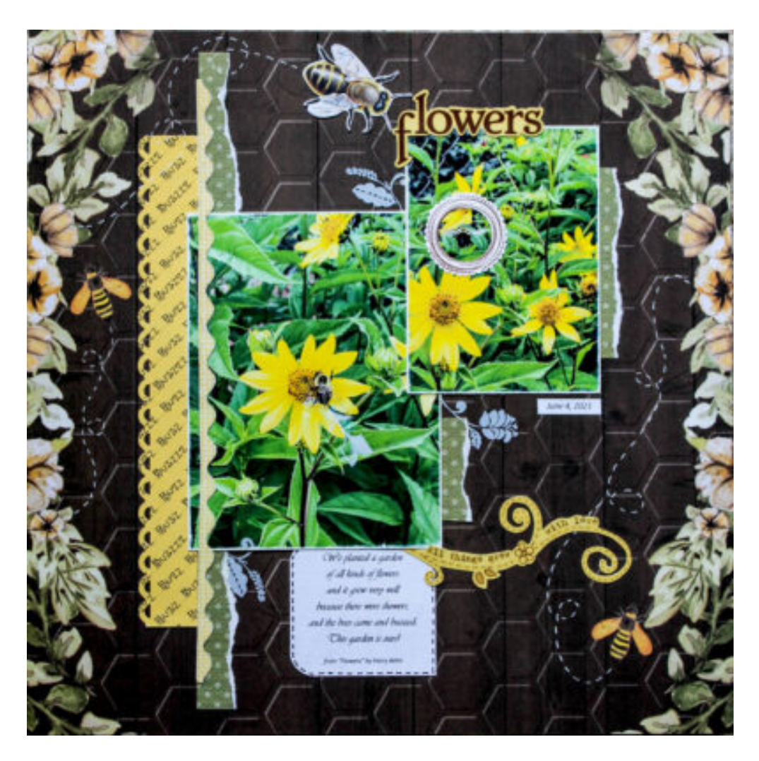
Page by Betty