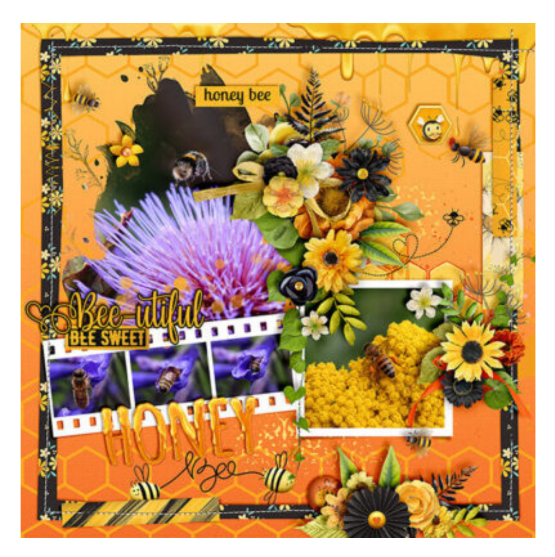
Layout by Christelle