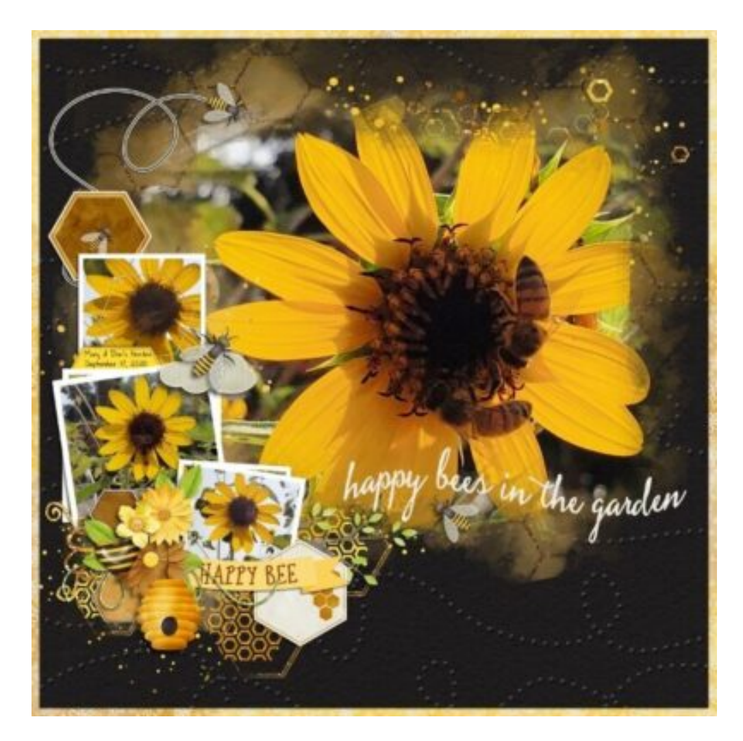
Layout by Meagan43