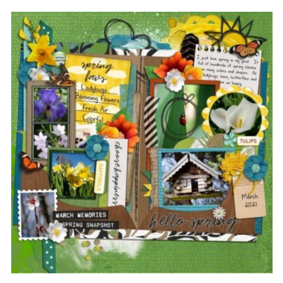
Layout by Meagan43