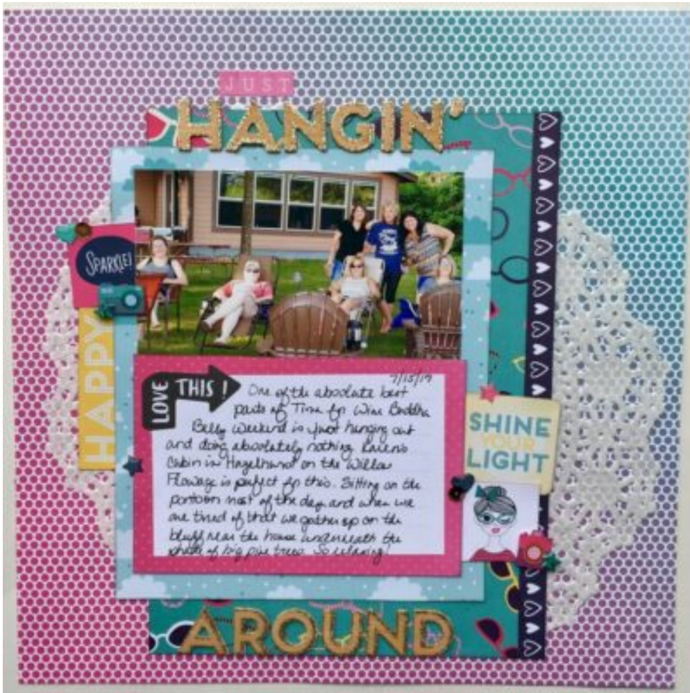
Layout by KeddyO