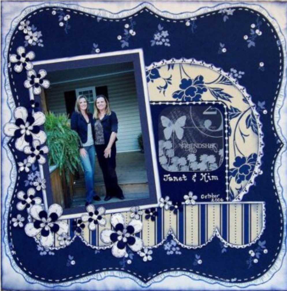
Layout by Betty