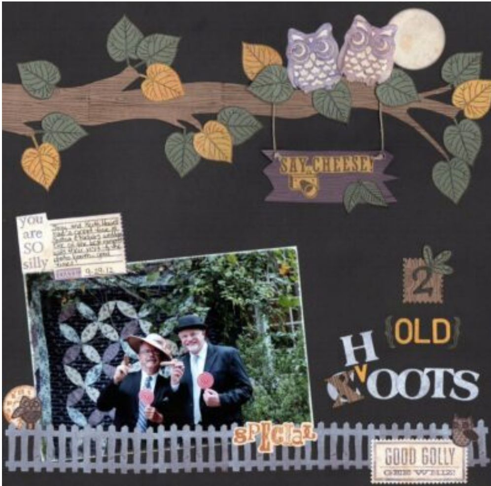
Layout by Betty