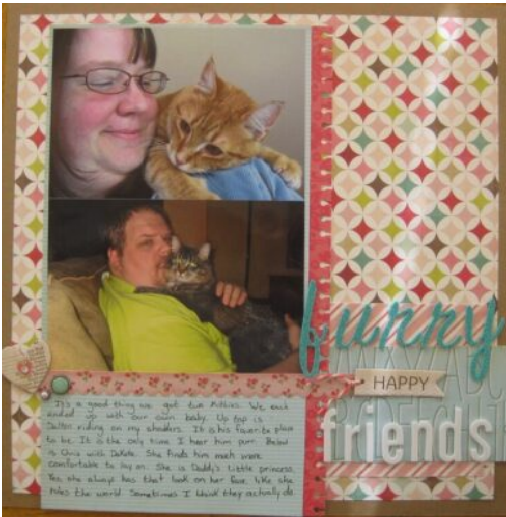
Layout by Darkchami