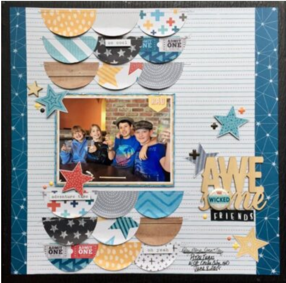
Layout by Tina