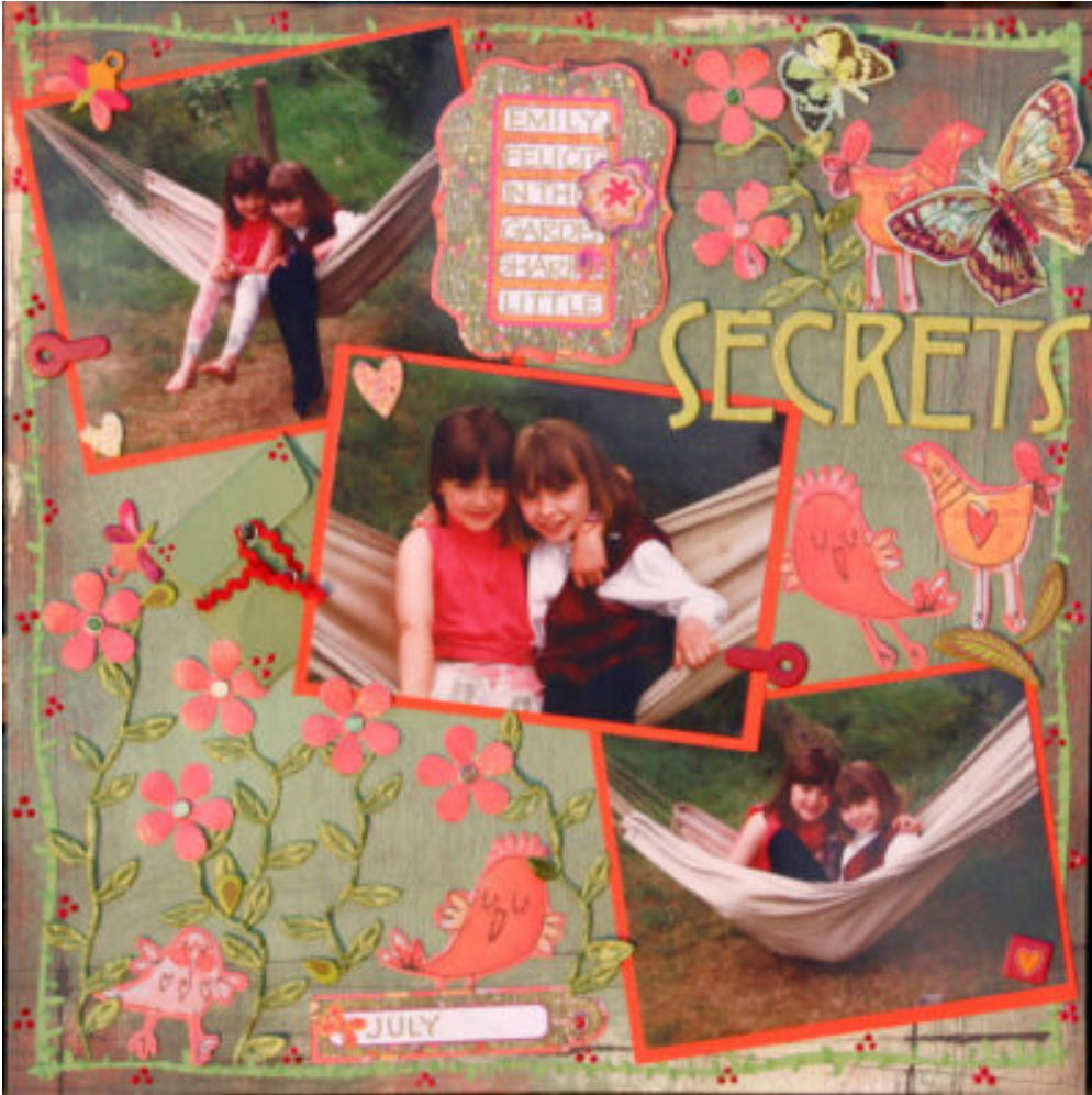
Layout by RachelUK