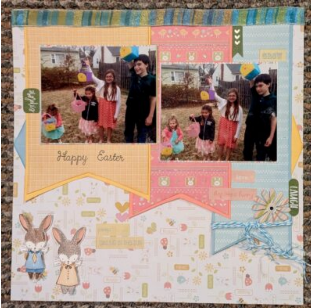
Layout by Jennifer