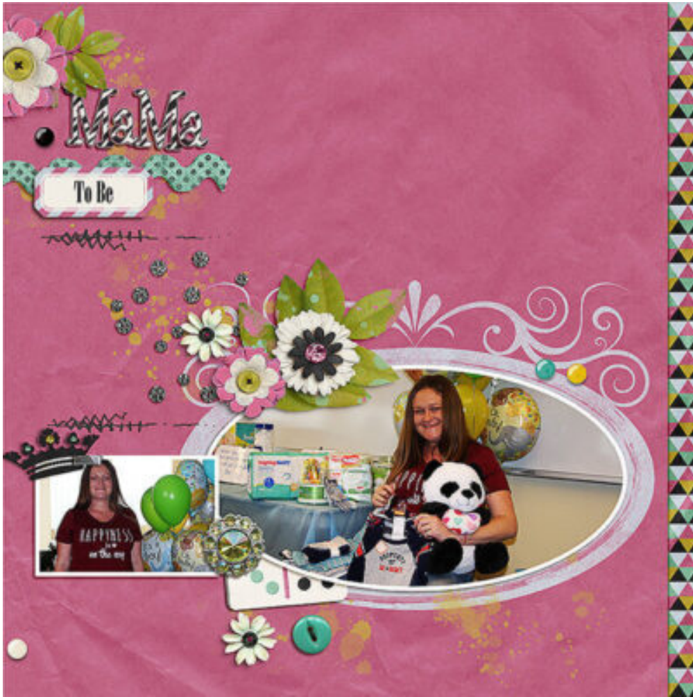
Layout by Carrie1977