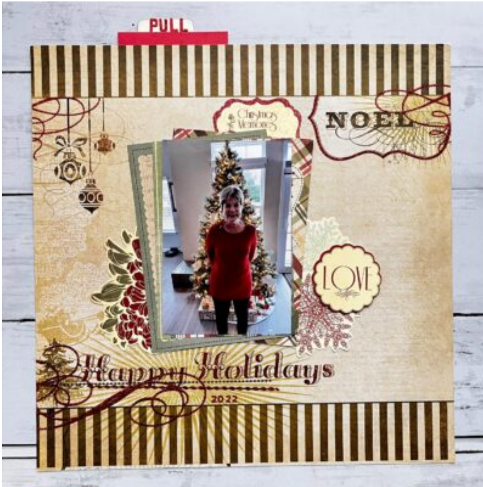
Layout by Kimberly