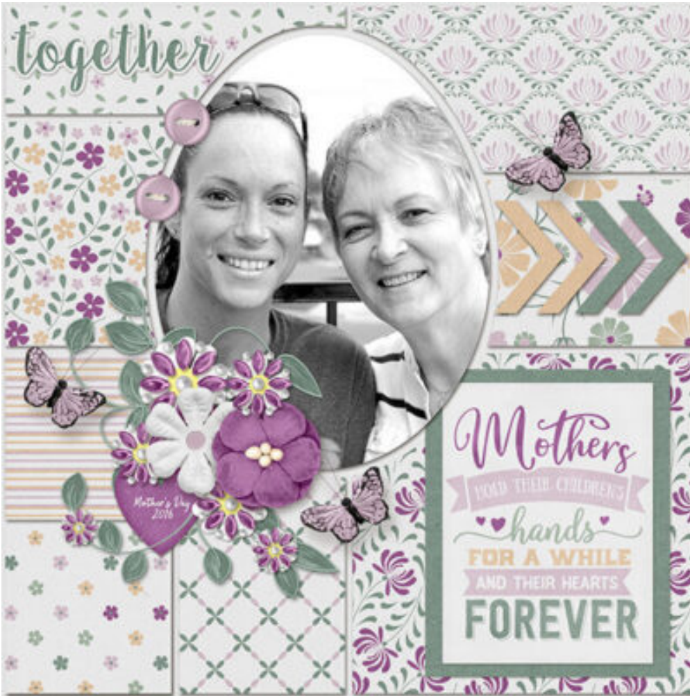
Layout by Jakrn