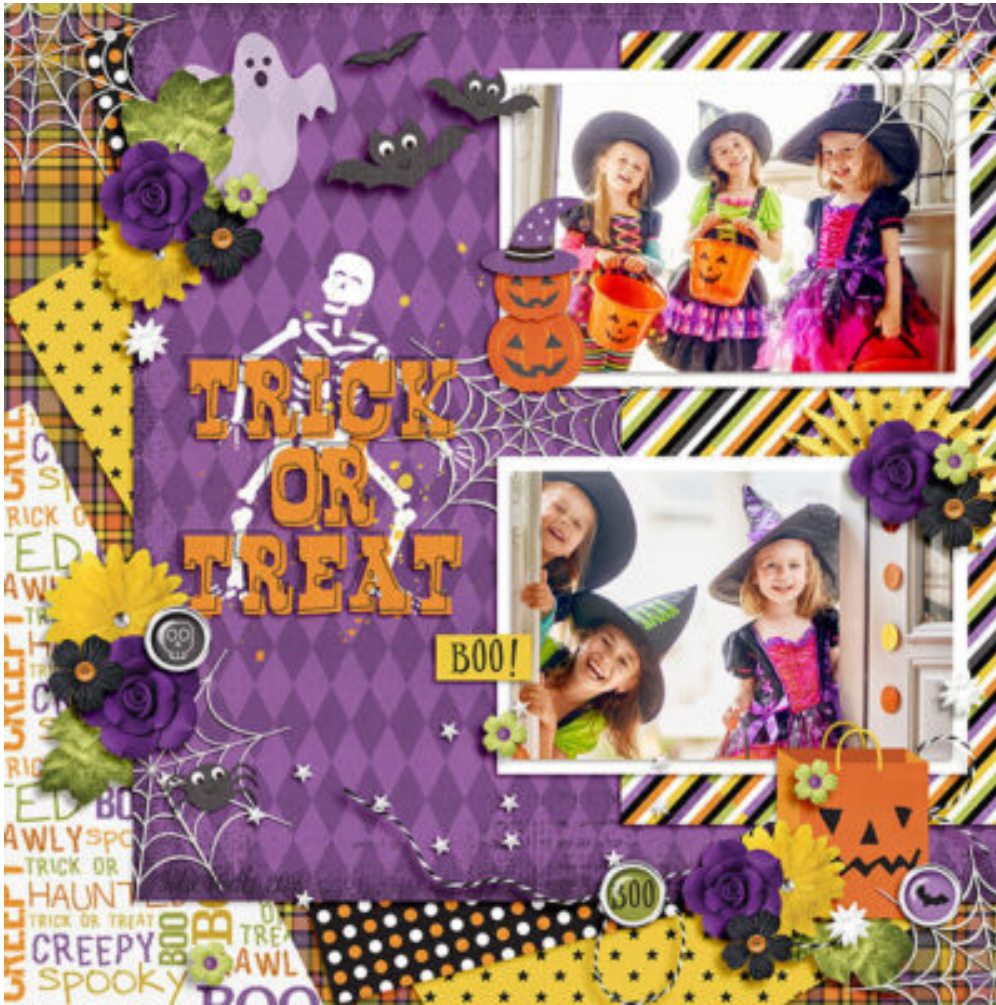
Layout by Julie