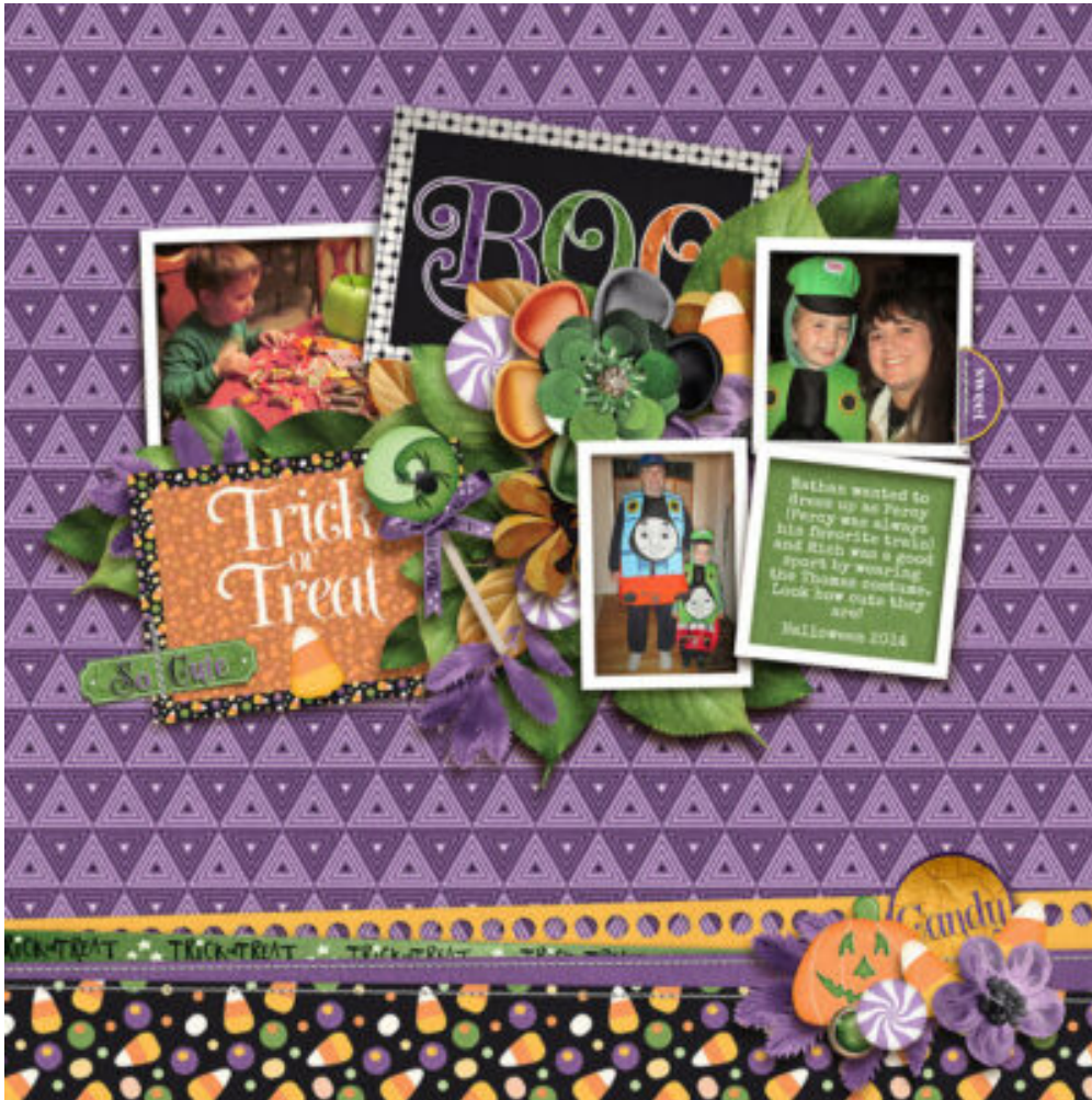
Layout by Charlene