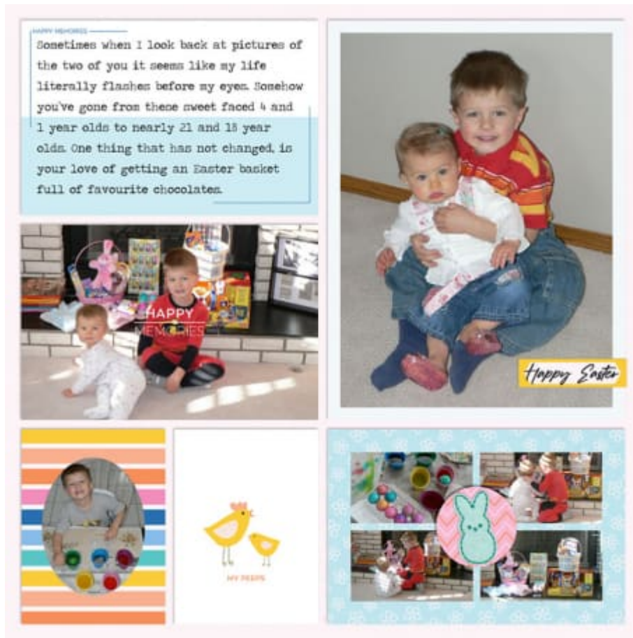
Layout by Candy Moe