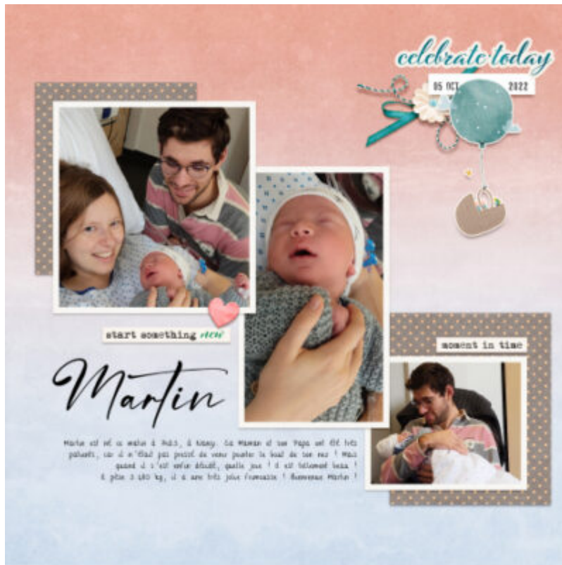
Layout by AMarie Charp