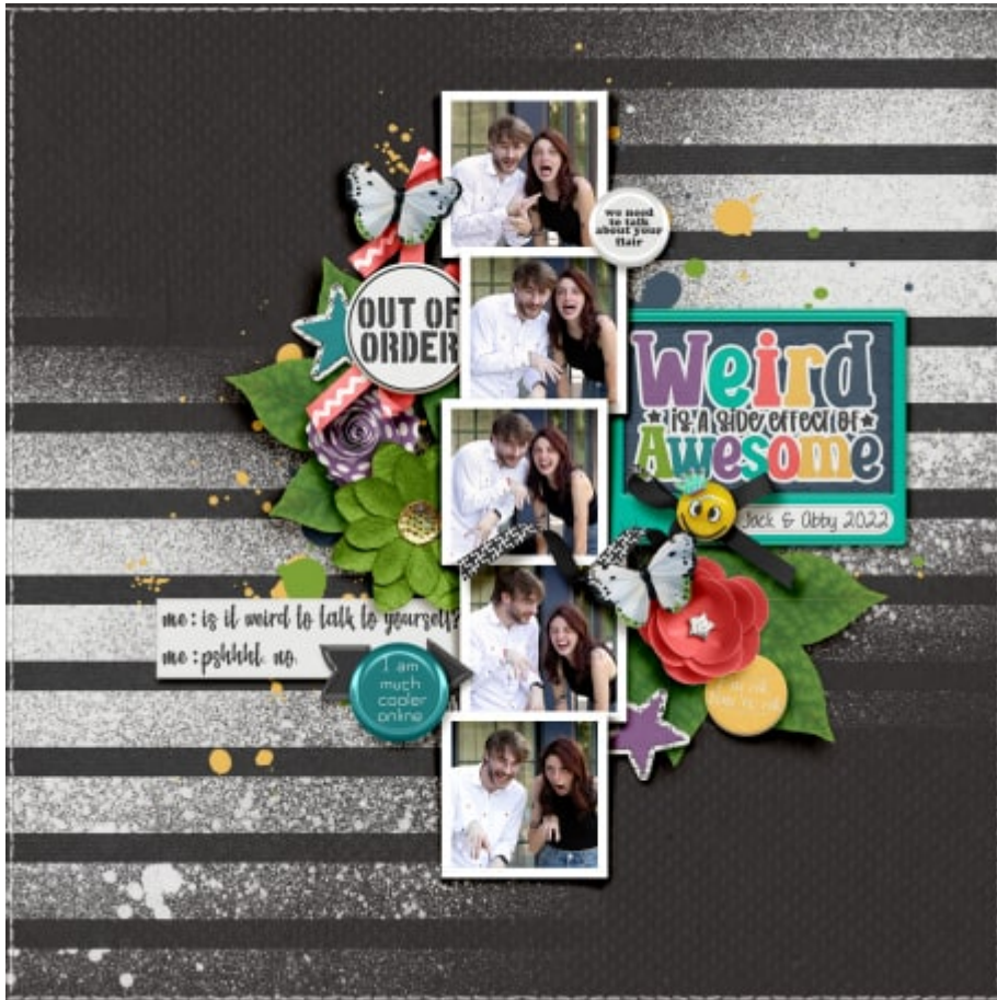
Layout by Yvonne Puckett

You can align the photos, the elements, or even the journaling. And how about a combination of all three?