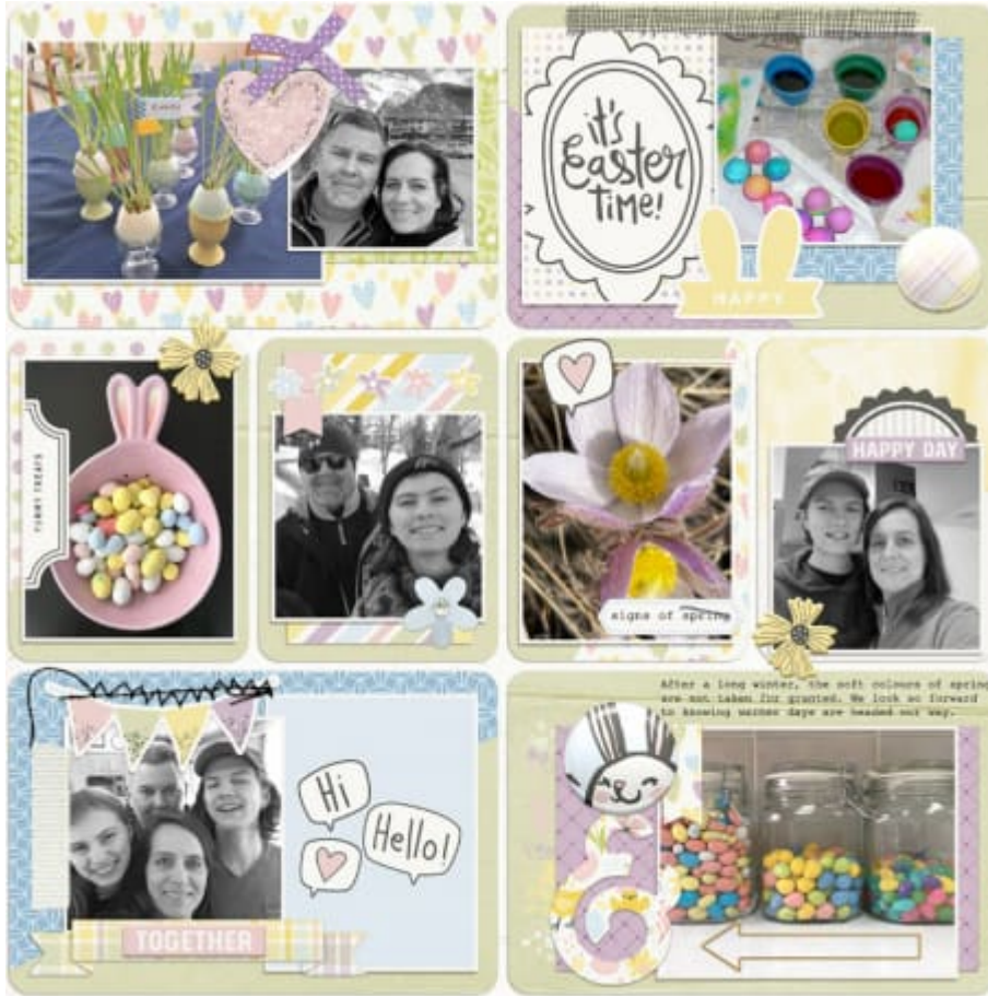
Layout by Candy Moe