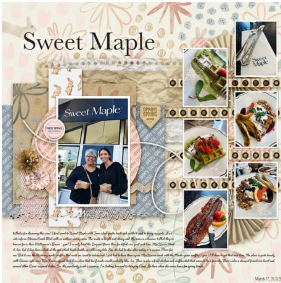
Layout by Linda