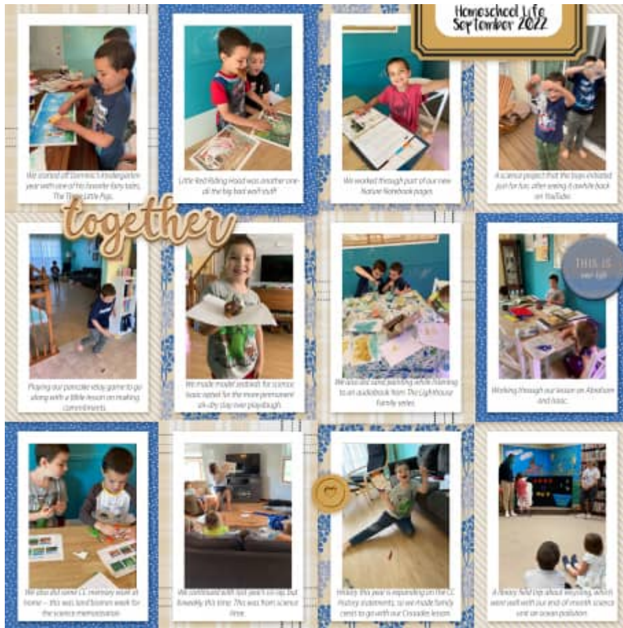
Layout from Becky Wooler

If you don't like a very structured grid, you can be a bit more flexible and use the grid as a starting point only. In this case, you can change the placement of some elements or photos, or use another arrangement within the basic grid. Pocket scrapbooking is one type of project that uses a modified grid alignment.