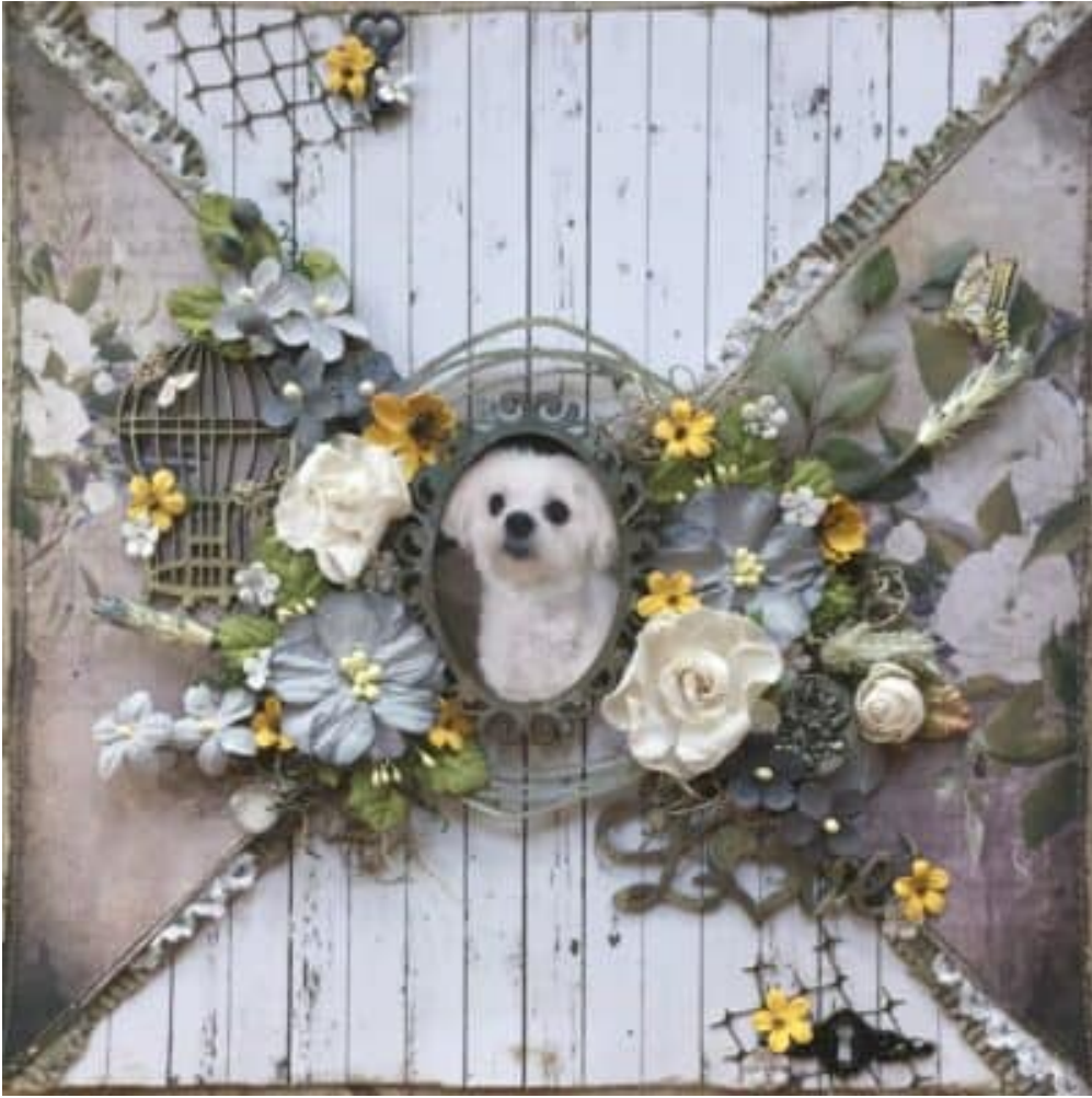
Layout by Cheryl