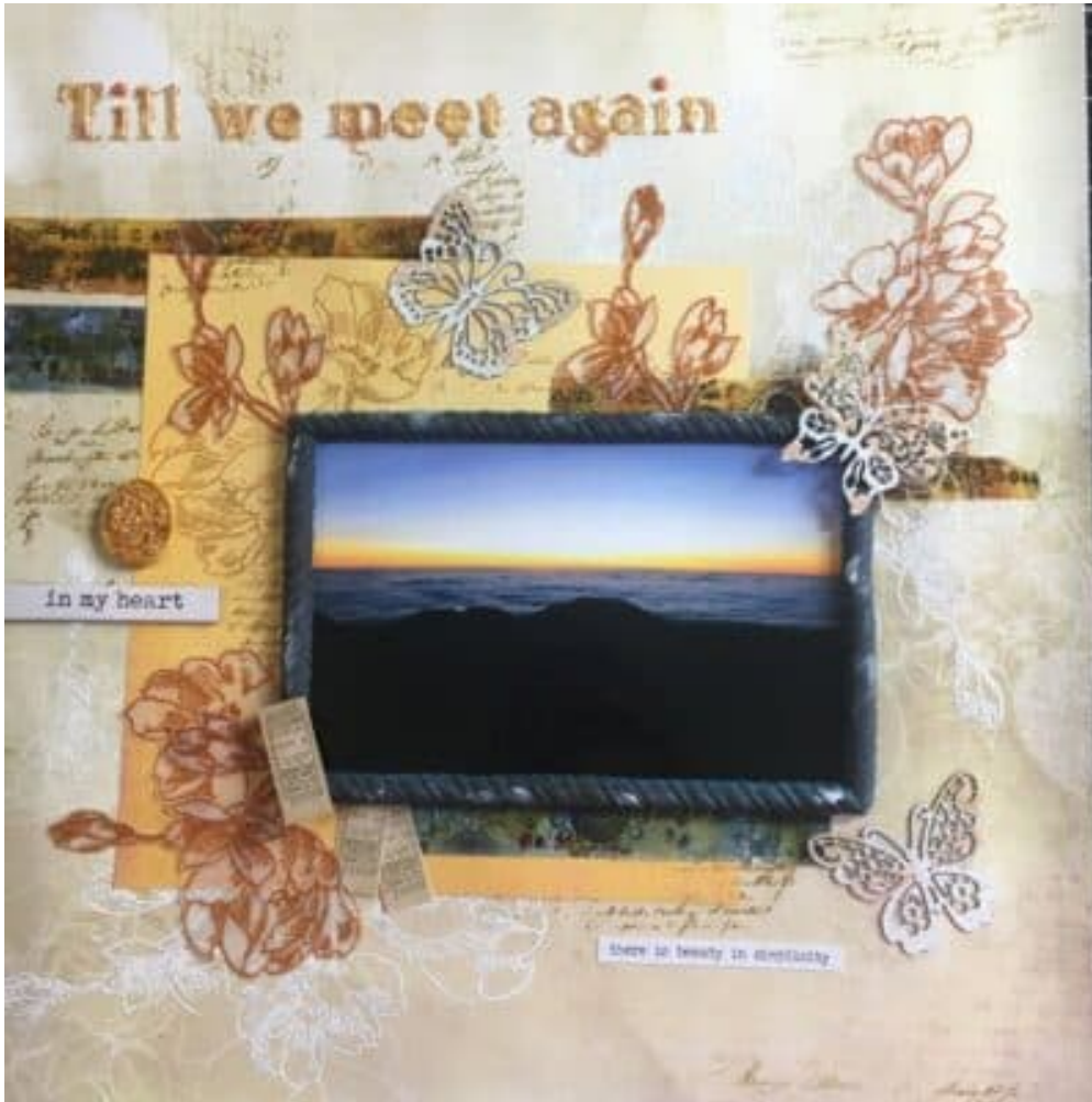
Layout by Cmkondrat