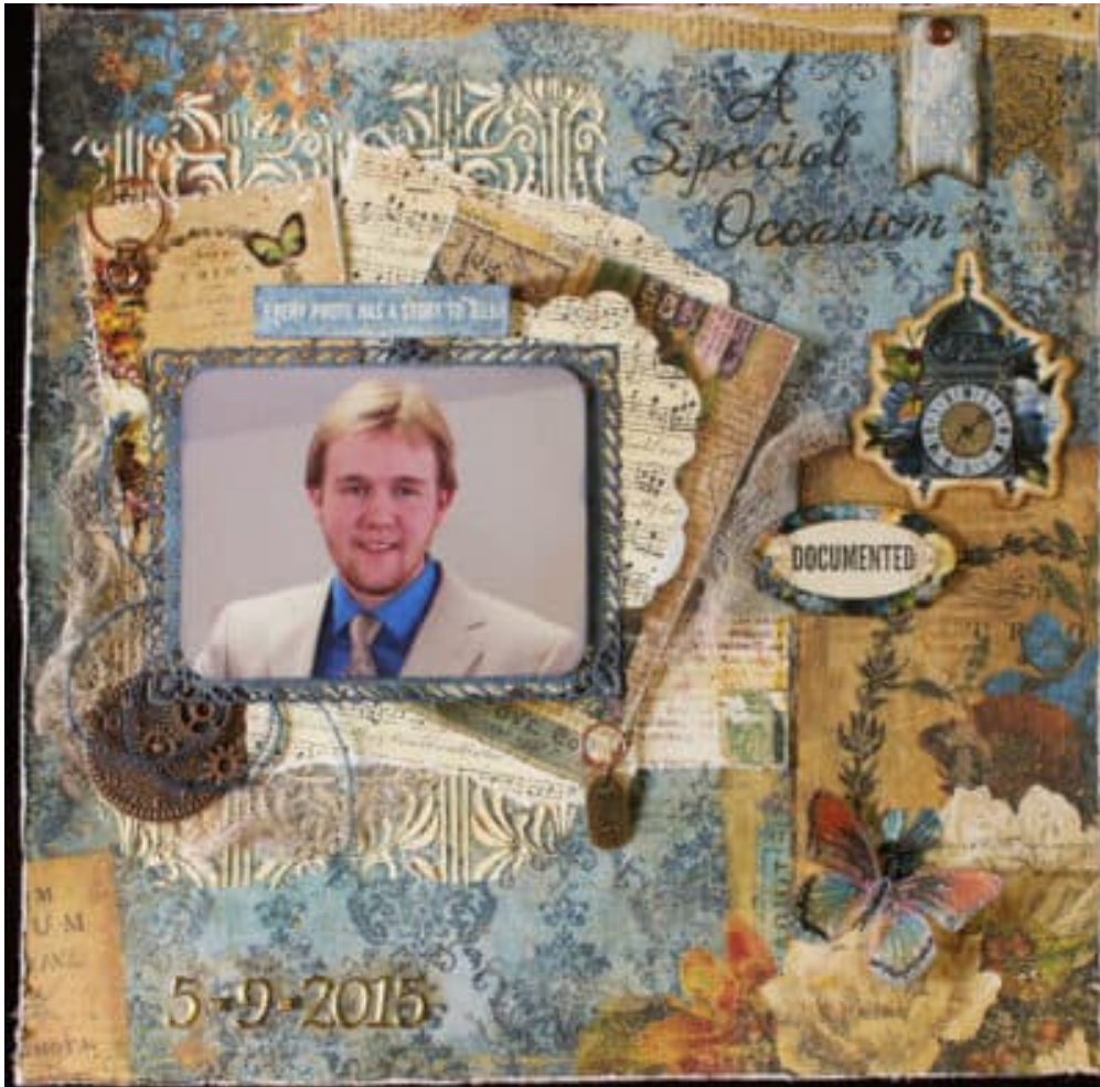
Layout by Elizabeth