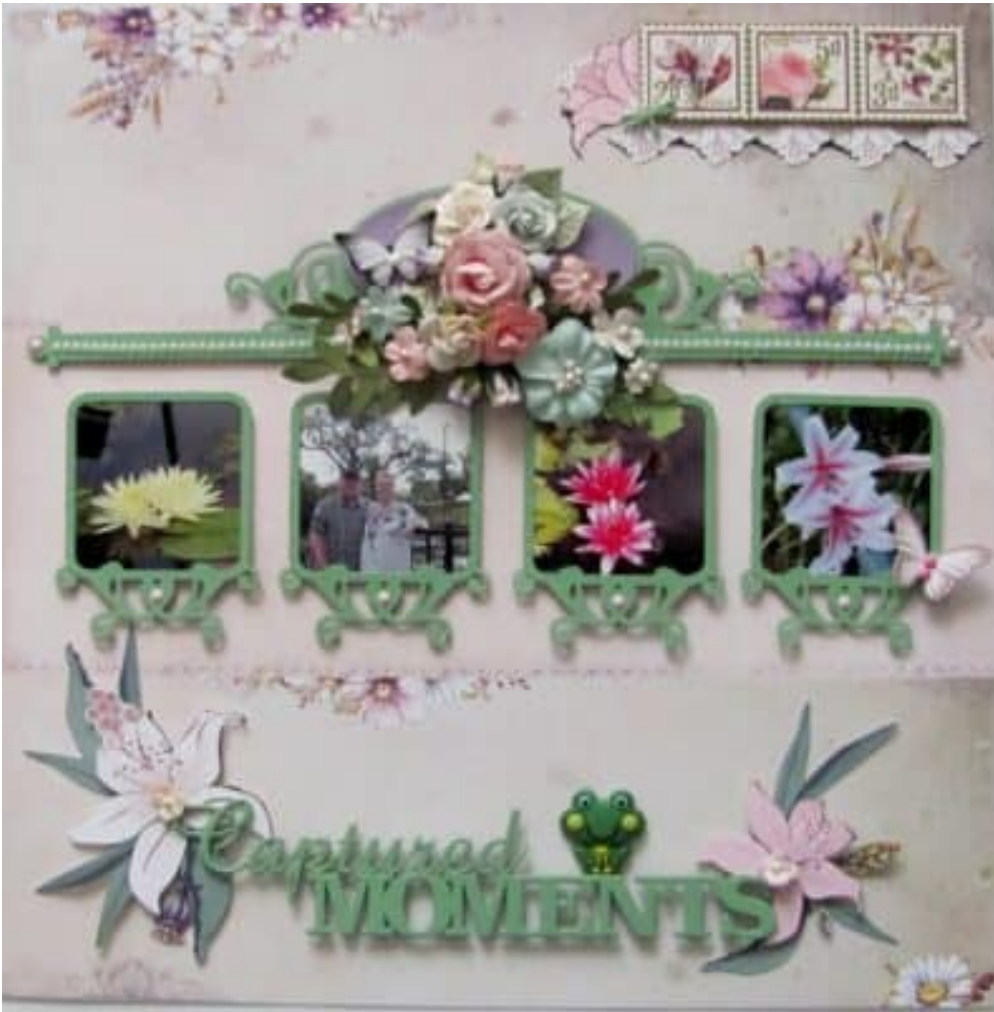
Layout by Kelly