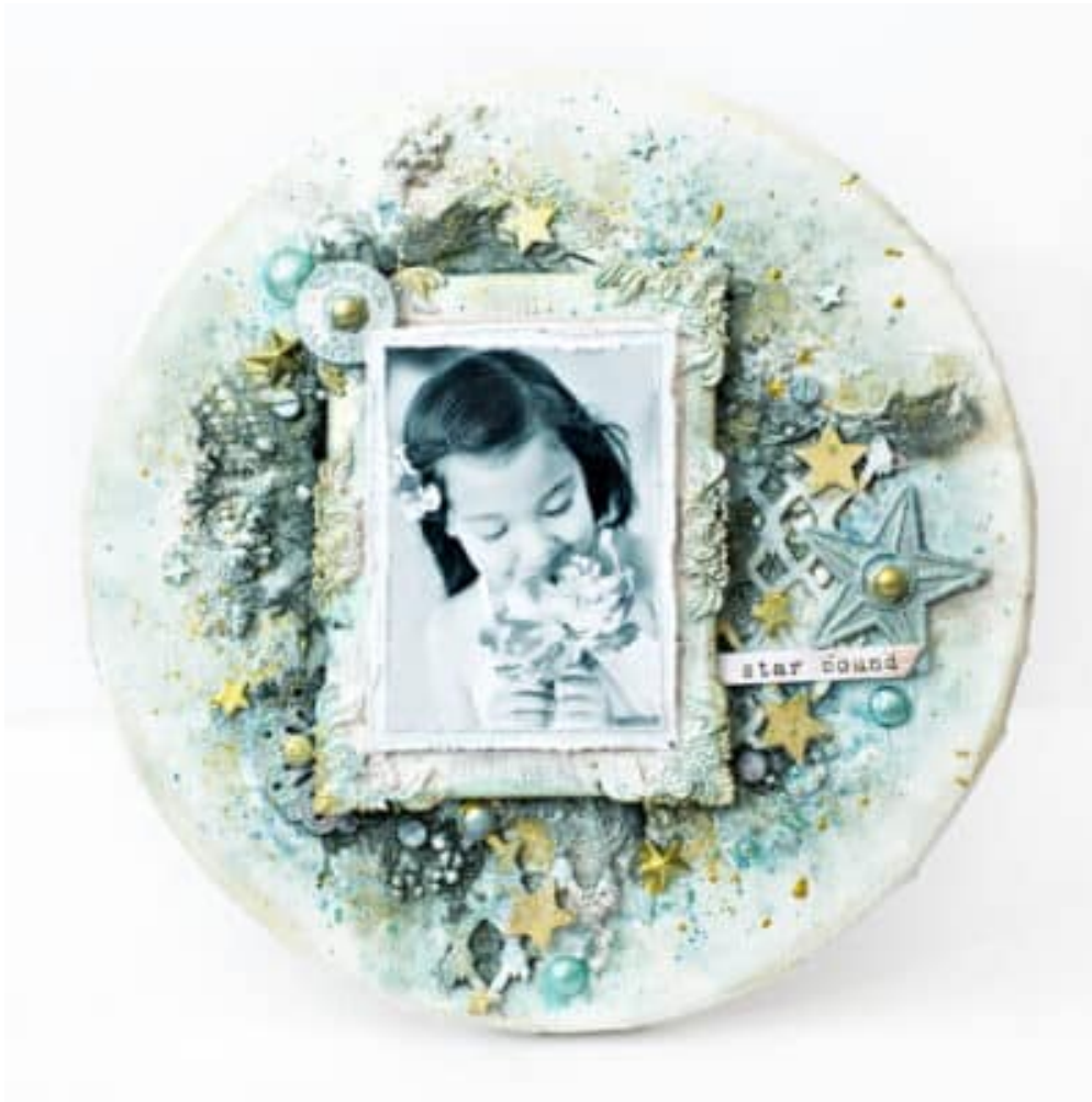
Layout by Tiffany