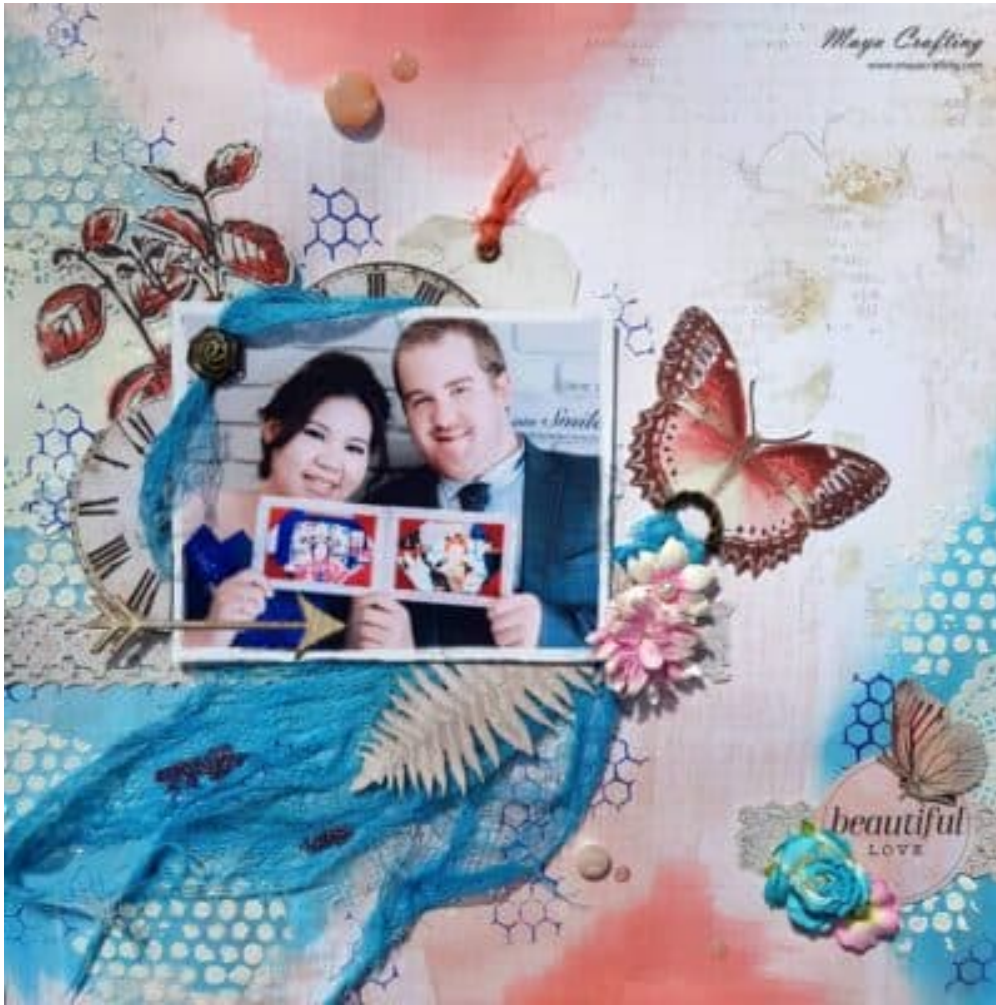
Layout by Maya