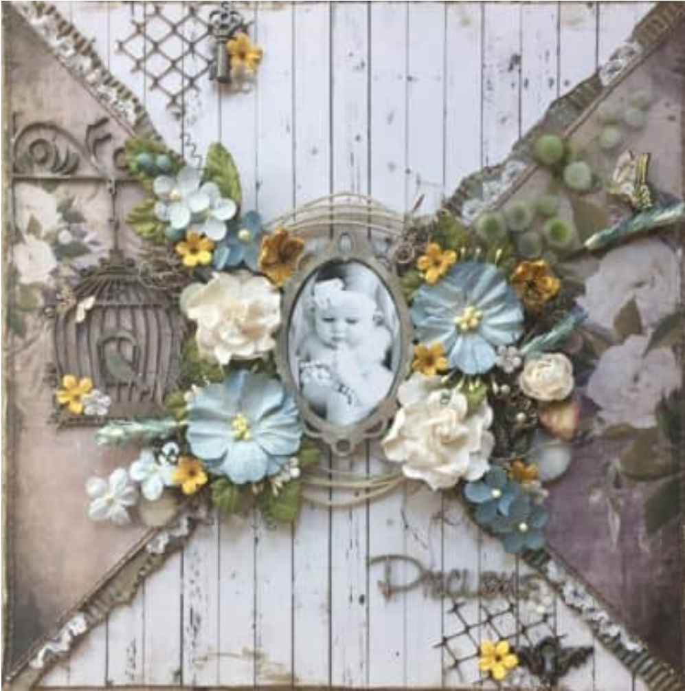
Layout by Cheryl