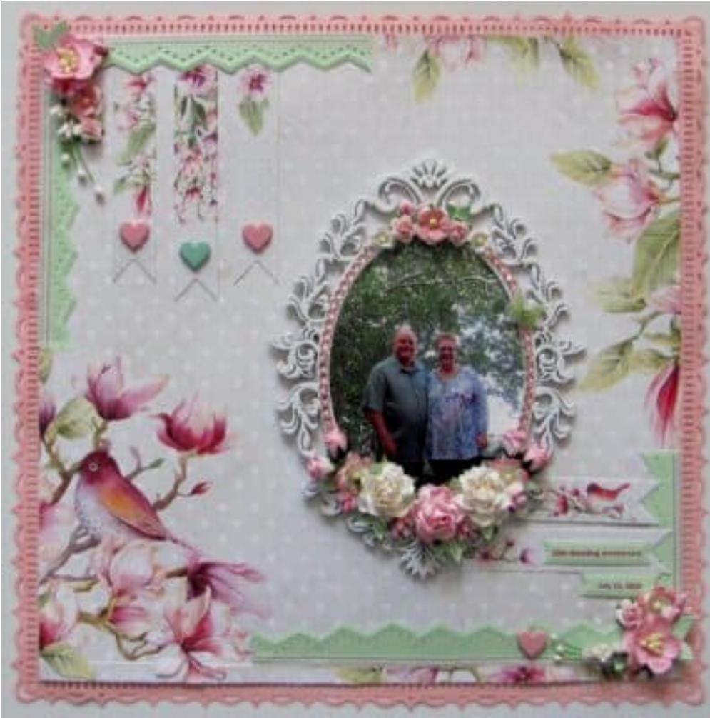
Layout by Kelly