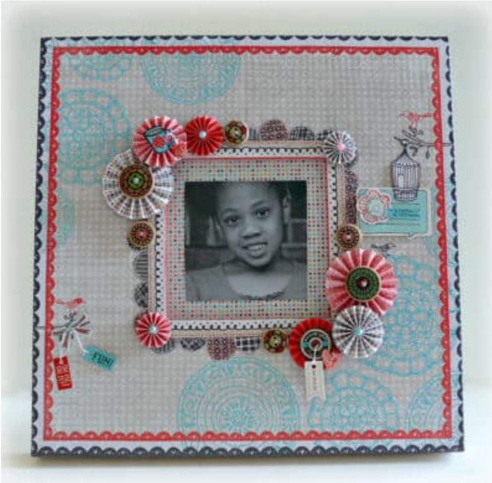
Layout by Jenniwen32