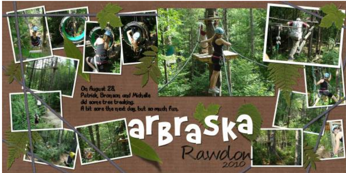
Layout by Cassel