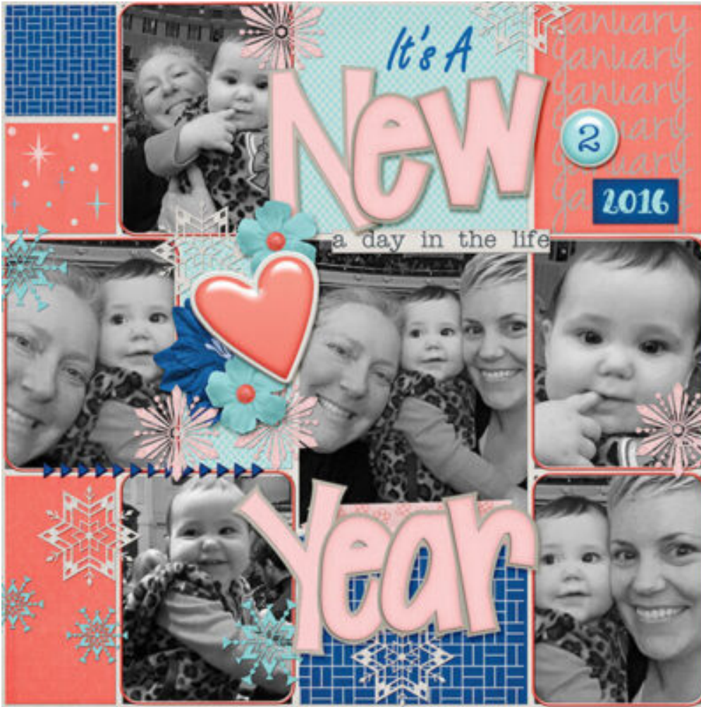
Layout by Jakrn