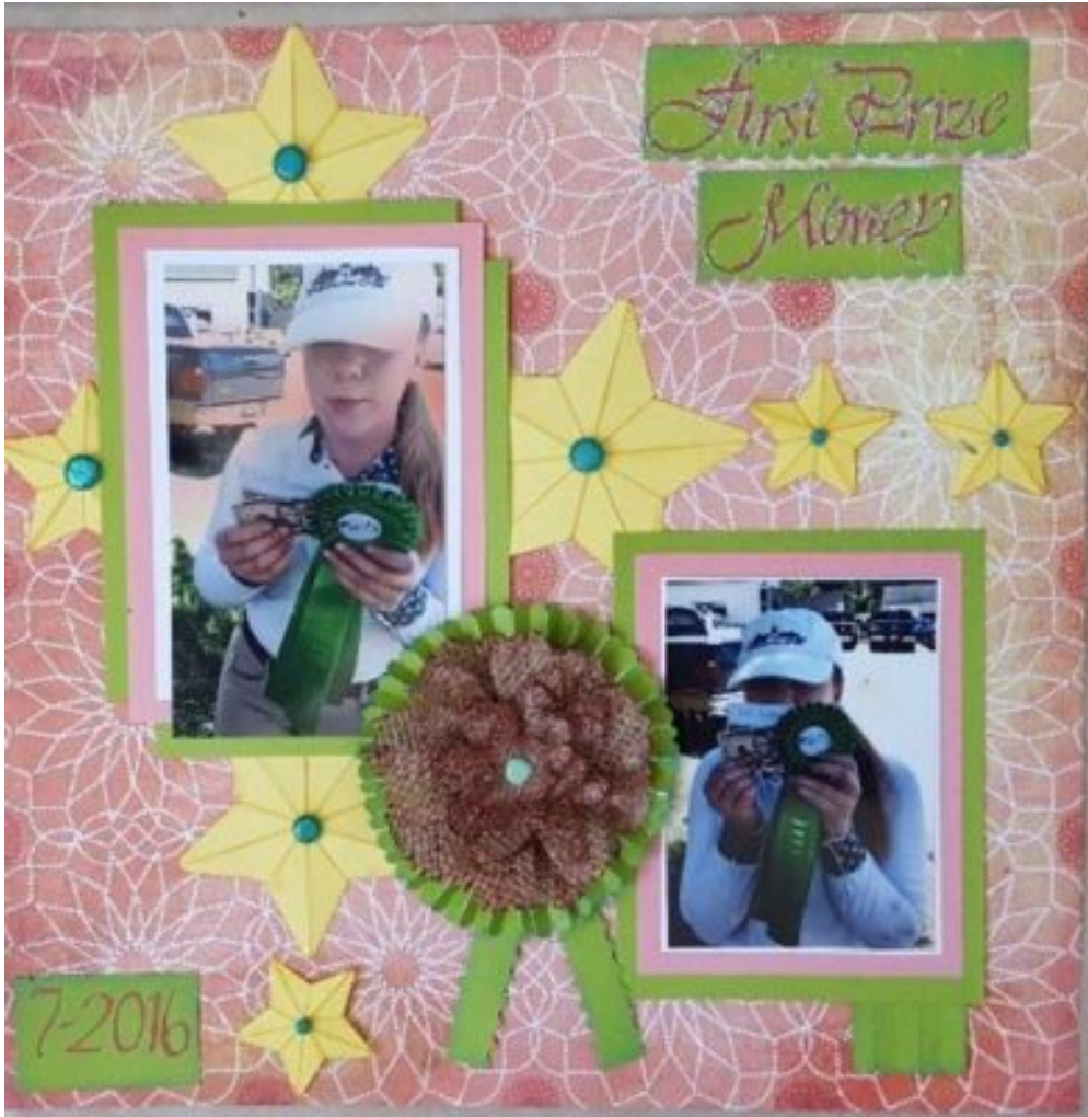
Layout by Lovette