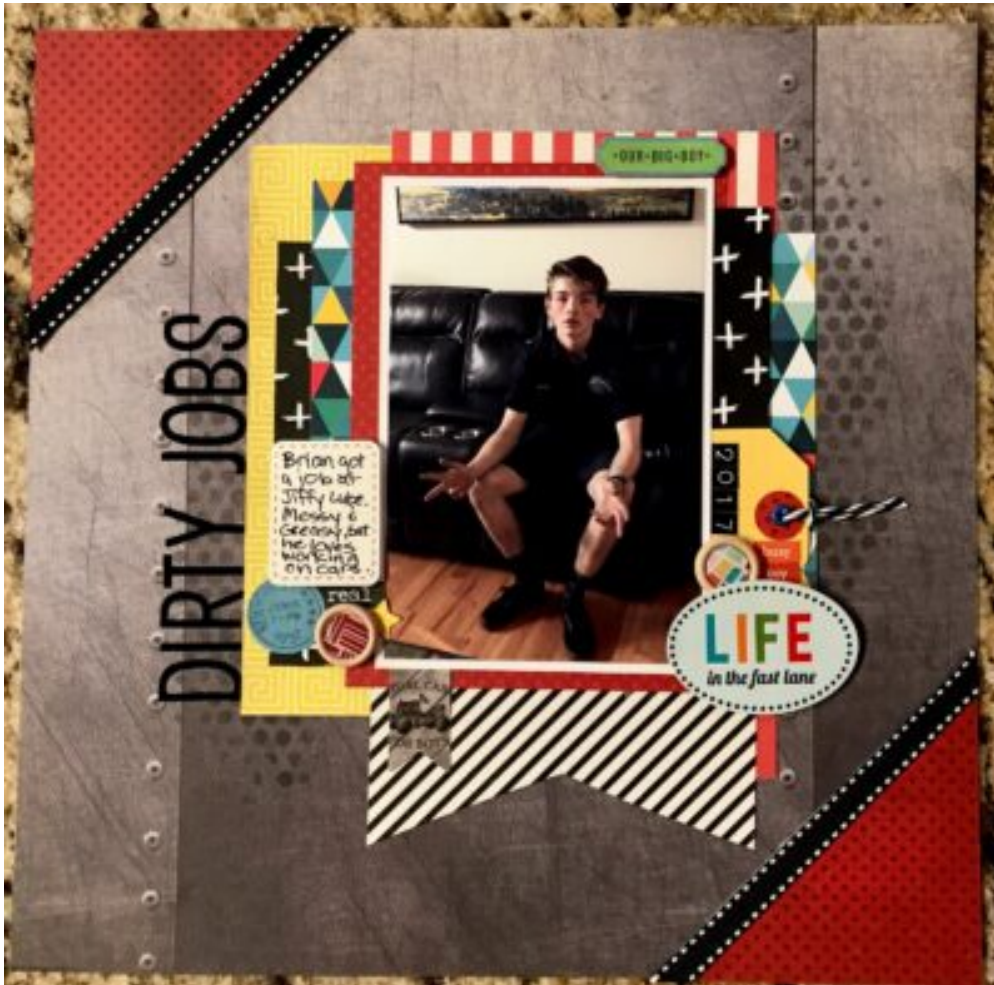
Layout by Ccarter