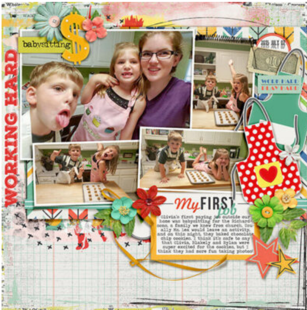
Layout by Cheryl