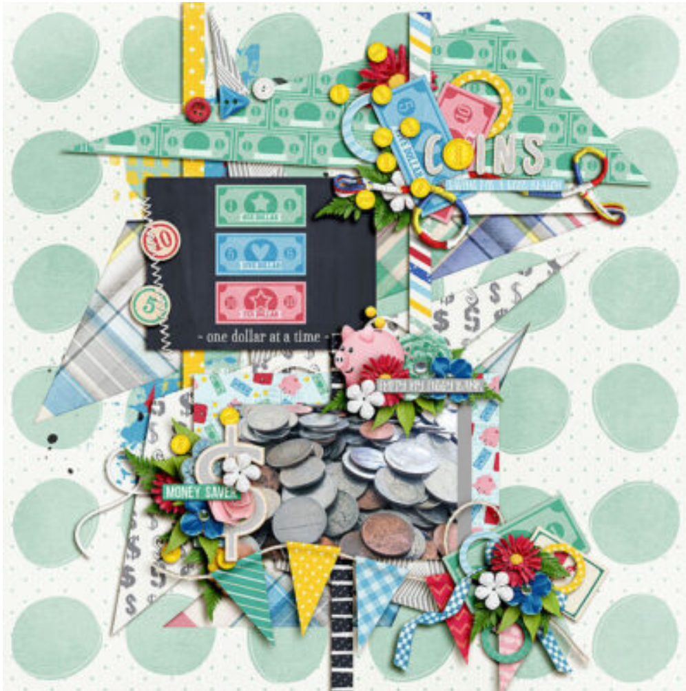
Layout by Neverland Scraps