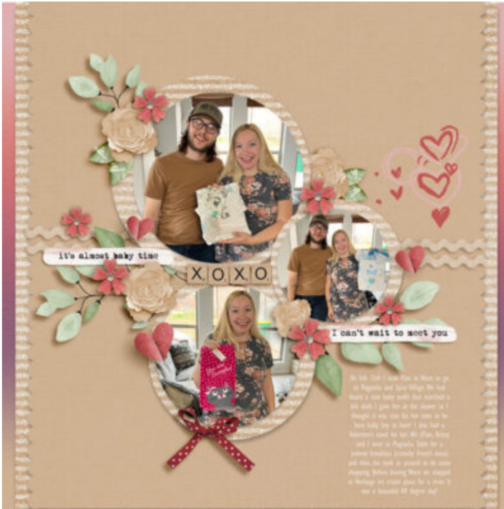
Page by Glori2