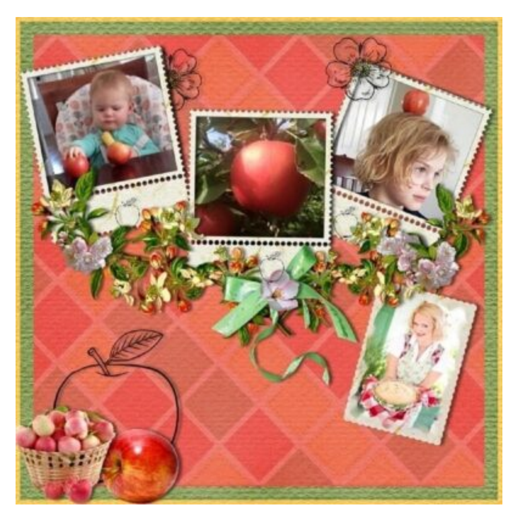
Layout by Maureen