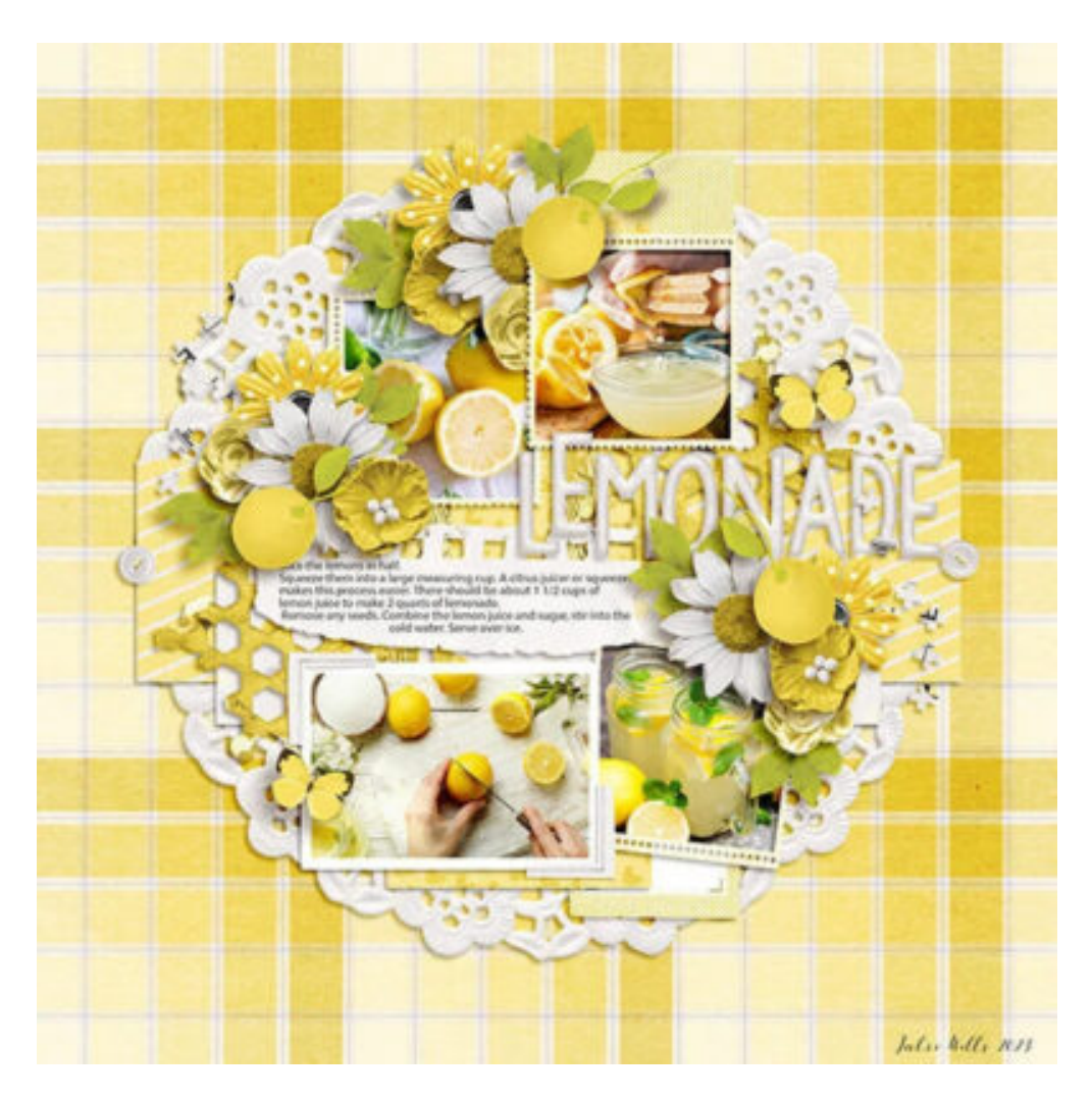
Layout by Julie