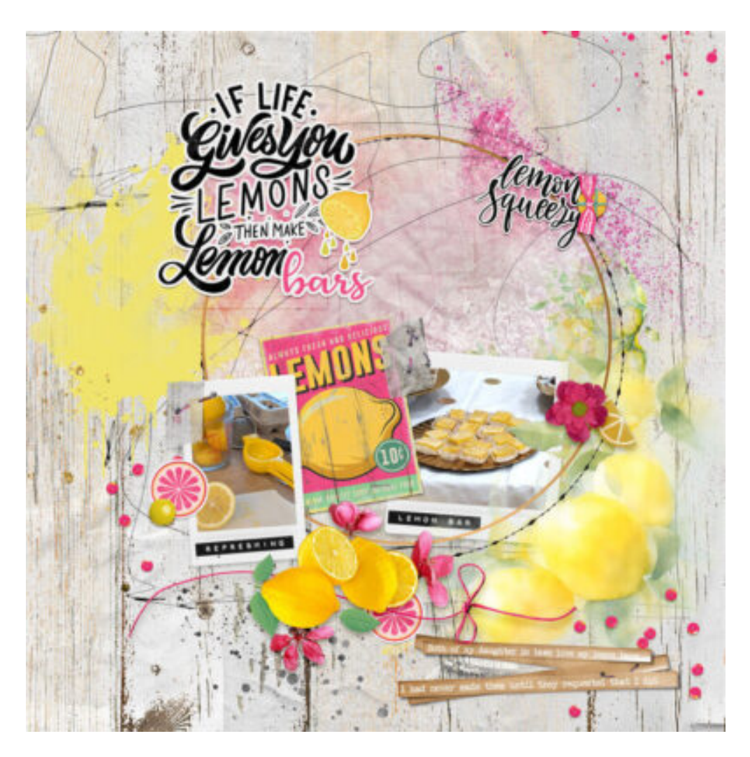
Layout by TiffanyScraps