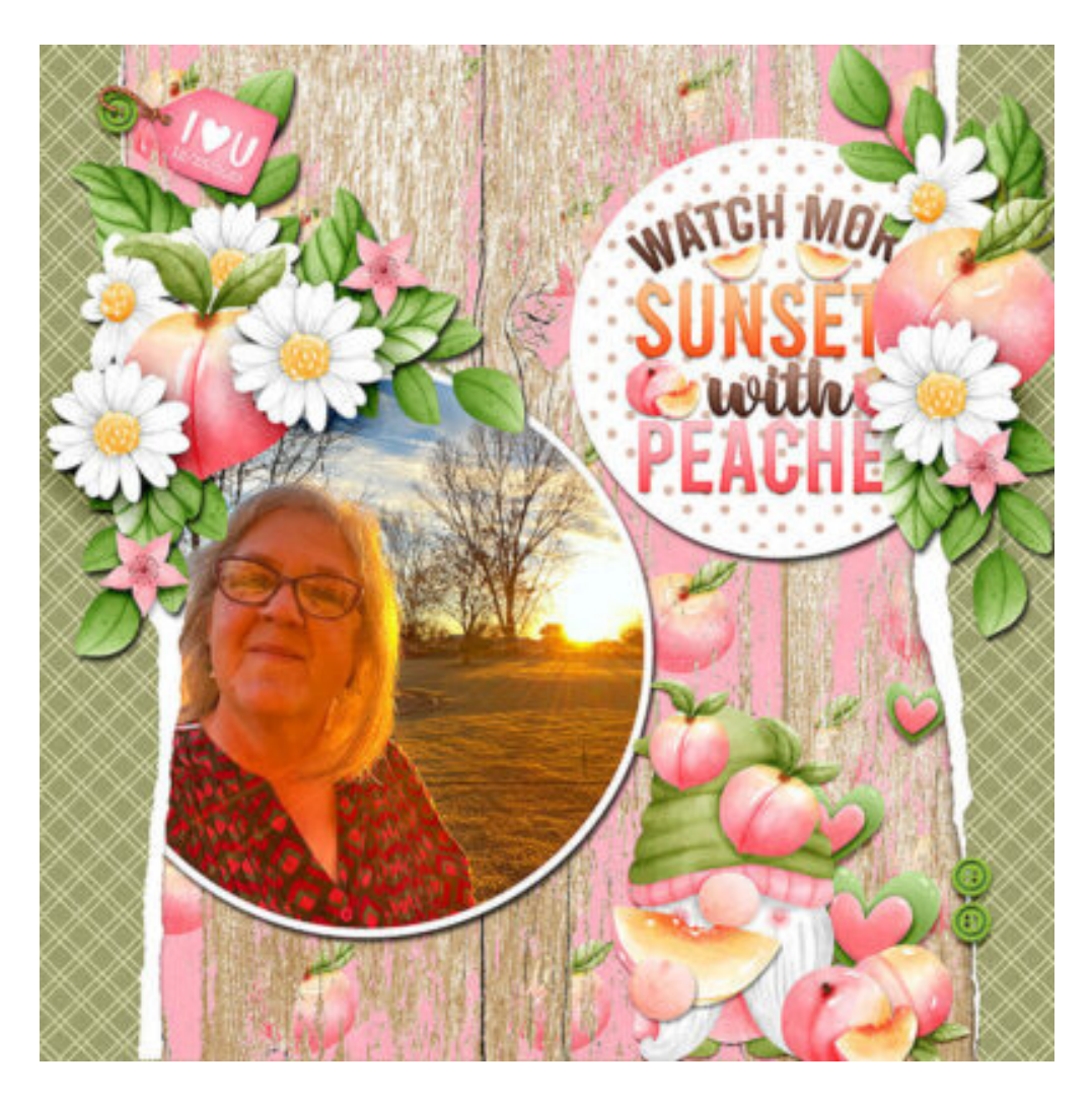
Layout by Kim