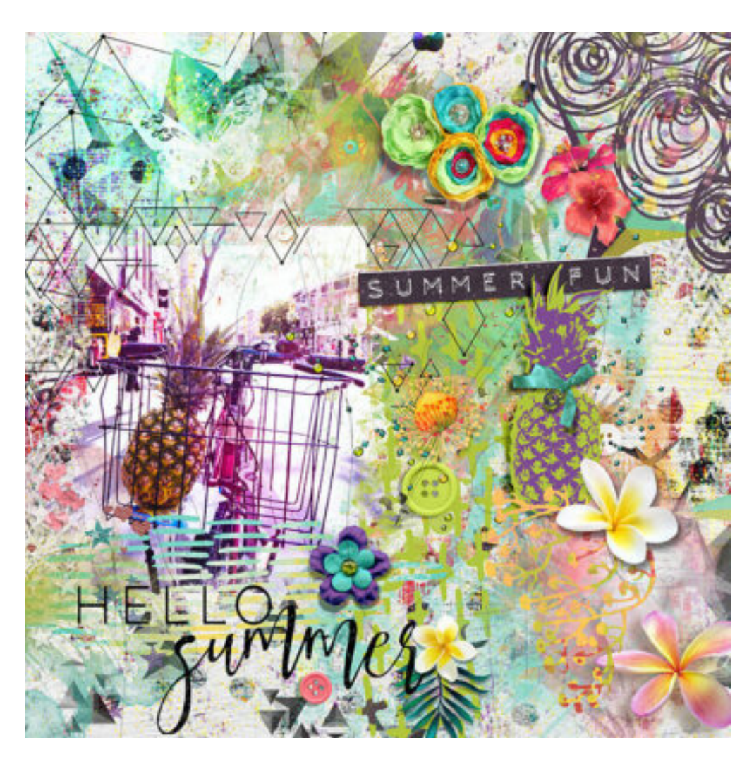
Layout by Cinderella_cindy