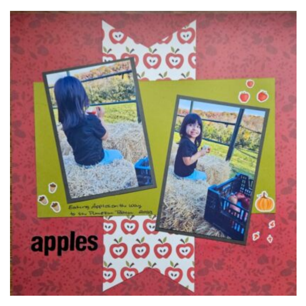
Layout by Coleen