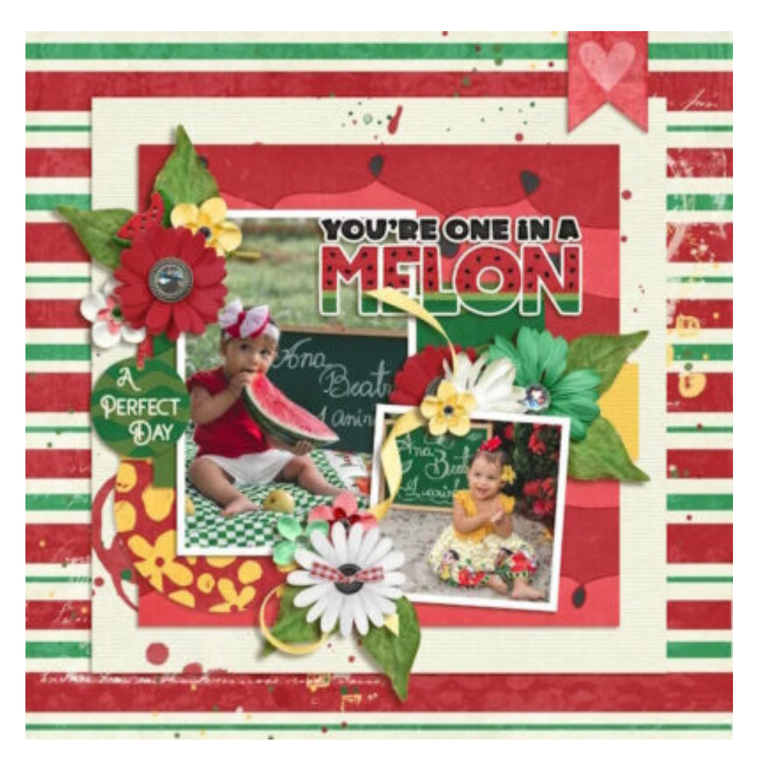
Layout by Lou