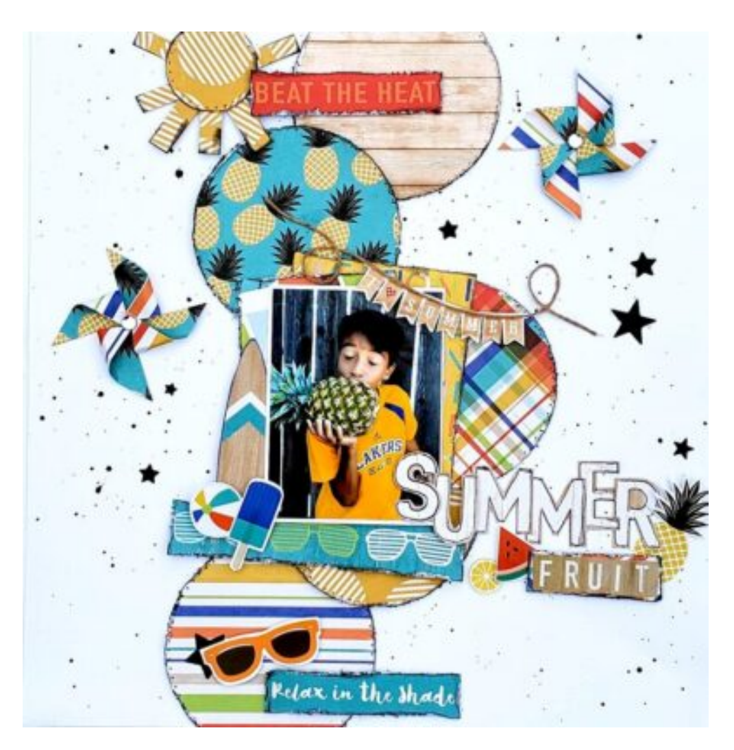
Layout by Scrapsnstuf