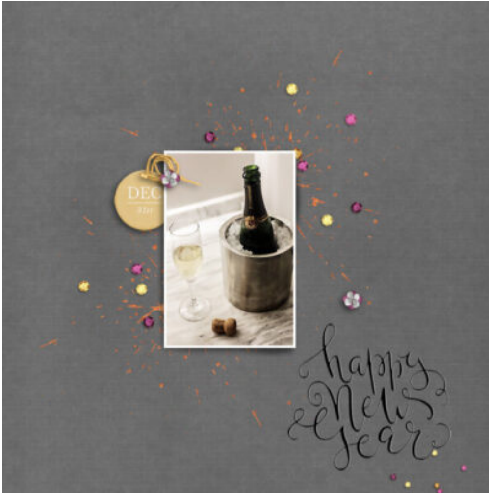
Page by Sylvia